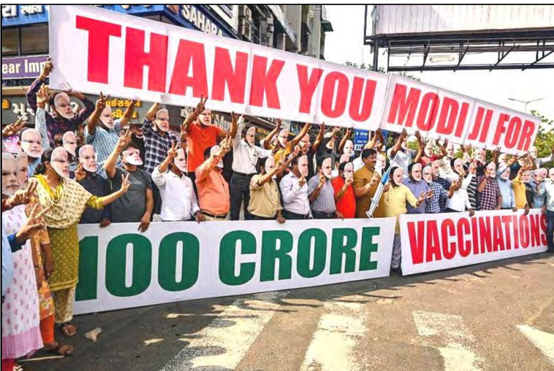
India nung coronavirus vaccine dose billion ka agütsüba nüngtem nung October 24, 2021 nü Ahmedabad nung Ato kilonser, Narendra Modi mesükba noksa inoker benjungtepba noksa nung angur.

Mufti-isa, tepuokdak alirtem chiochtsüla, rongsenkettsüng tanaben asentenshitsü atema inyaksüla aser Kashmir nung nüburtemi tamang katettsüsa sorkari inyaksüla, ta ashi.