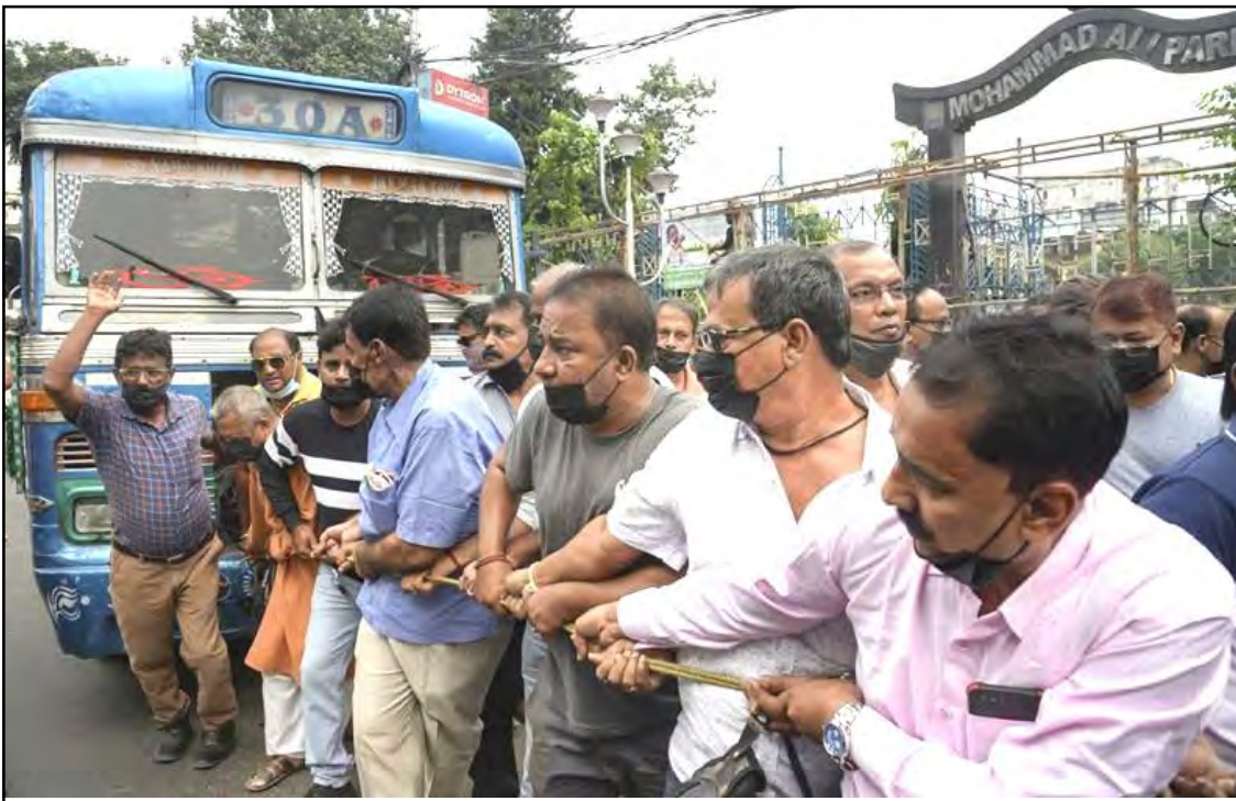
Kolkata, October 24, 2021: India nung petrol aser diesel totzü jenjang maneni atuba anema Amongnü Kolkata nung West Bengal Bus & Mini Bus Owner Association nung züngsemtemi longkak aita bus ka lisü agi sendaker atsüba noksa nung angur.