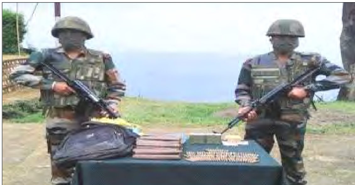
October 23, 2021 nü Serchhip Battalion-i Mizoram kübok Champhai district nung mita aodang prangpong-injang aika ngutetogo. Sepaitemi Tiau Kai village council züngsemtem anir mita aodang arem nung prangpong injangtem miima aliba angu. Iba tesem nung live rounds 100, Neogel Gelatin sticks 38 aser Detonators 251 ngutet.

"Iba maparen dak sendakba nung anogoshia PCB nem osang agütsütsüla," ta Misra-i shisem.