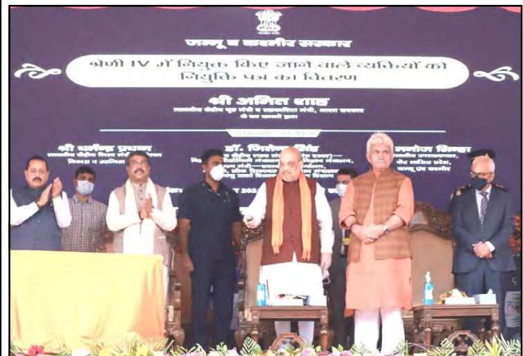
Jammu, October 24, 2021: Amongnü Jammu nung Union Home Minister, Amit Shah-i terenlok project balala semzüksüba aser project tasen atema lung azüngtsüba noksa nung angur.

Tesüiba anogo pezü tashi atonga sorkari petrol aser diesel jenjang tuogo.