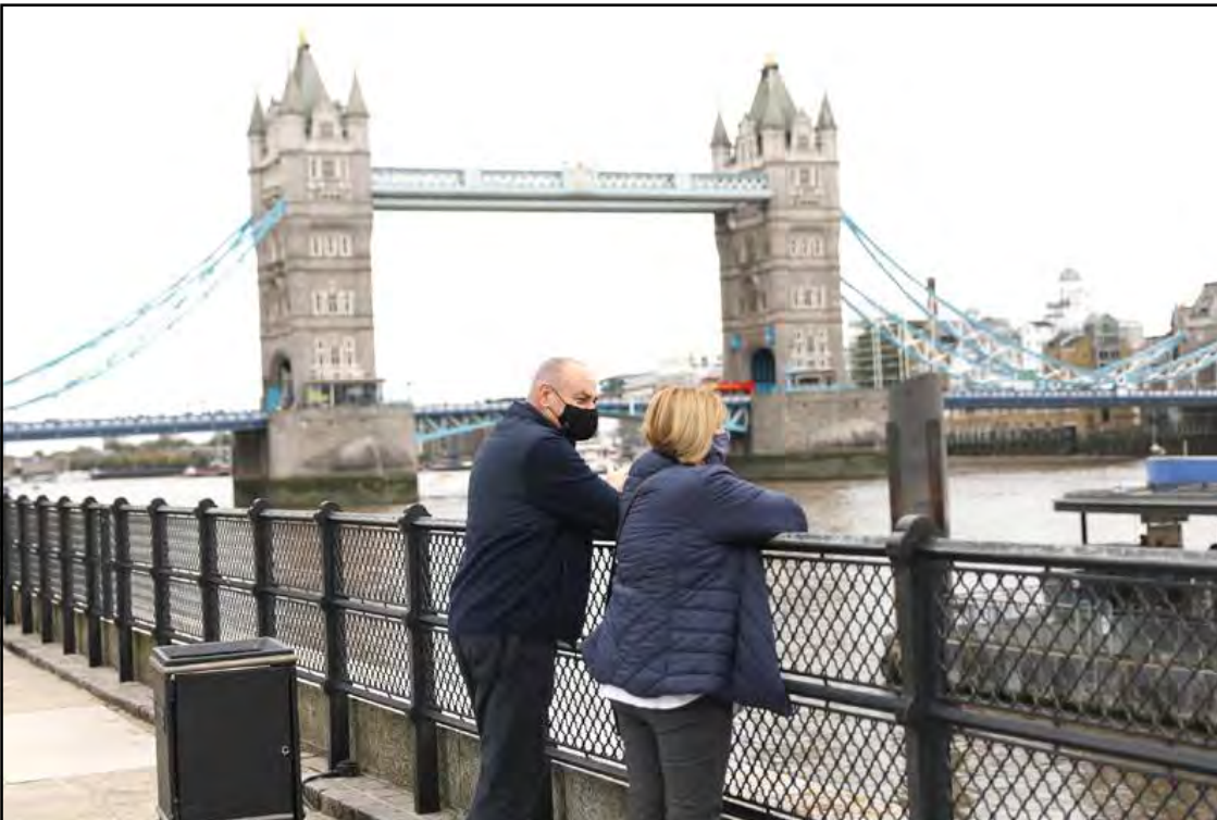
Nisungtem face mask agir London, Britain nung aliba Tower Bridge anasa nokdaka aliba noksa ka yangi angur. Honibarnü Britain nung nisung 44,985 dak COVID-19 positive puteta iba linük nung coronavirus agi meneper nisung 8,734,934 jungogo, ta ketdangsürtemi sangdong ka ajanga ashi.