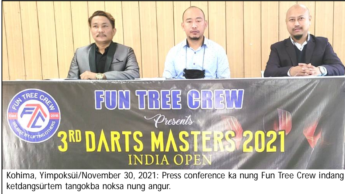
Kohima, Yimpoksüi/November 30, 2021: Press conference ka nung Fun Tree Crew indang ketdangsürtem tangokba noksa nung angur.