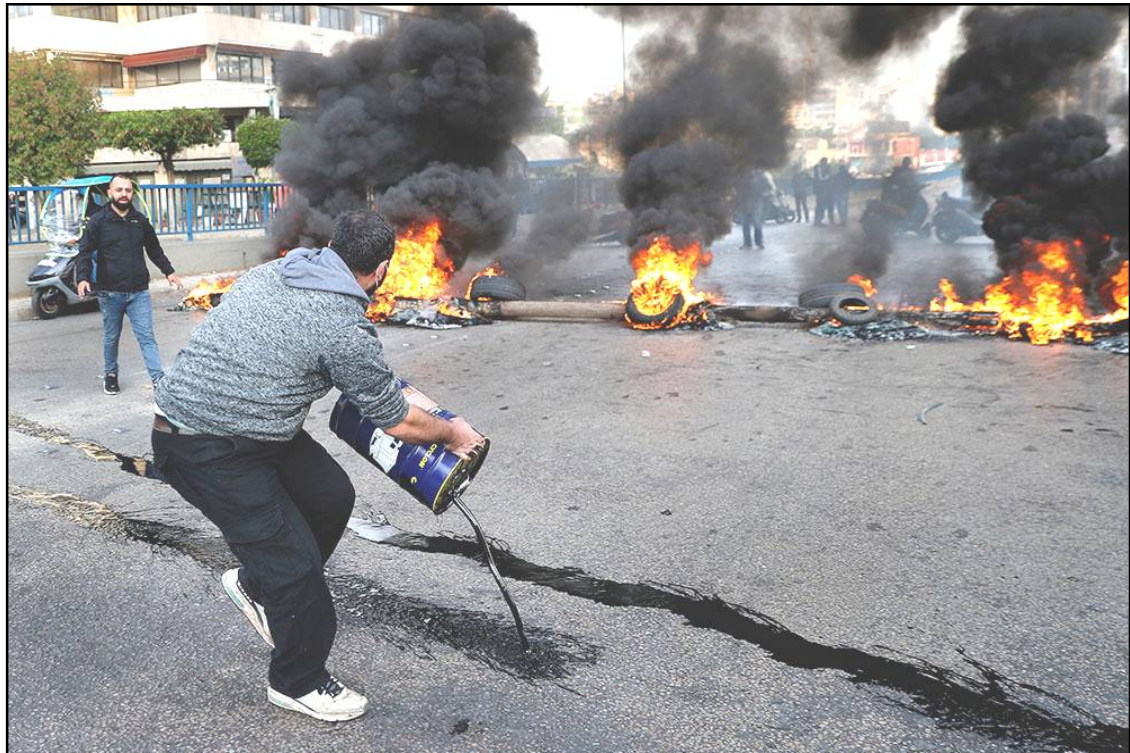
Chiyongtsü nung jenjang temlokba mechi Lebanon yimtiba, Beirut nung aliba international airport tsütsüi aolen lenmang mokdanga longkak aitertemi tyre rongka aliba jakdang totzü ainba noksa nung angur.

Democrats telok nungi timba lir. Asenoki akhi mapang nungi dangar den amalitepa aruba yimsü lir aser Sweden tejakleni anitsü asoshi kechi inyaktsü nüngdak, aji inyaktsü renema alitsü." Right-wing opposition Moderate Party lenir Ulf Kristersson-i administration tasenba ya ita tuko atema caretaker government ka lir aser 2022 küm September agitsü aliba election nung parnok takok anga tulubo mongutettsü, ta ashi. Andersson-i Sweden nung tashi maittiba sorkar ka anitsü aser opposition telok asemi yangluba budget nung ajemdaker yimsü asütsü lir. Taoba hopta opposition temi benokba budget amendment tem parliament ajanga agizüka liasü, koba ajanga sorkari senotsü indoktsü sentong yangluba kanga sashia melenshitsür. Tetsür-tebur telemsa mali maparen balala inyakba ren nung Sweden ya Europe nungbo linük timba jakdang lir ta züingshia aru, saka Andersson jakdang tetsür shinga iba menden tematiba nung mena meliasü.