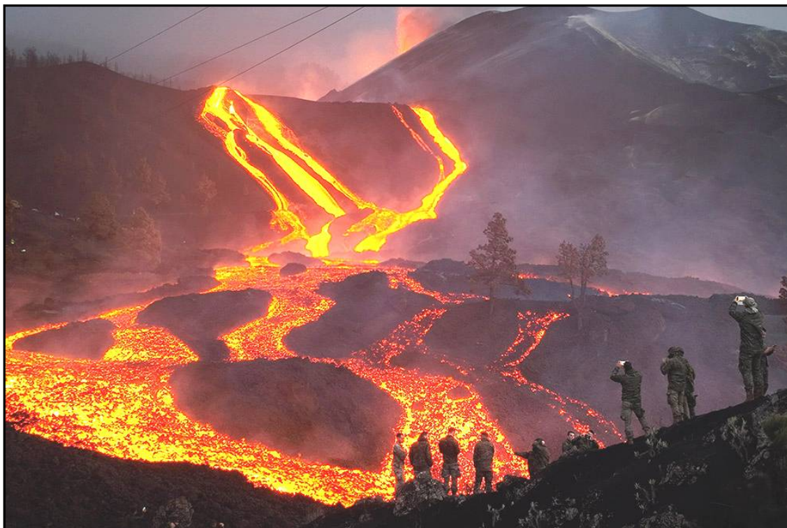
La Palma, Spain kübok Canary asetkong nung volcano maneni pokteta adokba ajanga lava yimzüka aluba anasa Spain sepaitem nokdaka aliba noksa nung angur. La Palma nung lava agi ki 2,500 dak tema raksatsüogo.