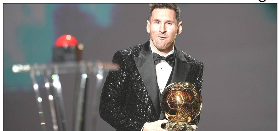
Paris, Yimpoksüi/November 30, 2021: Theatre du Chatelet, Paris nung 65buba Ballon d'Or sentong agiba mapang, Paris Saint Germain nungi asayar Lionel Messi-i Ballon d'Or Trophy agizüker sülen tangokba noksa ka yangi angur. Messi-i Ballon d'Or Trophy tenetbenbuba takok angur asütsü.

Award ya Stanley Matthews-i akokba mapang 1956 nungi tenzüka küm shia agüja arudar. Arish küm 33 tain Lewandowski-i goal 41 tashi inokja Bundesliga atema season ka nung goal timba record yangluogo, koba Germany nunger asür Gerd Müller dang nungi goal kati timba asütsü. February nungi September tashi tetoktepba asayamung ajak nung Lewandowski-i Bayern atema game 19 nung atonga goal idaktsü aser Bundesliga game 16 nung pai Gerd record memenep. Tan season nung Bayern Munich atema Lewandowski-i asaya 20 nung goal 25 idaktsü. Taküm, Poland atema asaya 12 nung Lewandowski-i goal 11 tashi idakja International game 128 nung goal 74 idaktsür asütsü, koba goal 6 agi Messi dang nungi tajemba asütsü. Chelsea aser Italy midfielder Jorginho-i London club (Chelsea)-i Champions League aser Italy team-i European Championship takok angutsü asoshi shilem tajung agiba sülen, pai point 460 ngua jenjang tasembuba tongtet. Real Madrid aser France team nung forward asayar Karim Benzema-i point 239 ngua jenjang pezübuba tongteta Iiasü. Barcelona atema Putellas-i shilem tajung agiogo aser game 42 nung lai goal 26 inoktsü. Champions League final nung Barcelona aser Chelsea na