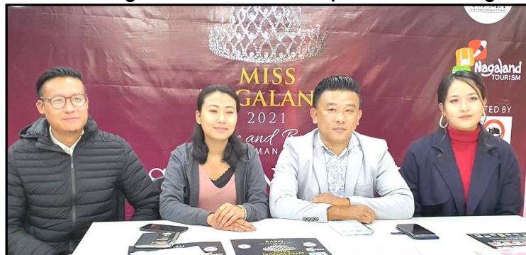
Kohima, Yimpoksüi/November 30, 2021: Hotel Crescent nung press conference ka agiba mapang BASN ketdangsurtem külemi tangokba noksa yangi angur.

Kohima, Yimpoksüi/ November 30, 2021 (TYO): Miss Nagaland 2021 indang contestant 16 nungi par pezüi iba beauty pageant tetoktepba nung shilem magütsü lemtet, ta Mongolbarnü sangdong ka ajanga iba pageant tayonger Beauty and Aesthetic Society of Nagaland (BASN)-i metetdaksü.