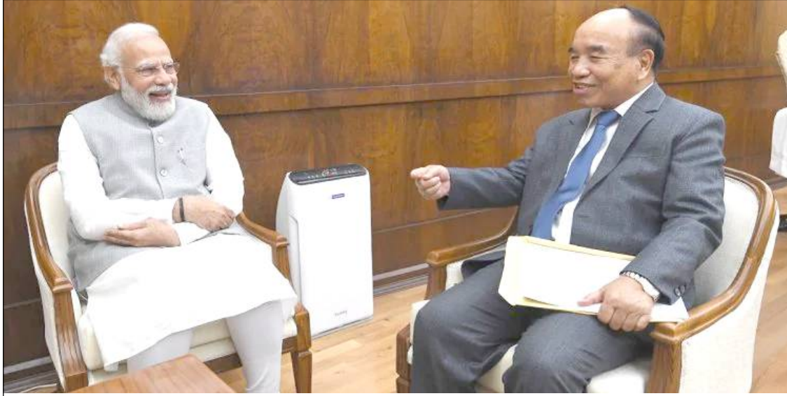
Mizoram chief minister Zoramthanga-i Mongulbarnü New Delhi nung Prime Minister Narendra Modi den ajurutepdang tangokba noksa nung angur.

Aizawl, November 30, 2021 (Agencies): Mizoram chief minister Zoramthanga-i Mongulbarnü New Delhi nung Prime Minister Narendra Modi den ajurutep.