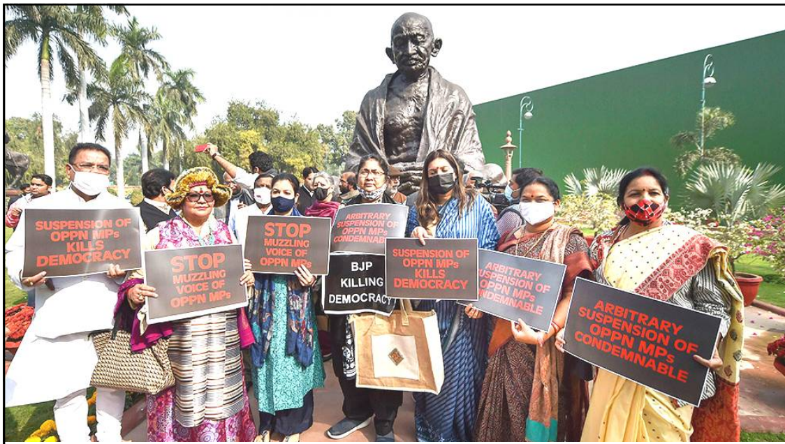
Rajya Sabha MP temi Winter Session atema Parliament House nungi parnok suspend sütsüba anema New Delhi nung longkak aitba noksa nung angur.

New Delhi, Yimpoksü/ November 30 (Agencies): Opposition party nungi members of Parliament 12, shirnok Hombarnü winter session atema Rajya Sabha nungi suspend sütsüogo, parnoki Bodhbarnü nungi tenzüka Mahatma Gandhi kerak yanglu jakdang longkak aittsü.