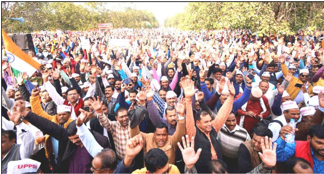
Lucknow, Nov 30: Lucknow nung Mongolbarnü Eco Garden nung Old Pension asüngsashitsü atema rally ka ayongzüka agiba mapang primary shikshak sangh nungi züngsemtemi shilem agiba noksa nung angur.

Iba technology yanglutsüba atema Singh-i Ministry of Electronics & Information Technology aser UIDAI (Unique Identification Authority of India) dang pelaba lemsatepogo.