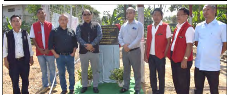
November 6, 2021 nü CISHR Dimapur nung power sub-station lapoktsü sülen Power Advisor Tovihoto Ayemi den power department ketdangsürtem aser Diphupar Village Council züngsemtem o GBs külemi agiba noksa angur. (Dimapur, November 6)

Dimapur, November 6, 2021 (TYO): November 6, 2021 nü Power Advisor, Tovihoto Ayemi-i Christian Institute of Health Sciences and Research (CISHR), Dimapur nung 10 MVA Sub-Station ulushiba lapoktsüogo.