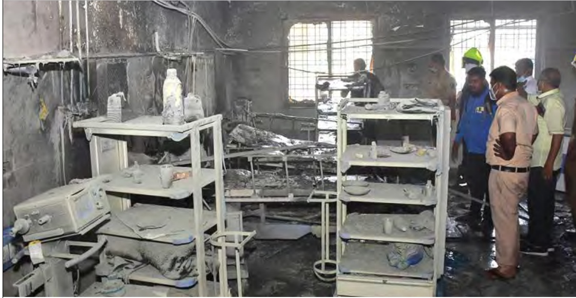
November 06, 2021 nü Maharashtra state kübok Ahmadnagar nung aliba sorkar hospital COVID-19 ward nung mi lendong atalokba sülen nisungtem adenshia reprangba noksa nung angur. Iba lendong nung nisung 11 asü.

Ahmednagar, November 06 (Agencies): Honibarnü Maharashtra kübok Ahmadnagar District Hospital nung mi lendong nung shiranger 11 rongset aser kasa hospital nung aliba Intensive Care Unit (ICU) nung shiranger trok mi agi mejungi arong.