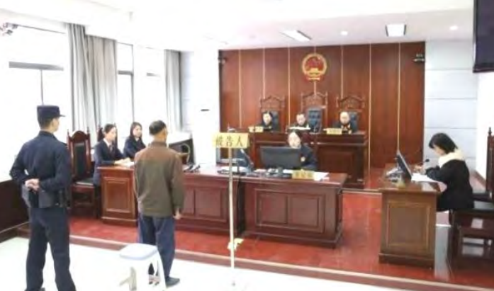
China nunger Court ka nung CAG züngsem ka anema ken o angadanga mapang tangokba noksa nung angur.

November 06, 2021: China rongnung arrshi küm 80 tantsür nung communist sorkari kata küm ana ser ita pezü Khristantem anema inyakra tepuokdak ayutsü obendang mapang sorkar ketdangsertemi agütsü.