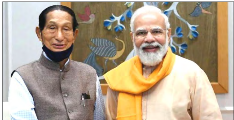
Honibarnü taoba Nagaland CM SC Jamir-i Prime Minister Narendra Modi den ajurutepdang agiba noksa angur.

New Delhi, November 6, 2021 (Agencies): Taoba Nagaland Chief Minister aser Congress lenir tejen SC Jamir-i Honibarnü Prime Minister Narendra Modi den ajurutep.