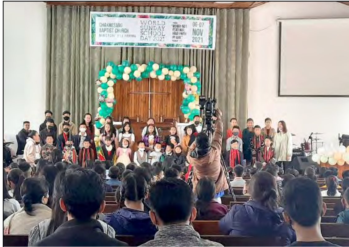
November 06, 2021 nü Kohima nung Chakhesang Baptist Church Ministers' Hill (CBCMH)-i ayongzükba World Sunday School Day sentong nung Lerie School team-i Lai azüngdang tangokba noksa nung angur.

Kohima, Yimpoksüi/ November 06 (TYO): Honibarnü Kohima nung Chakhesang Baptist Church Ministers' Hill (CBCMH)-i "Worry not, fear not, have faith in God" omen nung ajemdaker World Sunday School Day mongogo.