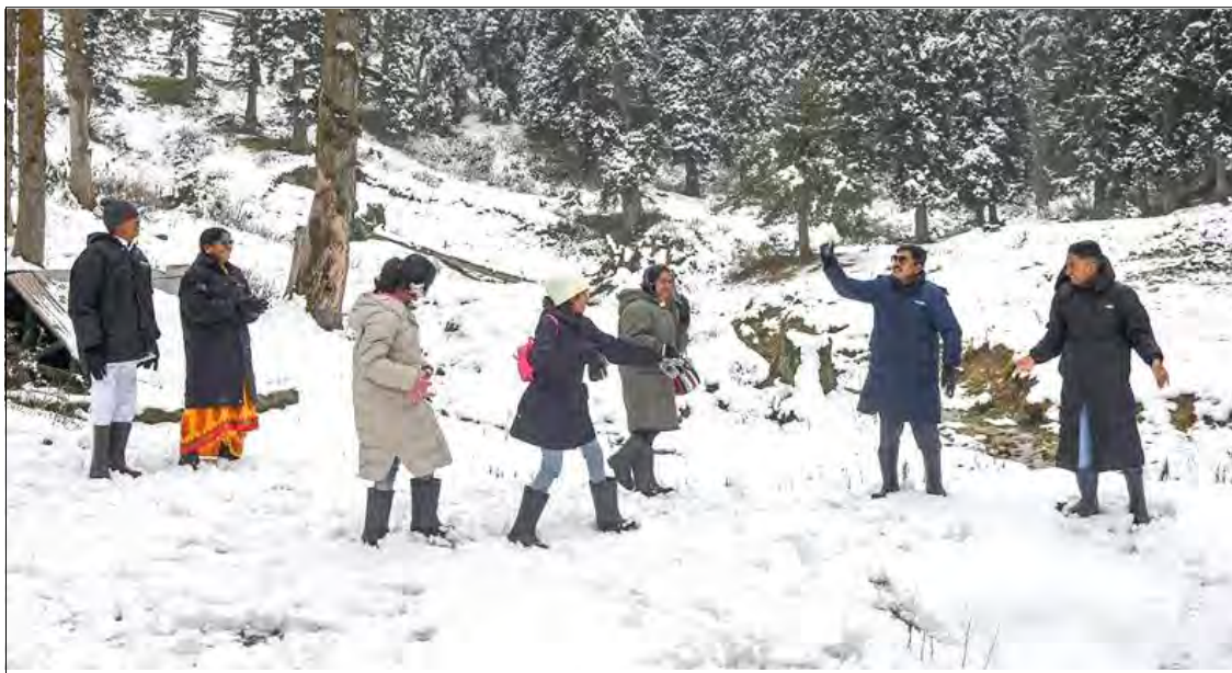
November 06, 2021 nü North Kashmir kübok Barramulla District nung aliba ski resort nung raliwalirtem rürjep agi asayaba noksa nung angur.

"Joko küm ka jungogo, saka kechiba sorkari onok den mejembir. Yamai mapang talangka longkak aitba nenoki meteter ma? Sorkari kechi inyakkdaksüner, onok den ken o jembitsüla, onok renema dang lir," ta pai ashi.