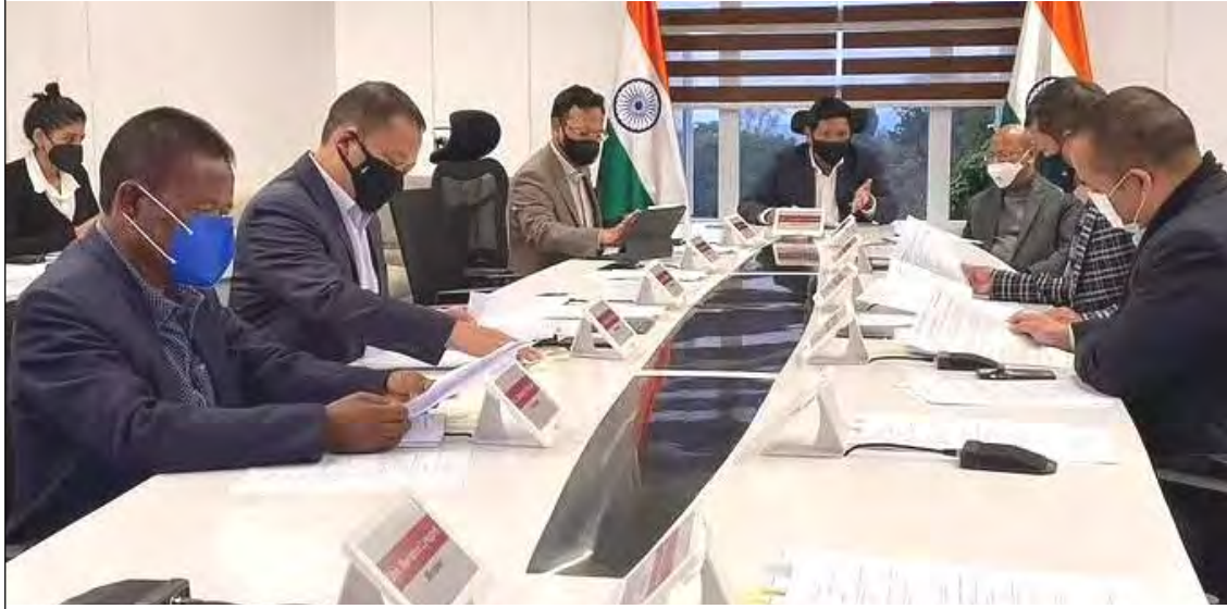
Meghalaya nung district tasen ka kümtettsü atema state Cabinet senden amenba noksa nung angur.

Shillong, November 6, 2021 (Agencies): Meghalaya nung district tasen ka kümtettsü atema state Cabinet-i Hokolbarnü telemtetba agiogo. Cabinet-i Mairang civil sub-division nungi district akümtsü molunga agizük. "District tasen dang Eastern West Khasi Hills district ajatsü" ta Deputy Chief Minister Prestone Tynsong-i ashi.