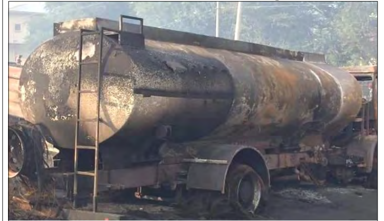
Sierra Leone yimtiba Freetown nung totzü abenba gari lendong ataloker sülen tangokba noksa nung angur.

Freetown, Yimpoksüi/ November 6 (Agencies): Hokolbarnü Sierra Leone yimtiba Freetown nung totzü abenba gari ka tsükteper apokba sülen nisung 91 süogo, ta central morgue aser local ketdangsür kati ashi.