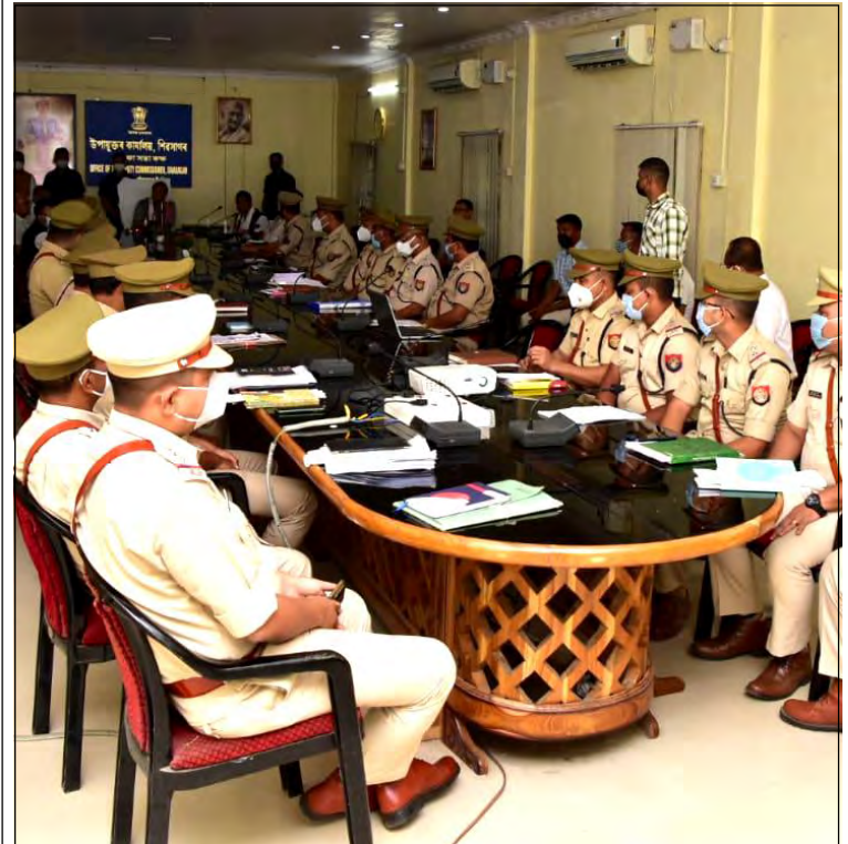
Sivasagar indang Commissioner office nung Assam Chief Minister Himanta Biswa Sarma-i Sivasagar aser Charaideo district tem nung police ketdangsürtem den ajurutepa senden amenba angur. Senden nung CM Sarma-i police station ajak nungi ochimashi agientsü nenshia metetdaksü aser district ana nung law & order osang metetpela. (Sivasagar, November 6)

Iba ya mapa küma inyakra, ki kiburi (House Owner) state sorkar nem ki para nungi shilem ka agütsütsüla aser ibaji magütsür Act kübok temerenshi alitsü. State aser Centre sorkartemi kechisarena nung jenjang atuba maziükteter aser mapa shitak meinyaktetba kuli sayuogo, ta APCC-isa metetdaksü. "Assam nung iba Act mapa küma metenzüktsü atema onoki public dang lungkak aittsü aser sorkar nem takhangba agütsütsü ayongzüker" ta parnokisa ashi. [6:57 pm, 06/11/2021] AMONG TYY1: Nagaon police-i state balala nung mobile auyaba telok ka apu. IC Haibergaon, SI Taranga Patowary-i anir police telok kati Jharkhand kübok Sahebganj nung Raj Kumar aser Sonu Kumar Nonia na apu. Tena ket nungi auyaba mobile phone 134 tashi ngutetogo.