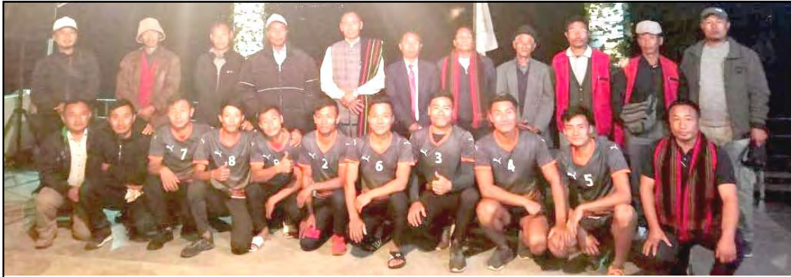
Asayamung akokba Michazou team aser ketdangsürtem tangokba noksa nung angur.

Kohima, Yimpoksüi/November 7 (TYO): Seiyhama Baptist Church-i ayongzükba 1buba Open Volleyball asayamung Michazou Mima-i kokogo. Asayamung final ya November 6 nü Kohima district kübok Seiyhama yimtsüing nung asayaa liasü.