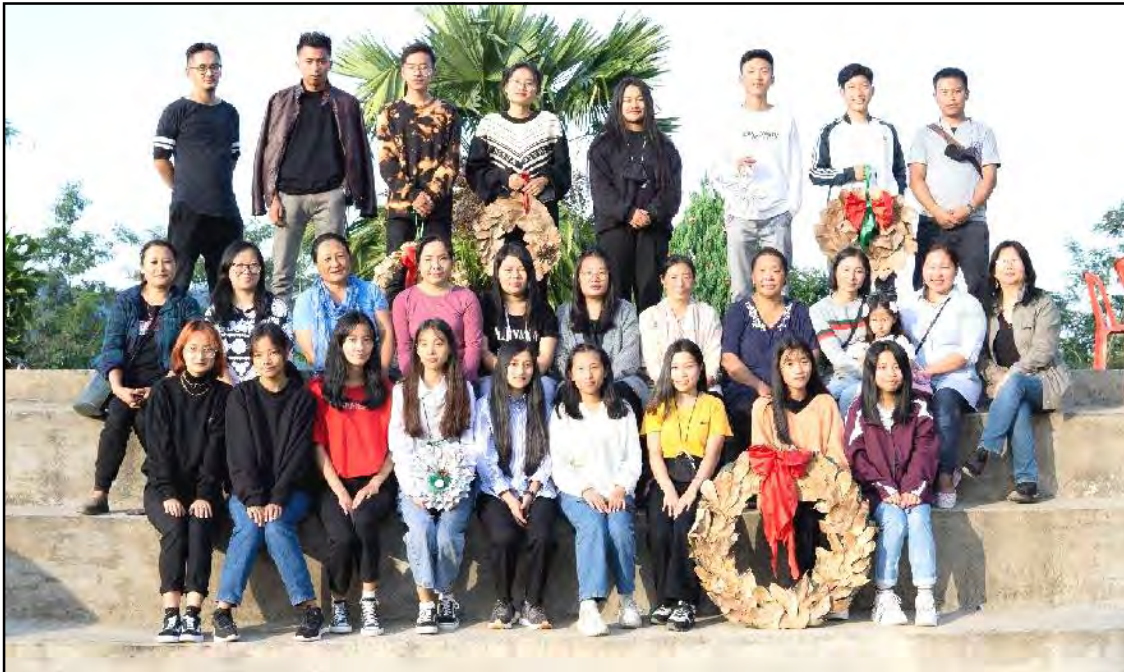
Mokokchung, Yimpoksüi/November 07, 2021: Young Women Christian Association (YWCA) den Eco Club, FAC longjemer ayongba - 'The Santa's Workshop' nung shilem agirtem aser shisalen sayurtem külemi tangokba noksa ka yangi angur.

Mokokchung, Yimpoksüi/November 07, 2021 (TYO): Fazl Ali College indang Eco Club den Young Women Christian Association (YWCA), Mokokchung longjemer "The Santa's Workshop" ayongzük lia sü. Iba workshop sentong nung Fazl Ali College nungi kaketshirtemi shilem agiogo aser parnok dang, mamshiba oset aser asen meküta aliba