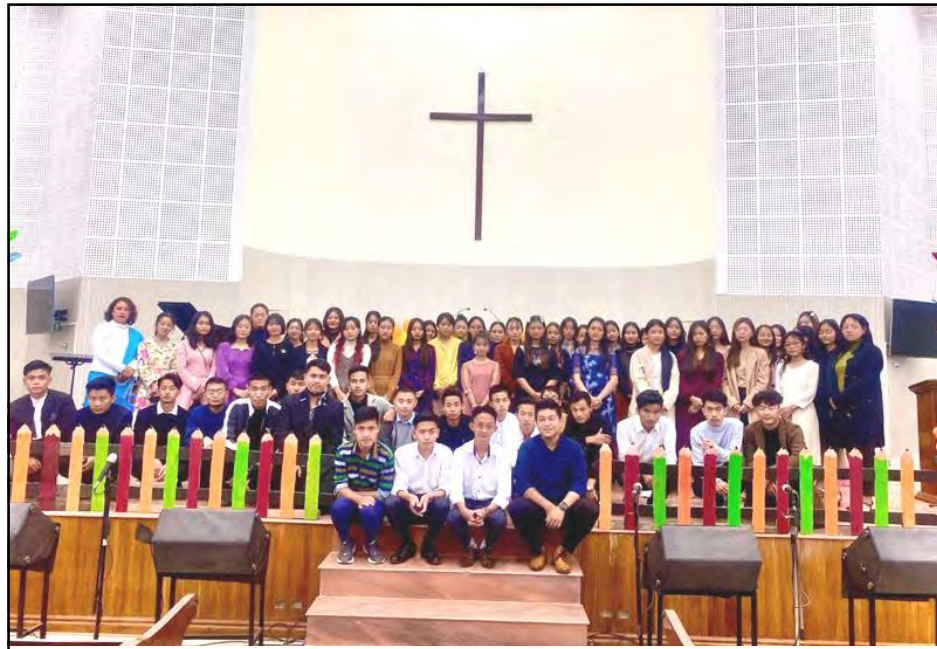
Mokokchung Town Baptist Arogo nung taküm küm graduate asürtem parnok 78 yangi noksa nung angur. Taküm 2021 küm ABAM kübok aliba arogotem nung Sunday school tanur ajak agi 4900 graduate süogo.