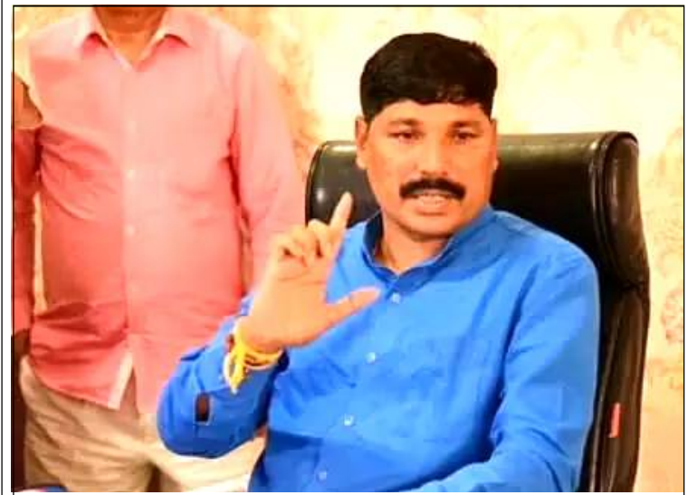
Assam BJP chief Bhabesh Kalita (File photo)

Guwahati, November 07, 2021 (Agencies): Assam BJP chief Bhabesh Kalita-i ashiba agi, State nungi Congress MLAs timbaka BJP telok nung adentsü atatepdar.