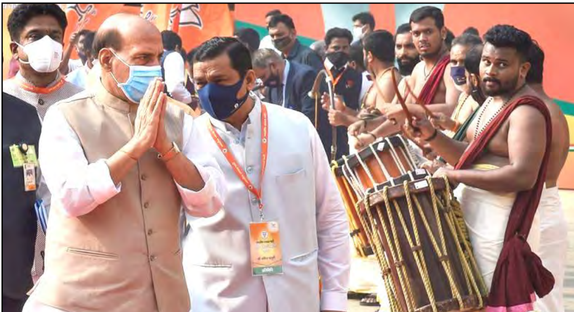
November 07, 2021 nü New Delhi nung Union Defence Minister, Rajnath Singh BNP national executive committee senden nung adentsü atema NDMC convention centre tonga arudang tangokba noksa nung angur.