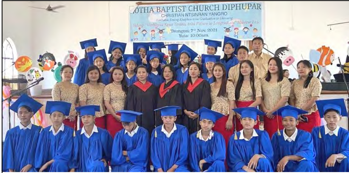
November 07, 2021 nü Lotha Baptist Church Diphupar-i World Sunday School Day aser Graduation sentong repsema agiba anogo nung Sunday School graduates 21 den tesayurtem tangokba noksa nung angur.

Dimapur, Yimpoksüi/ November 07 (TYO): November 07, 2021 nü Lotha Baptist Church Diphupar nung World Sunday School Day amongba den külemi Sunday School graduates 21 nem tetushi agütsü.