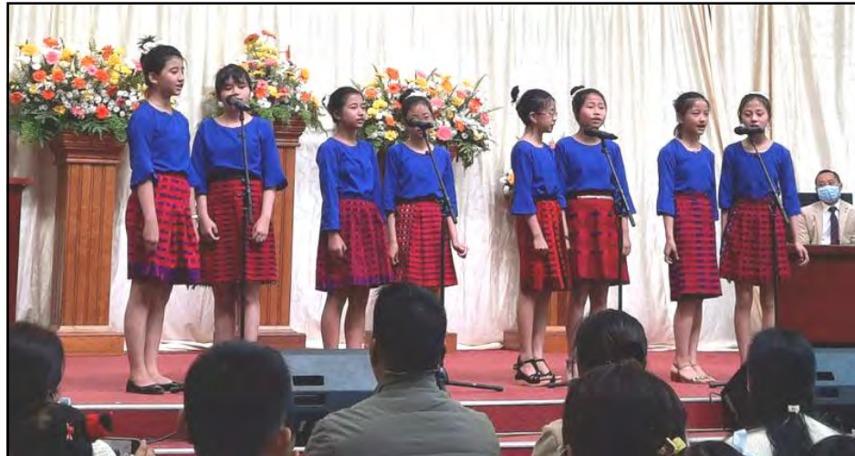
World Sunday school anogo mong nung Kohima Ao Baptist Arogo nung tanurtemi shilem agiba noksa nung angur.( Nov.07, 2021 . )

Temeshiba metsü prokba nung sempet tulu lir. Tang nai ne taküm nung metsü proktsü sentong lir? (1 Peter 1:15). Ne tebilemba temeshi asütsü asoshi nai ne kolok nung temeshiba koda ayur? Na tsüngchir süa alitsü asoshi ne tesendaktep nung temeshiba koda arur? Asüng nai ne taküm nung temeshiba aluruba kanüra, tanü nai temeshiba metsü azüngtsüla.