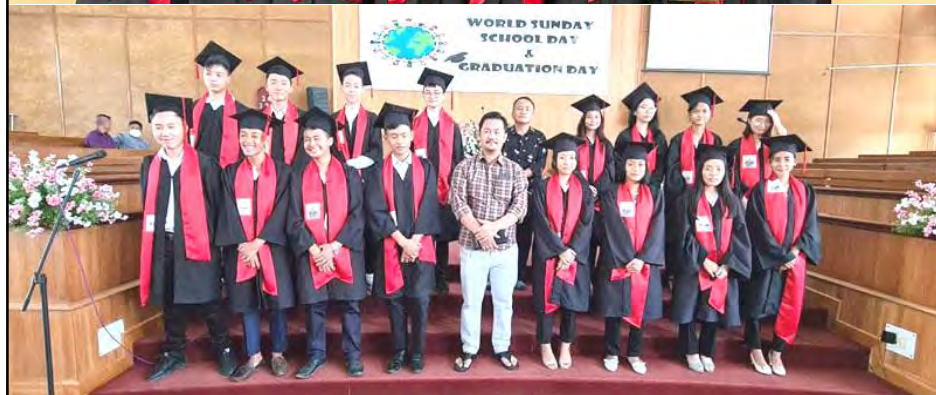
Dimapur Ao Baptist Arogo nung 2021 küm Sunday school nung graduate asür 209 rongnungi kar yangi angur.