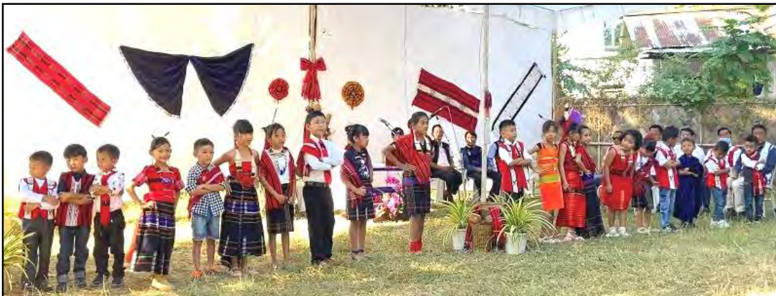
Dimapur, Yimpoksüi/November 07, 2021: Church Colony Diphupar A nung alir Lotha kin ajanga ayongba Tokhu Emong benjungmung sentong nung tanurtemi pei kin (Lotha) sobusülemtsü semer sobaliba tsüngsang ka sayuba yangi noksa nung angur.

Dimapur, Yimpoksüi/November 07, 2021 (TYO): Lotha kin den jangyumedema medema, Deobarnü (07.11.2021) New Church compound Diphupar nung Diphupar 'A' Church Colony nung alir Lotha kintemi Tokhu Emong benjungmung munga lia sü, ta sangdong ajanga metetdaksü.