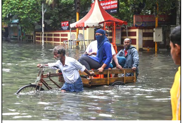
November 07, 2021 nü Chennai nung tzünglu sashia aruba sülen yimti nung tzü metsünga alidak nisung kar talongtsü ka nung atsüdaksüba noksa nung angur.

Jenjang ajemba sülen Punjab nung petrol litre ka nung sen 95 asütsü aser diesel litre ka nung sen 83.75 asütsü. Punjab Chief Minister-isa, joko northern region nung Chandigarh Union Territory dak alaka petrol aser diesel jenjang dalangba state ji Punjab asütsü, ta metetdaksü. State Finance Minister, Manpreet Badal-i, VAT saru ajemba ajanga state sorkari saru nung sen crore 6,000 shi takoksa angutsü, ta metetdaksü. Taoba hopta Centre sorkari petrol litre ka nung excise duty saru sen 5 aser diesel litre ka nung saru sen 10 ajema liasü.