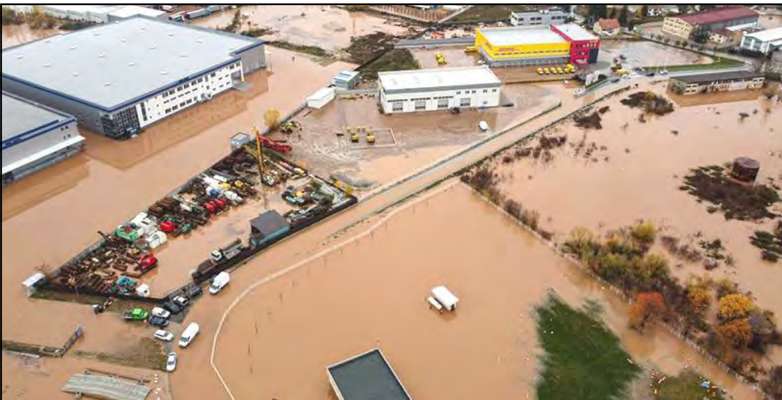
Bosnia yimtiba, Sarajevo kübok Rajlovac tesem nung tayimtsü nungi tangokba noksa ka nung nisung aliba ki tüzümsüng agi metsüngbanger aliba angur. Bosnia nung tzünglu kanga sashia aruba ajanga tüzümsüng adoker ananü jungogo, aser yangji aliba nüburtem tekong bushia aor, yimti tulubalen power shibang, COVID-19 agi shiranger amshiba oxygen facility tongtipang tem shibang aser lenmangtem tzü agi metsüngbanga lir.