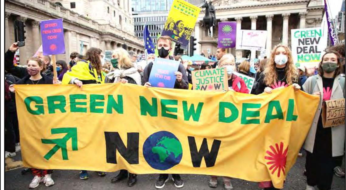
Tzü-mopung wazüka ayutsü asoshi nokdakertemi London nung longkak aita jajaba noksa ka yangi angur. Glasgow nung COP26, UN Climate Summit tatem kati aruba mapang alima tesem ajungalen nüburtemi iba longkak aitba nung shilem agir.

Election nung pro-Iran Hashed al-Shaabi paramilitary network indang political arm, Conquest (Fatah) Alliance puri menden aika nung tamakok angu aser iba ajanga par teloki inyakyim nung oshi mashi densema lir ta shiogo. Election nung Moqtada Sadr-i aniba teloki menden 70 dak tema akok. Moqtada ya Shiite Muslim preacher ka shibai nationalist ka aser Iran aitsür ka ama nüboyima liasü. Deobarnü PM'er ki amakba tang tashi nung telok kati danga nangzüka mali. Iba lendong nung bodyguard ana yirua liasü, ta security source kati ashi. Drone agi amakba sülen prangbong akhaba ola angashiba den Green Zone nung