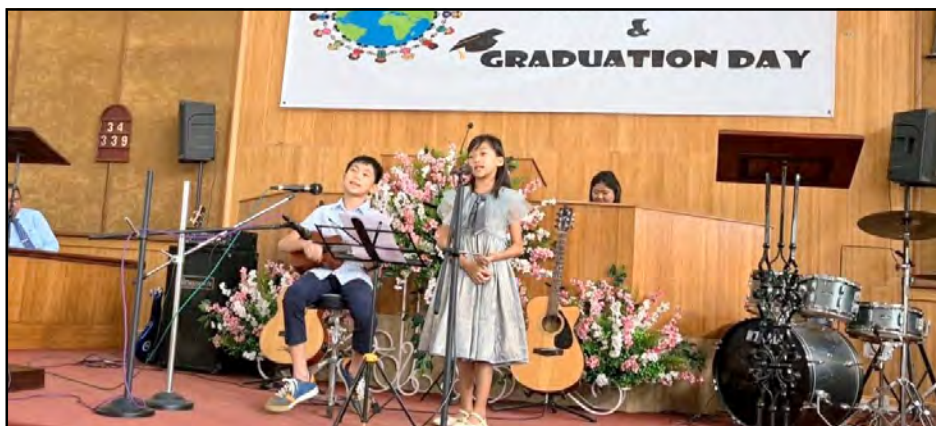
November 07 among nü Dimapur Ao Baptist Arogo (Merali) nung Alima Sunday School mong sentong agiba mapang tanurtemi shilem agiba noksa nung angur .