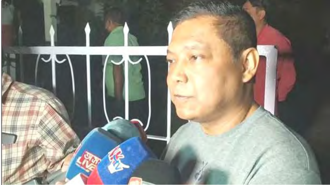
Taoba Assam chief minister Hiteswar Saikia'er jabaso Ashok Saikia-i osangbenertem den jempiba noksa nung angur. (File photo)

Guwahati, November 7, 2021 (Agencies): Deobarnü Central Bureau of Investigation (CBI)-i taoba Assam chief minister Hiteswar Saikia'er jabaso Ashok Saikia puogo. Guwahati kübok Sarumataria nung par ki mita aoba sülen CBI ketdangsürtemi Ashok apu.