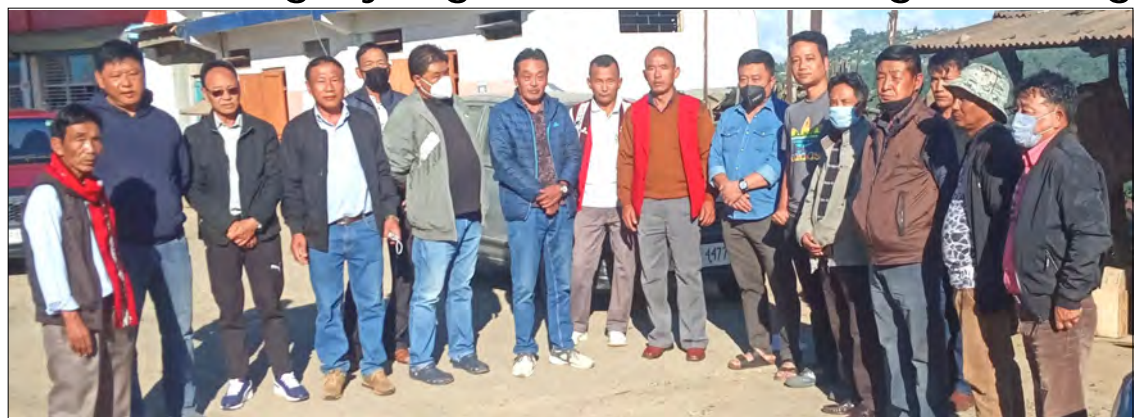
AWUMT ketdangsurtem den department nungi ketdangsur aser contractor telungjem nung tang teyangludak Mokokchung town ajanga süiba NH 2 lenmang semdanga jajaba mapang tangokba noksa nung angur.