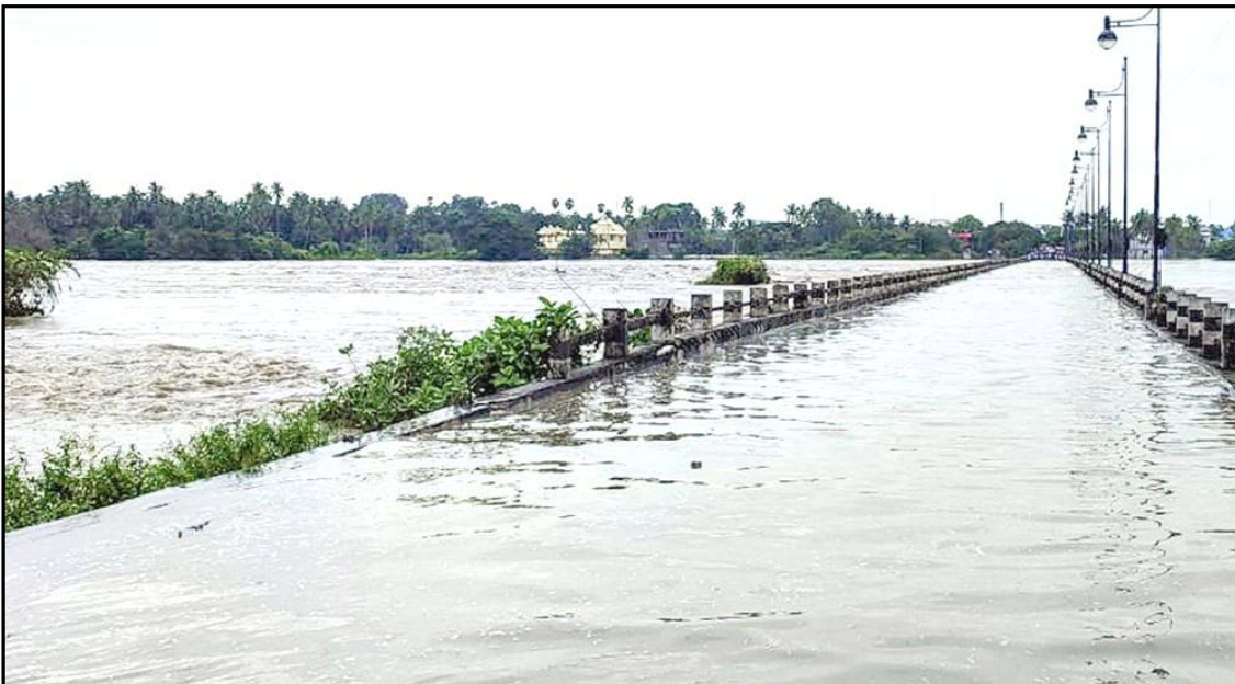
November 19, 2021 nü Puducherry nung Veedur dam nungi tzü tali chiokba ajanga Sellipattu aser Kendikuppam na sendaktepba apo tzü agi metsüngbanga aliba noksa nung angur.

"Goa aser tanüngba state pezü nung aliba nüburtemi taruba election nung BJP mejungi tamakok ngudaktsütsü, ta ni amanger," ta pai ashi.