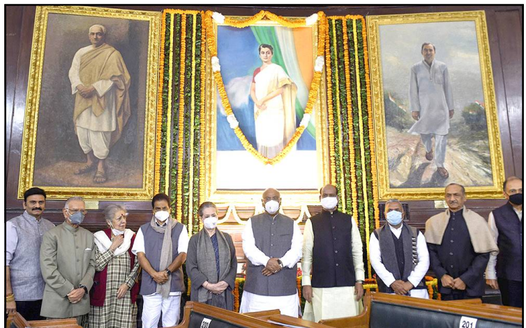
November 19, 2021 nü Parliament, New Delhi nung Lok Sabha Speaker, Om Birla aser Congress Tir, Sonia Gandhi na densema lenirtemi taoba mapang Ato kilonser, asür Indira Gandhi nem akhüm agütsüba noksa nung angur. November 19 ya Indira Gandhi asoba anogomong lir.

Tang tashi nung India nung coronavirus vaccine dose crore 115.23 dak tema agütsüogo.