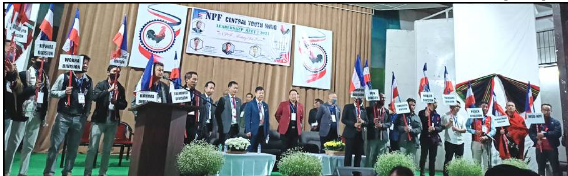
November 19, 2021 nü State Academy Hall nung NPF MLA tem aser MP temi NPF youth wing ketdangpurtem den külemi agiba noksa angur.