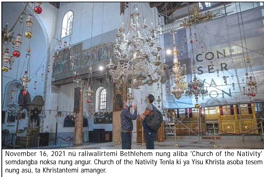
November 16, 2021 nü raliwalirtemi Bethlehem nung aliba 'Church of the Nativity' semdangba noksa nung angur. Church of the Nativity Tenla ki ya Yisu Khrista asoba tesem nung asü, ta Khristantemi amanger.

November ita tesadang tashi nung raliwalir 30,000-i dang Israel semdangogo; coronavirus wara meprokdang 2019 küm November ita nungbo raliwalir 421,000-i Israel semdanga liasü, ta Israel Interior Ministry-i metetdaktsü.