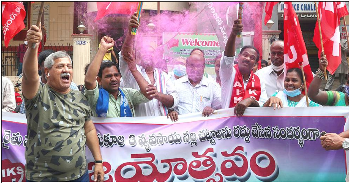
Hyderabad, November 19, 2021: Centre sorkari aluyimba ozüng tasen asem agienba sülen Hyderabad nung lokti tentet balala nungi züngsemtem benjungtepba noksa nung angur. Hokolbarnü ajungbena Ato kilonser, Narendra Modi-i, sorkari aluyimba ozüng tasen asemprong agentsü, ta sangdongogo.