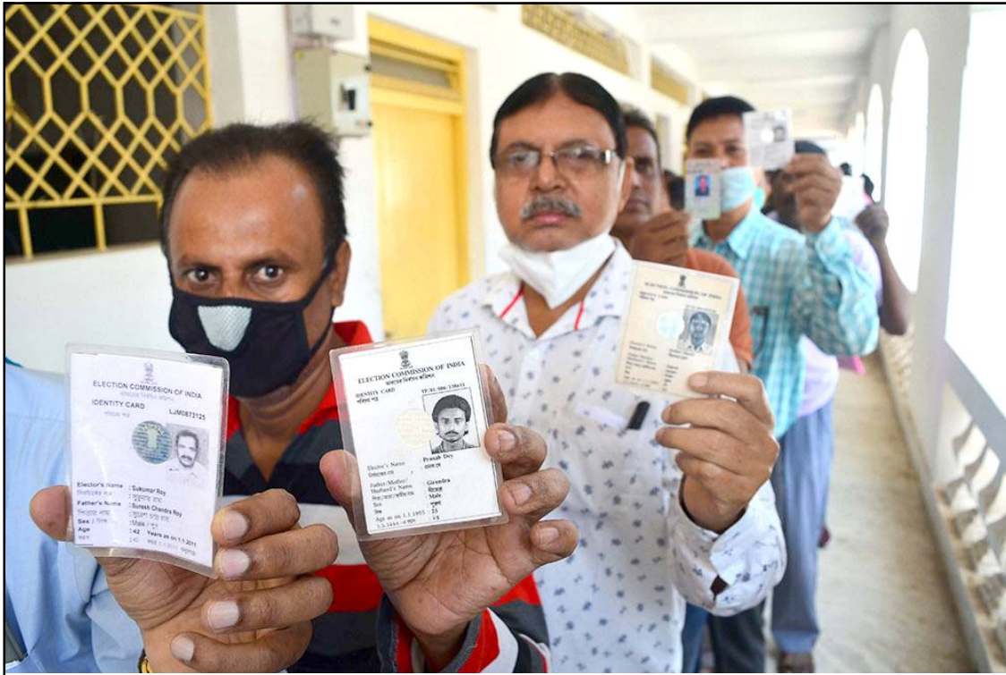
Agartala nung civic election atema mapa lemzükba sorkar mapa inyaktermi postal ballot anasa vote enoktsütsü atema atatepdang agiba noksa angur. (Agartala, November 19)