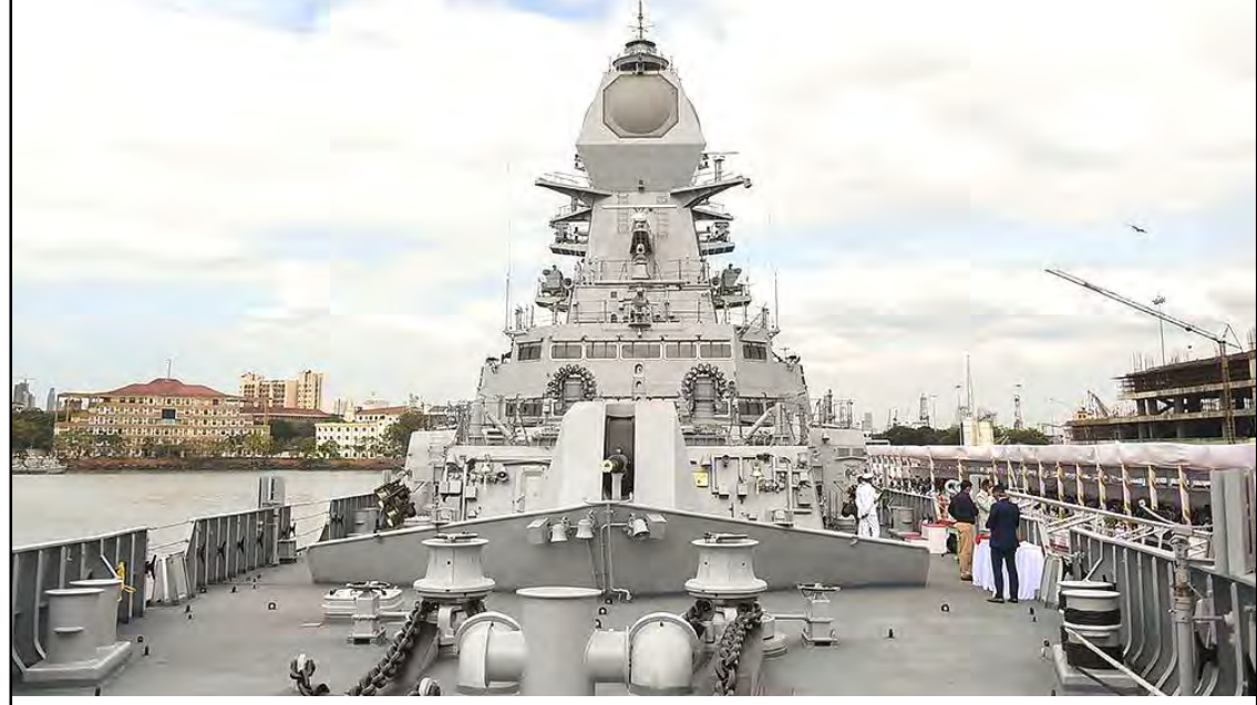
Mumbai, November 21, 2021: Indian Ocean Region nung raradang amshitsü atema yangluba rong- 'Visakhapatnam INS' Amongnü Mumbai nung semzükba sülen tangokba noksa nung angur.

Pakistan linüki kiralongra ajanga India tashi meitdaksütsü maneni meranger, anungji parnok nem osang tejangja metetdaksüoogo, ta pai ashi. "Onoki anüolen asen kidanger (Pakistan) dang, nenoki ambangyima inyakra onoki arrtsülen dang masü saka linük tesem ajak amaktsü ta metetdaksüoogo," ta pai ashi. Pai Pakistan tenüing tetshia item o jembi saka China tenüingbo metetshii pai, "Ano asen kidanger linük ka (China) lir, aser parnokia ibaji mangatetter ama ni bilemer," ta ashi.