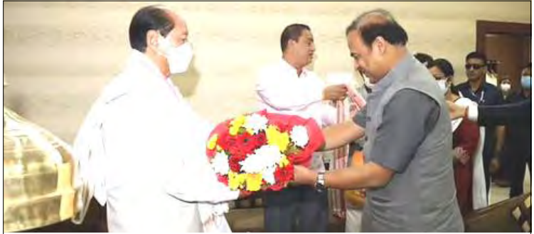
Deobarnü Assam CM, Sarma aser Nagaland CM, Rio na ajurutepba noksa nung angur.

Guwahati, November 21, 2021 (Agencies): Küm aika Assam-Nagaland arrtsü atema ken o tem adoker toktepa arur aser iba onük lemteptsü atema Deobarnü Assam Chief Minister Himanta Biswa Sarma aser Nagaland Chief Minister Neiphiu Rio na ajurutepogo.