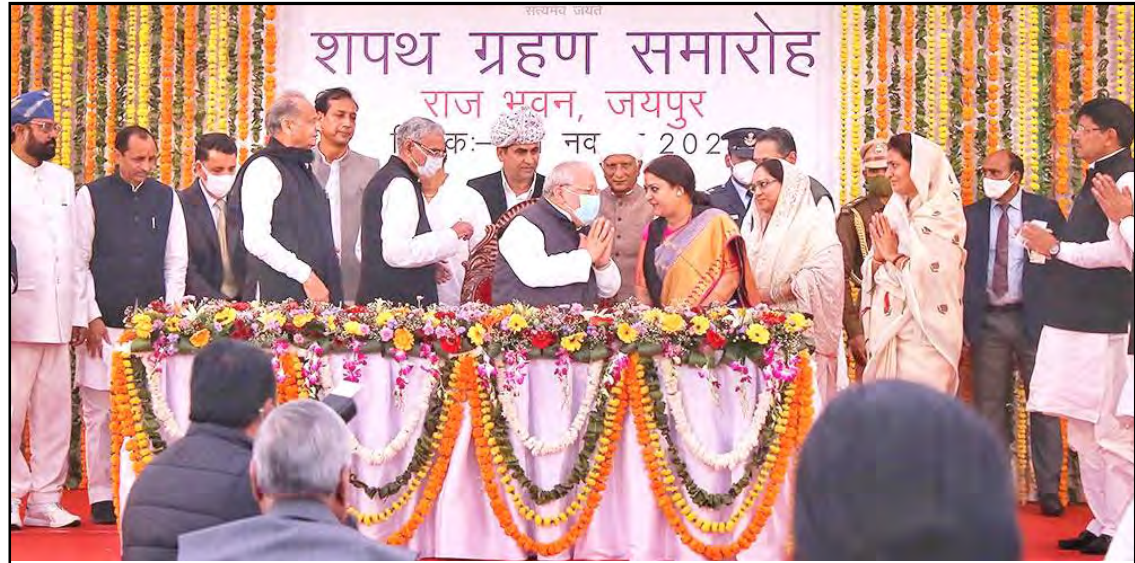
November 21, 2021 nü Raj Bhavan, Jaipur nung minister tem tenangzükba agiba sülen Rajasthan Chief Minister, Ashok Ghelot aser Rajasthan Angh, Kalraj Mishra nati Cabinet Minister tasenpurtem den tangokba noksa nung angur.

Jaipur, November 21 (Agencies): Amongnü Raj Bhavan, Jaipur nung Congress MLA 15-i minister tenangzükba agiogo, parnok rongnung yaküm cabinet nungi anentsüba lenir ana densema lir. Party anema nokdakba atema yaküm Vishvendra Singh aser Ramesh Meena na minister menden nungi anendakja liasü saka tenaprong tanaben cabinet nung aniokogo. Rajasthan State Angh, Kalraj Mishra-i ketdangüsü minister tasenpurtem tenangzükba