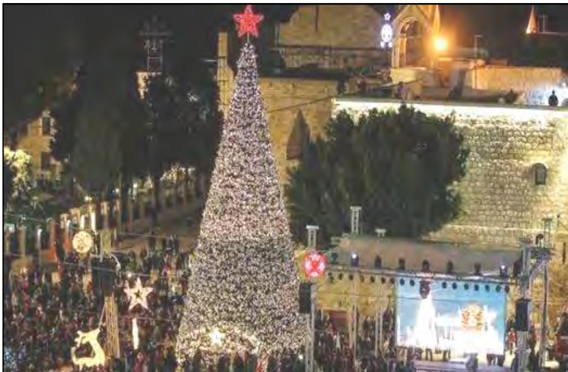
2021 Khristmas mongpu atema Yisu Khrista asoba yimti- Bethlehem nung benjung sobütsü inoka aliba noksa nung angur.