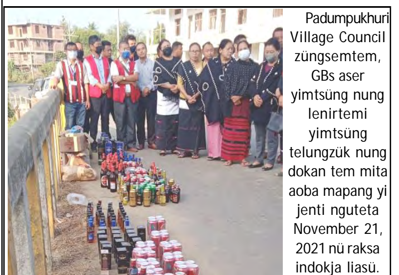
Padumpukhuri Village Council züngsemtem, GBs aser yimtsüng nung lenirtemi yimtsüng telungzük nung dokan tem mita aoba mapang yi jenti nguteta November 21, 2021 nü raksa indokja liasü.

Sorkari iba Link Road nung temolung agütsüra, Mokochung, Zunheboto aser Tuensang district tem nungi nüburtem asoshi temelenshi tulu arutsü. Tanü tashi iba lenmang ya küm shia Khar Village Council, Khar Citizen Union Mangkolemba aser temolungertemi anepalua arur, ta sangdong ajanga ashi.