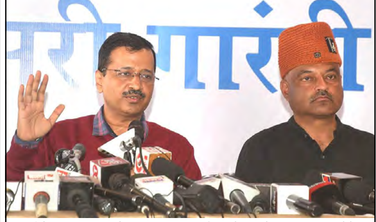
Haridwar, November 21, 2021: Sangküm küm tetenzüklen Uttarakhand Legislative Assembly Elections agitsü lia Amongnü Haridwar nung Delhi Chief Minister aser AAP tongti lenir, Arvind Kejriwal-i osangbenertem senden ka nung jembiba noksa nung angur.

atema sorkari telangzükba agütsü tenzükra sorkari mapa meinyaktettsü. Onoki linük atema inyaksü nüngdaker," ta paisa ashi. Aluyimba ozüing asem agientsü atema sorkari telemtetba agiba dak sendakba nung pai, iba onük nungji tali jembitsü menüingdak, kechiyong Ato kilonser, Narendra Modi-i kanga tongtibang telemtetba ka agiadokogo, ta ashi. 'Sansad Khel Spardha' kübok marathon sentong 'Run for Greenery' tenzüktsütsü atema Rijiju-i Agra semdanga liasü. Amongnü anepdang pai Agra College Sports ground nungi marathon tenzükja liasü aser iba sentong nung kaketshirtem, NCC cadets, scout guides, saisapongertem, melungtet telok balala nung inyakertem aser Agra nung alir nisung noklang aikati shilem agia liasü.