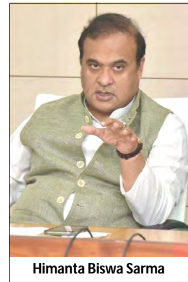
Himanta Biswa Sarma

National Education Policy (NEP) mapa küma inyaksü asoshi Assam-i takok ngua