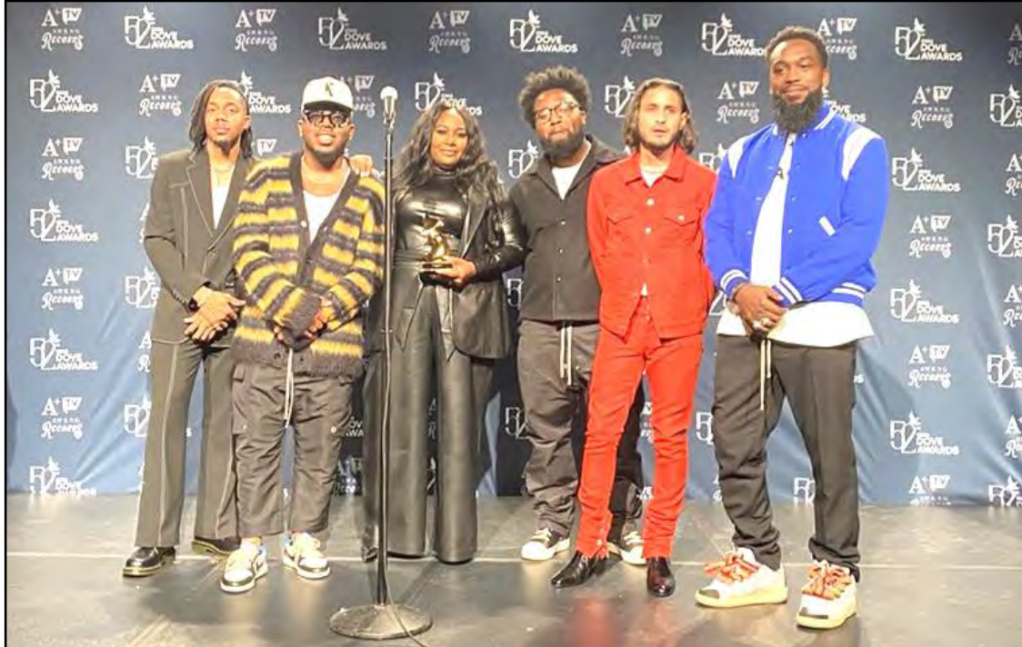
Yaküm Nashville, Tennessee nung 52buba Gospel Music Association Dove Awards sentong nung Maverick City Music telokpur tangokba noksa nung angur.

Luchii/December 01, 2021: Mongolbarnü (November 30) Recording Academy-i Christian Grammy Awards nominations sangdongogo; Bethel Music collective nungi Dave aser Maverick City Music napronglai nominations pongungu angu.