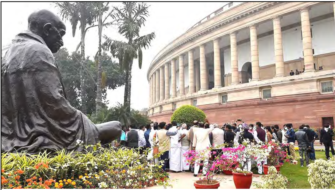
New Delhi, December 01, 2021: Rajya Sabha nung Opposition MP 12 anentsüba anema Bodhbarnü Parliament kima opposition party temi longkak aitba noksa nung angur.