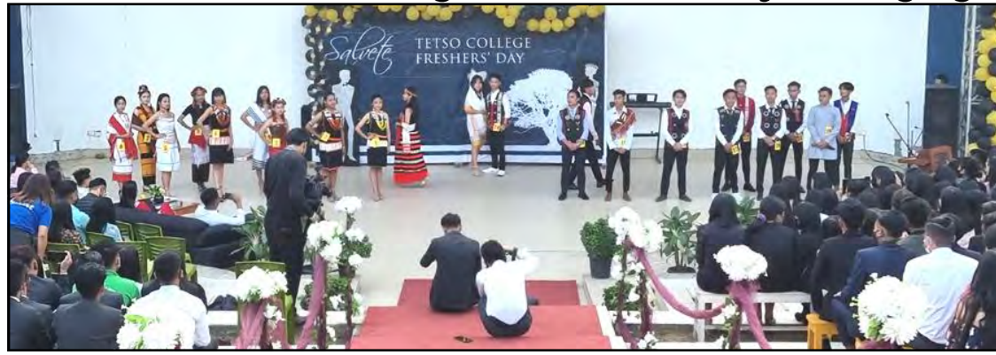
Dimapur, Luchii/December 01, 2021 (TYO):