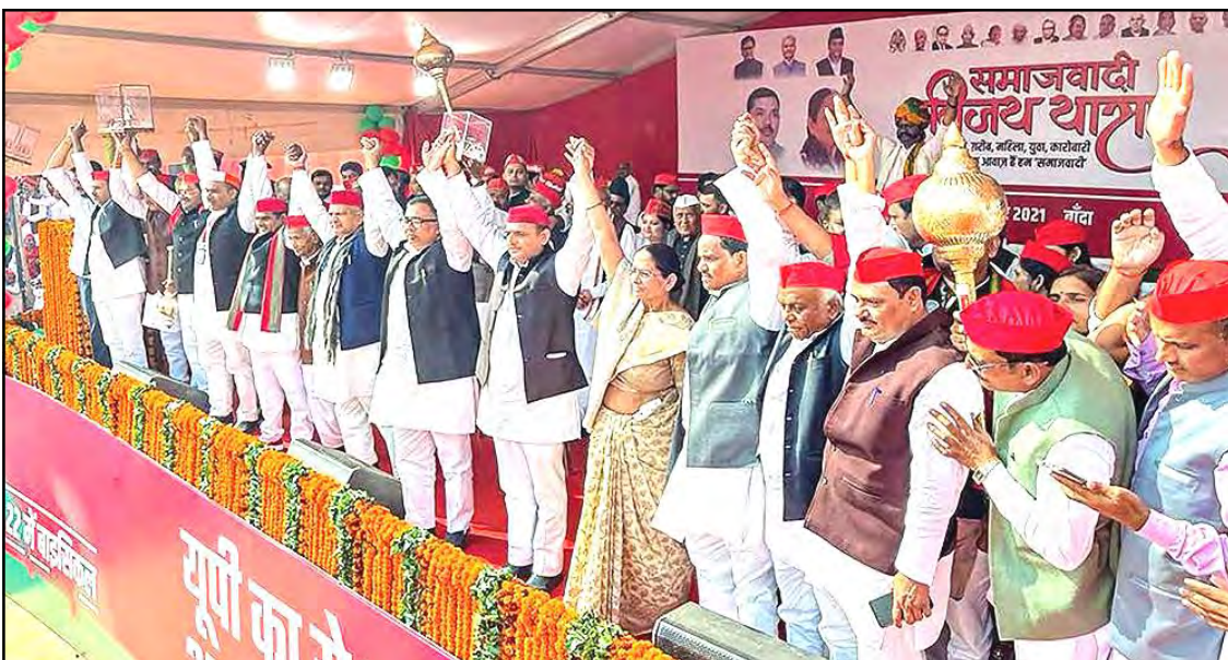
December 01, 2021 nü Banda district nung taruba Uttar Pradesh assembly election atema nüboyimba sentong ka nung Samajwadi Party Tir, Akhilesh Yadav aser party lenirtem tangokba noksa nung angur.