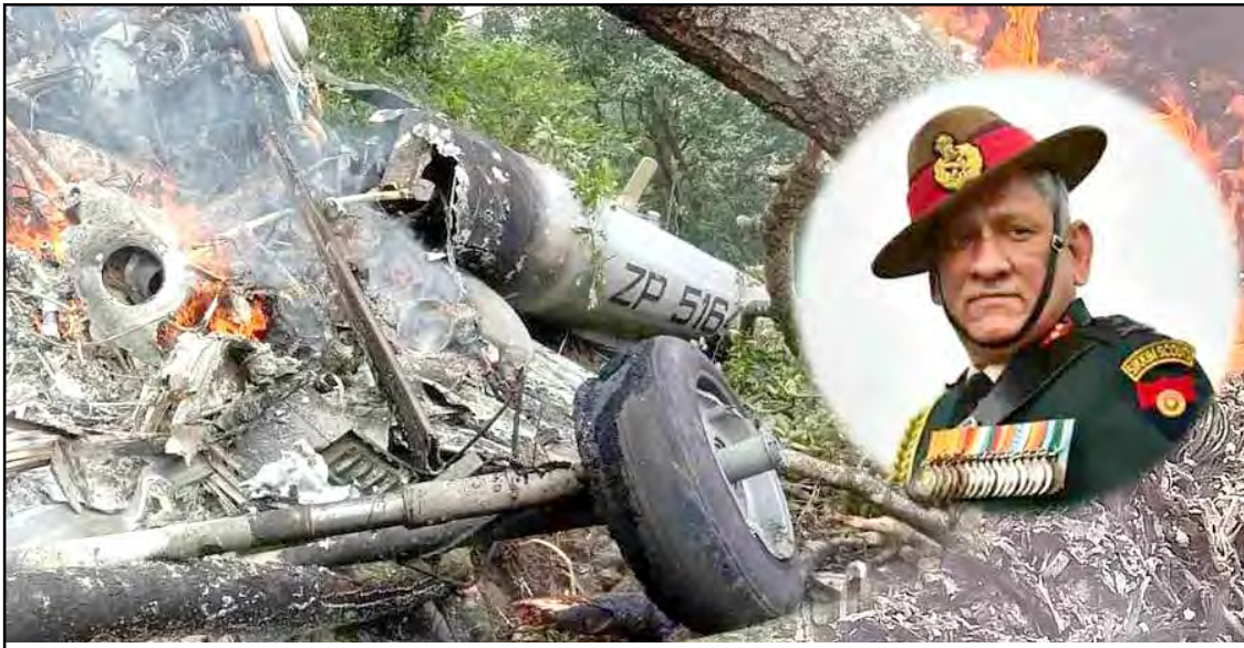
December 08, 2021 nü Tamil Nadu nung Nilgiri hill district kübok Coonor anasa Indian Air Force indang Mi-17V5 helicopter tsükokba sülen tangokba noksa nung angur. Iba lendong nung Chief of Defence Staff, General Bipin Rawat aser pa kinüngtsü Madhulika Rawat na den sepai 11 süogo. Iba tayimtsü ya Sular IAF base, Coimbatore nungi Defence Staff College, Wellington-i aodang tsükok.