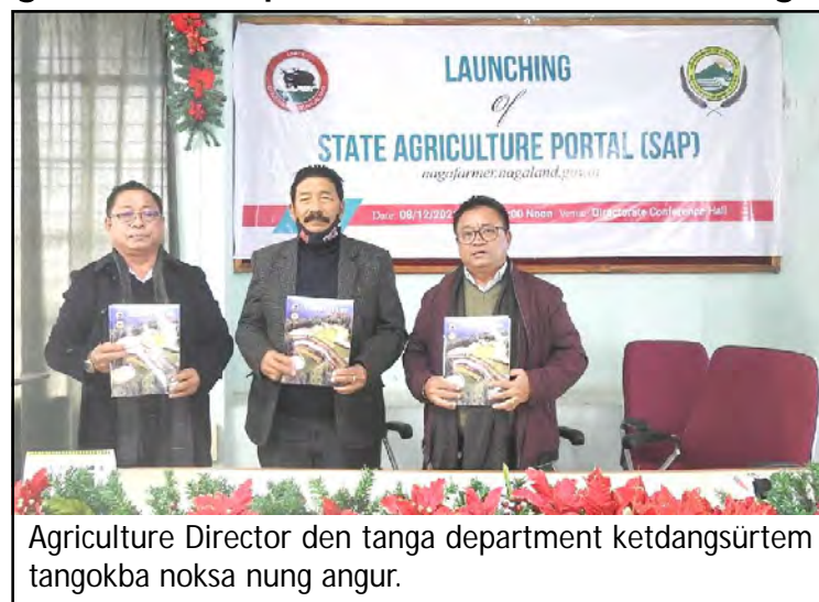
Agriculture Director den tanga department ketdangsürtem tangokba noksa nung angur.