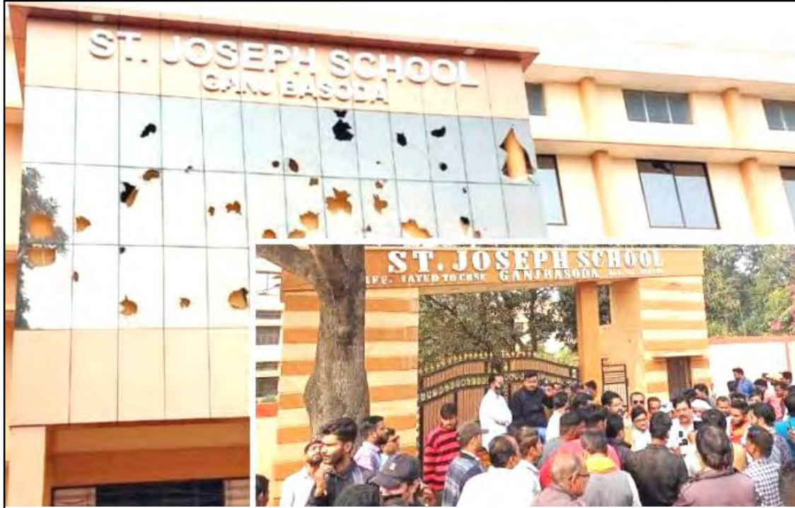
Hombarnü (December 6) Madhya Pradesh nung Vidisha district kübok Ganj Basoda jila nung Bajrang Dal nungi züngsemtemi raksatsüba Khristan school noksa nung angur.

Bhopal/New Delhi, Luchii/ December 08 (Agencies): Hombarnü (December 6) Madhya Pradesh nung Vidisha district kübok Ganj Basoda jila nung Khristan school ka nung class 12 purtem CBSE Board tatidang tagidak mapang nung Hindu yimsü alia amanger telok-Bajrang Dal nung inyakertemi anir Hindu nungertemi school raksatsü.