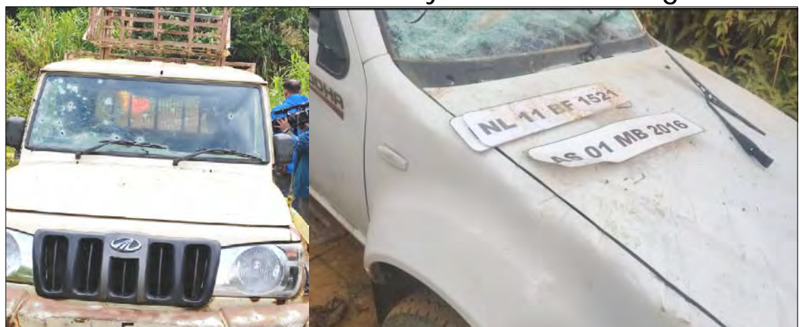
(Abelen nungi) Driver amenba tsütsü injang agi akhaba angur aser iba ajanga Centre sorkar aser Defence Force ajanga ashibaji tai ta kuli agütsür. Para commandos-i amshiba gari ka nung number plate taila aika amshiba angur.

Dimapur, December 8, 2021 (TYO): Nagaland kübok Mon district nung Oting nungeri Bodbarnü December 4, 2021 nü lendong atalokba indang osang tejangja metetdaksü dang parnok taküm samatsü metsübur aser tsükkhir taküm agitsü ta shiogo.