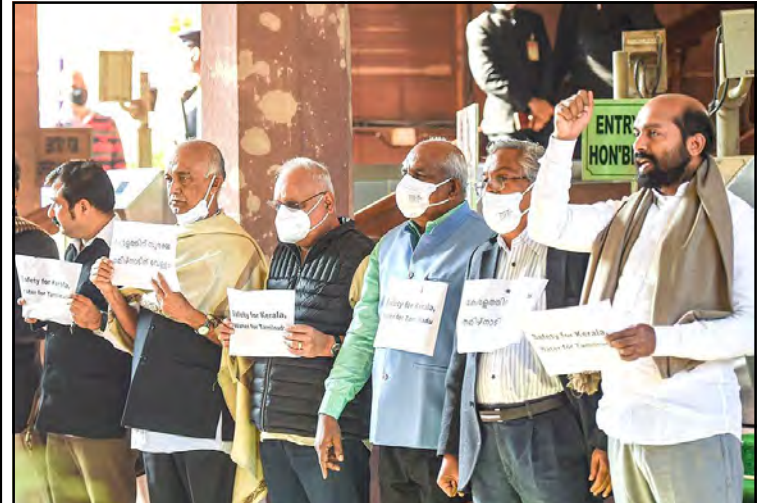
New Delhi, December 08, 2021: Bodhbarnü asükwa mongpu Parliament tagidak mapang nung Parliament kima Kerala nungi MP temi longkak aitba noksa nung angur.

timba ser aika Jammu region-i ogo," ta pai metetdaksü. "Item kibongtem ya timbaka sorkar mapa inyakertem lir, aser asükwa mongpu nungbo ketdangsertem Jammu-i oa mapa inyaker aser asükwa mongpu nung shisaliok rejutem sodi anguba agi Jammu-i aoer," ta minister-isa metetdaksü. Ano tanga tasüngdangba ka langzüdang Rai-i, 2019 küm Arlla 370 agienba mapang nungi tenzüka taküm November ita tashi nung civilian 96 tepset, security sepai tepset asü aser kiralongrar 366 tepsetogo, ta metetdaksü.