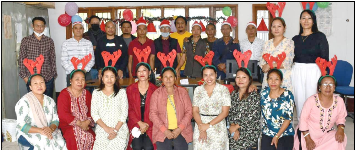
DPRO Dimapur staff tem December 9 nü Advent Christmas sentong amungba mapang tangokba noksa nung angur.

Dimapur, Luchii/December 9 (TYO): District Public Relations Officer Dimapur aser staff temi December 9 nü Office nung Advent Christmas sentong ka ayongzüka agiogo.