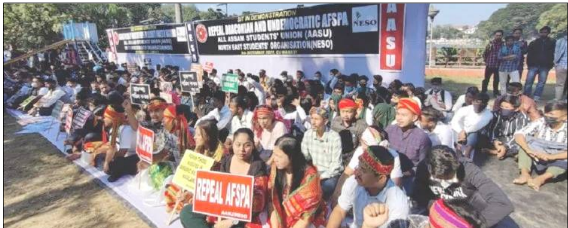
Brehostibarnü All Assam Students' Union (AASU)-i, Guwahati kübok Dighalipukhuri nung AFSPA agintsü khanga longkak aitba mapang tangokba noksa nung angur.

Guwahati, Luchii/December 9 (Agencies): Nagaland nung security forces temi tai maketba civilian 13 tepsetba sülen Northeast nung armed forces special powers act (AFSPA) agientsü takhangba tali kümdar. Brehostibarnü All Assam Students' Union (AASU)-i, Guwahati kübok Dighalipukhuri