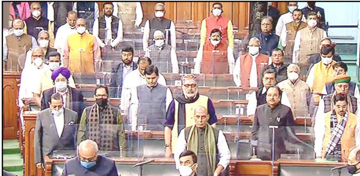
New Delhi, December 09, 2021: Brihostibarnü Lok Sabha senden nung MP temi Bodhbarnü Tamil Nadu kübok Conoor nung tayimtsü lendong nung tsükseta asüsang, Chief of Defence Staff General Bipin Rawat, pa kinungtsü aser tangartem nem akhüm agütsüdang tangokba noksa nung angur.

New Delhi, Luchii/ December 09 (Agencies): Brihostibarnü Defence Minister, Rajnath Singh-i, Chief of Defence Staff, General Bipin Rawat den tangar 12 tsükseta