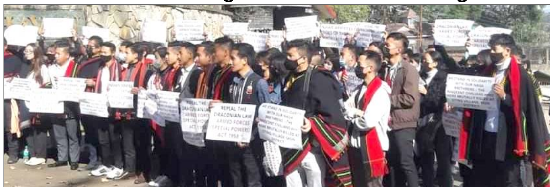
Naga Students' Federation (NSF) ajanga December 9, 2021 nü Kohima nung Raj Bhawan jakdang Armed Forces Special Power Act (AFSPA) agienang ta takhangba agüja mener longkak aita liasü.

Kohima, Luchii/Dec. 09 (TYO): North East Students' Organization (NESO) tawabangba kübok Naga Students' Federation (NSF) ajanga Armed Forces Special Power Act (AFSPA) anema Kohima nung Raj Bhawan jakdang Brehostibarnü longkak aita liasü.