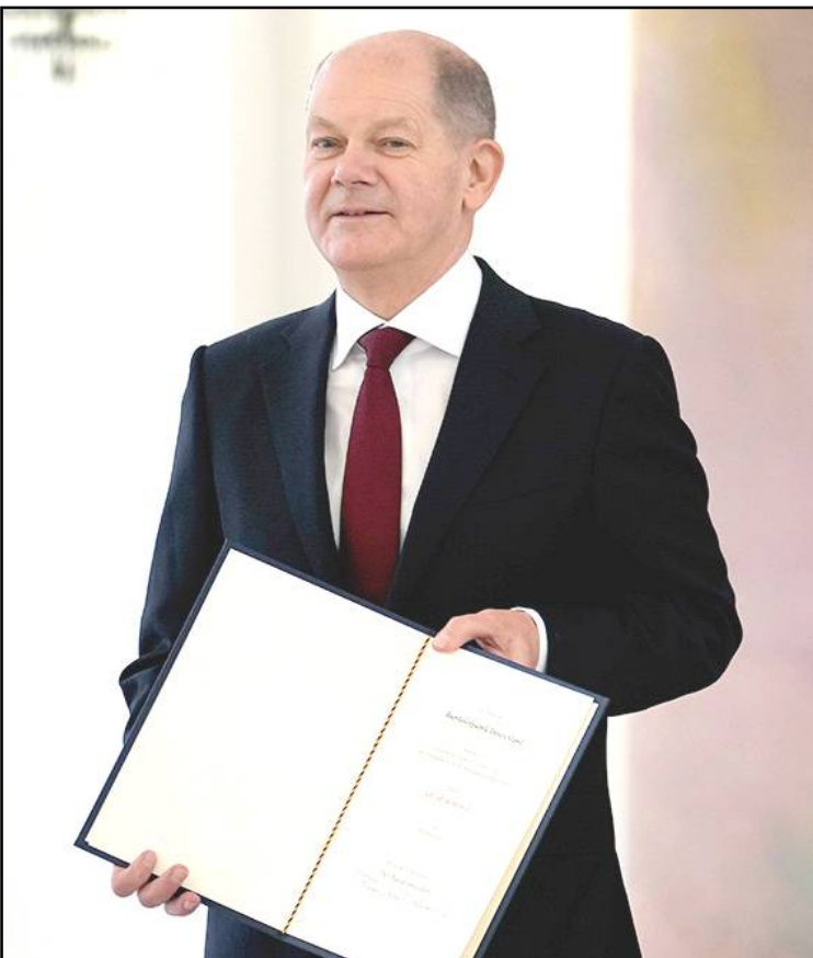
Berlin, Germany nung aliba Bellevue Palace nung sentong ka agidang German Chancellor tasenba Olaf Scholz-i pa shimba shidi ka German Tir Frank-Walter Steinmeier-i agütsüba amer tangokba noksa nung angur. World War II sülen Scholz ya Germany indang chancellor teku buba kumogo aser Angela Merkel-i kum 16 yimsü asüba sülen European Union nung nütsüng yongsük timtiba aser rongsenketzüng tulutiba linük nung tendak tasen ka tenzükur.

Iba sentong nung ketdangsürtem dang kechi atalok iba indang ochi temai adokjang aser kechi atalok iba khuret agiang ta akanger. Iba sentong ya coronavirus tashidak wara tenüing amer ketdangsürtemi kum ana nokdanga arur.