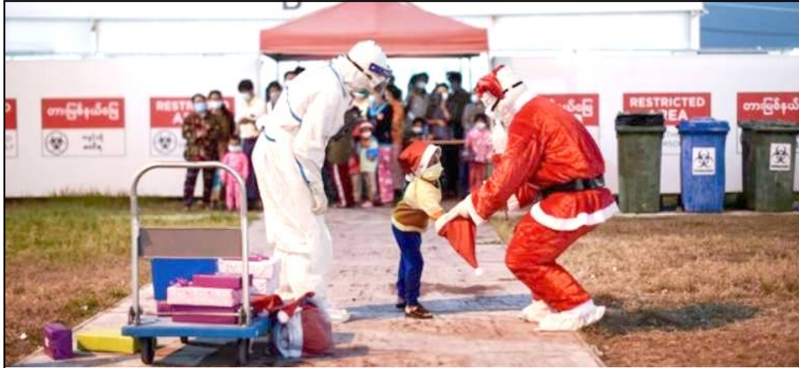
Myanmar kübok Mandalay nung aliba Ayeyarwady Covid Centre nung healthworker kati Santa Claus ama sübotsü sübor tanurtem nem sempet lema agütsüba noksa nung angur.

December 09, 2021: Tang rara adoka aliba Myanmar linük nung Khristan lenirtemi Khristanem dang timtemertem dang temeim mapa sayutsü ayongzükogo.