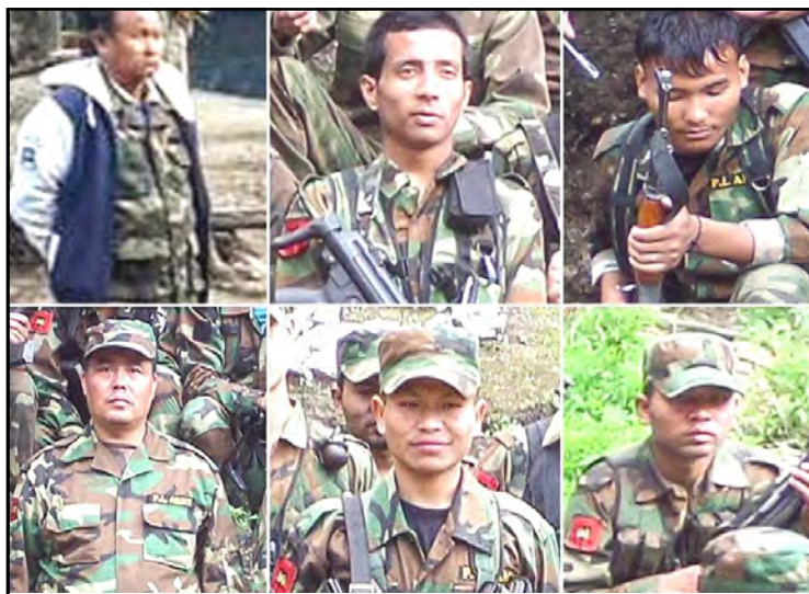
People's Liberation Army (PLA) aser Manipur Naga People's Front (MNPF) züngsemtem indang noksa angur. 46 Assam Rifles indang Commanding Officer convoy amakba dak sendakba nung National Investigation Agency (NIA)-i item züngsemtem anema cash reward metetdaksüögo.