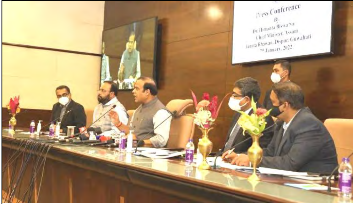
Hokolbarnü Assam Chief Minister Himanta Biswa Sarma-i osangbener den senden amendang agiba noksa angur. (Guwahati, January 7)