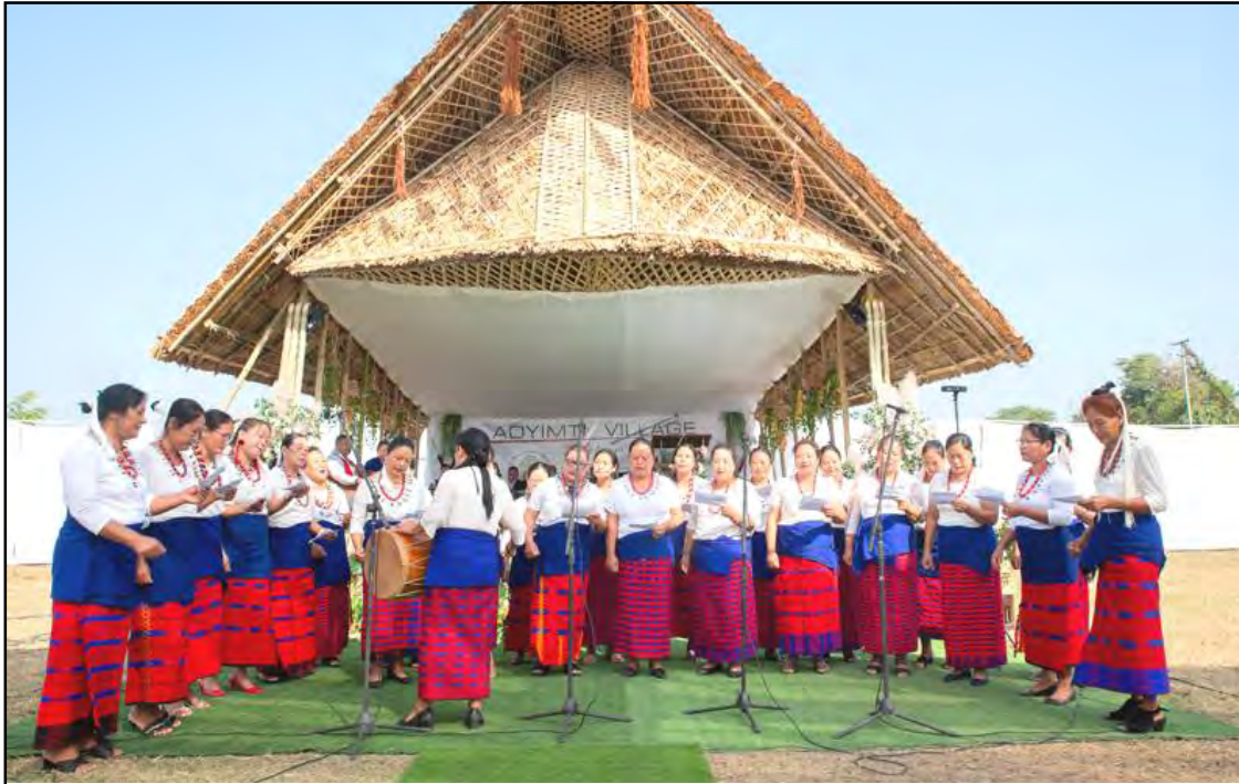
Aoyimti Playground nung January 7, 2022 nü Aoyimti kumteter küm 75 ajungba benjongmung amungdang Watsü Telen, Aoyimti village ajanga sobaliba ken ka tenloktsüba mapang tangokba noksa ka yangi angur.

Dimapur, Aenjeti/January 07 (TYO): Dimapur kübok Aoyimti kumteter küm 75 ajungba benjongmung sentong January 7, 2022 anepdang 11:00 ako nungi tenzüka Aoyimti playground nung munga liasü.