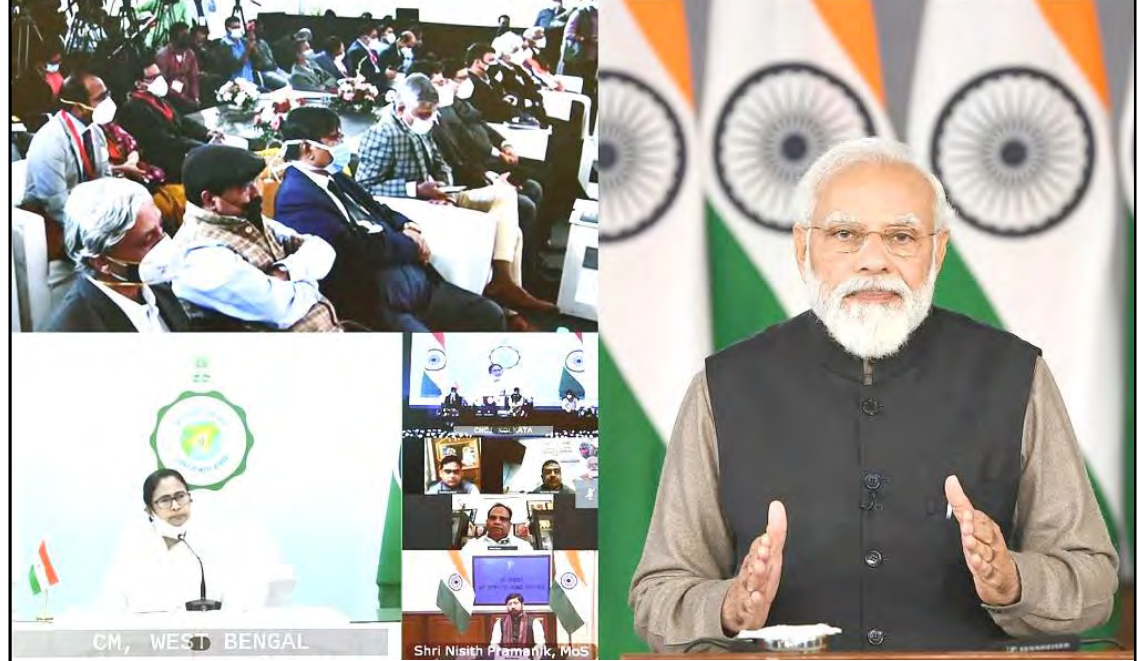
January 07, 2022 nü Ato kilonser, Narendra Modi-i New Delhi nungi video conferencing ajanga Kolkata nung Chittaranjan National Cancer Institute (CNCI) indang tanabuba campus semzüksüba sentong nung jembidang tangokba noksa nung angur. Kasa noksa nung West Bengal Chief Minister, Mamata Banerjee-a angur.