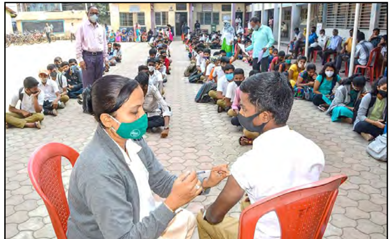
January 07, 2022 nü Karad (Maharashtra) nung aliba school ka nung health worker kati arrshi küm 15-18 tsüingda tainlonglong kaketshirtem nem coronavirus vaccine tutsüba noksa nung angur.