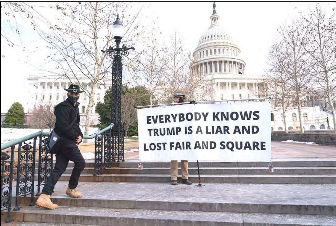
US Capitol nung lendong ataloker kum ka sülen Midwest nungi nisung kati Washington nung aliba Capitol nung lendong agütsüba aija zülua bener aliba noksa nung angur. Right wing extremist temi timtem balala agütsüba ajanga pai pa tenung mashi. "Tanü iba anogo bilemtetsü asoshi ni yagi aru. Ochi angatetba nisungtemi animesor menokdakra tensa tamajungba akumtsü," ta pai ashi. Capitol nung lendong tulu ataloker Brehostibarnü kum ka ajung aser iba lendong ya ajanga America nunger democracy asoshi tebilemtsü agütsü.