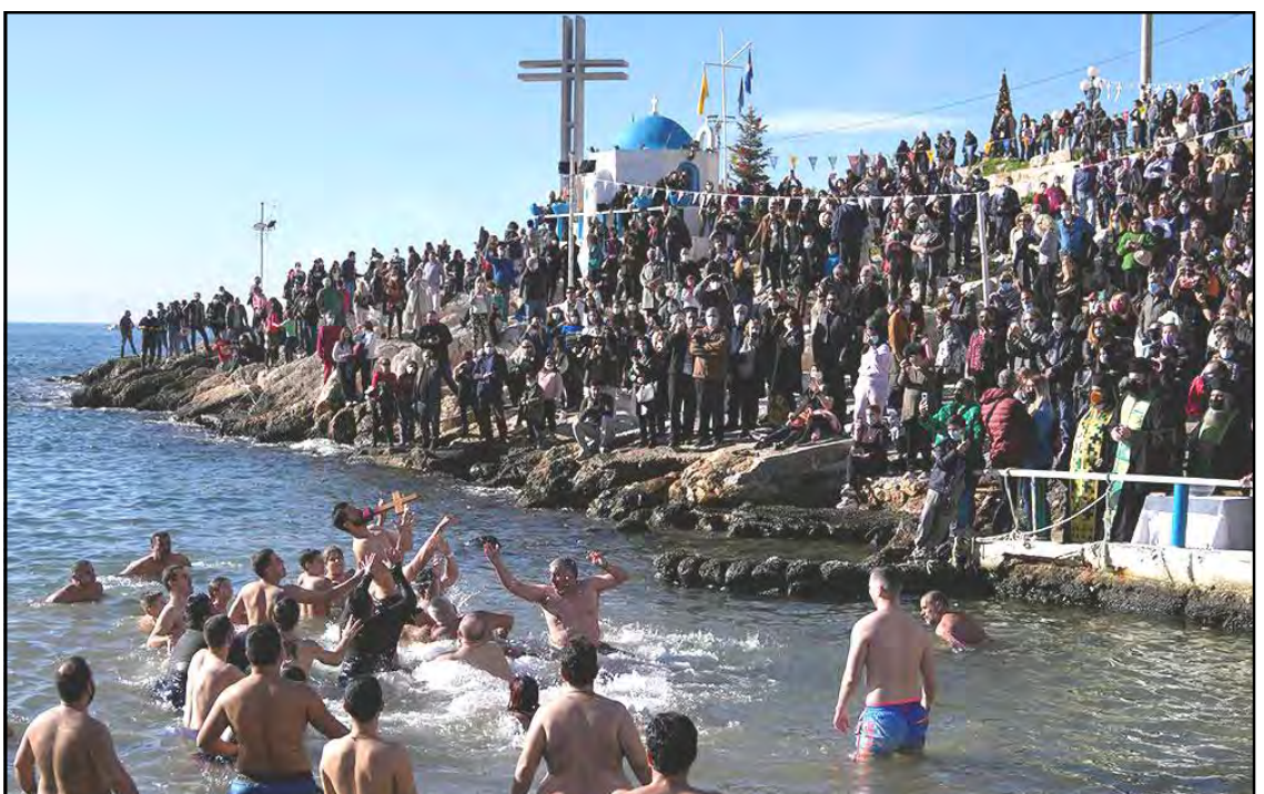
Athens anasa Piraeus port nung Epiphany benjongmung mapang tzü nung temoatsü meshiba mapang temeshi ainlen jajar temi kangki jepzüktsü merangba noksa nung angur. Omicron variant densema COVID-19 tashidak wara tali akumba ajanga Greece tesem aika nung Brehostibarnü iba Epiphany benjongmung athi mesüra kanga ajema munga liasü.