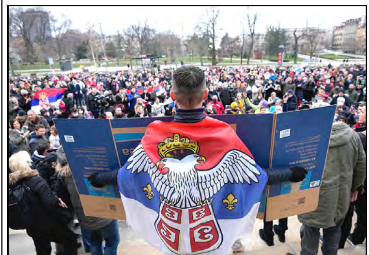
Serbia nung tennis asayar Novak Djokovic pusemertemi Belgrade, Serbia nung longkak aitiba noksa nung angur. Australia nung COVID-19 vaccination temzüng ozüng sülen manidaktetba atema Novak Djokovic ya Australia sorkari sota lir aser pa indang visa dena cancle sütsüogo.

South Africa aser West Indies na January 18 nü nungi tenzük Centurion nung asayatsü aliba ya tetsürtem asaya mezüngbuba iba temelenshi kübok asayaba asütsü.