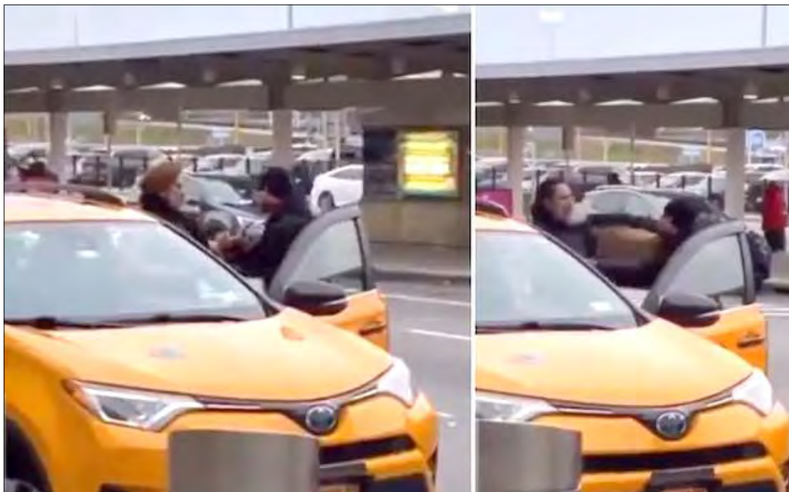
Noksa nung JFK International Airport kima Sikh nung taxi anishir ka züka merenshiba angur. Iba tatalokba ya India nungi jakzükba Sikh nung tesempa agi merenshiba ken o ka ta temulung meleme bilemer.

Kasa mapang nung tir Kassym-Jomart Tokayev-i iba mepetmesü ya kiralongrartem dak tai tongloktsür aser pai Hokolbarnü item nisungtemi timtem agütsüba aziüktsü atema parnok khasetstü tetuyuba agütsüogo.