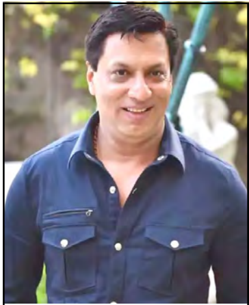
Madhur Bhandarkar (File photo)

New Delhi, Aenjeti/January 08, 2022 (Agencies): Actress Swara Bhasker sülen, Bollywood nung tesüsa Covid-19 puteter tongtibang nübu rongnung film yanglur Madhur Bhandarkar asütsü.