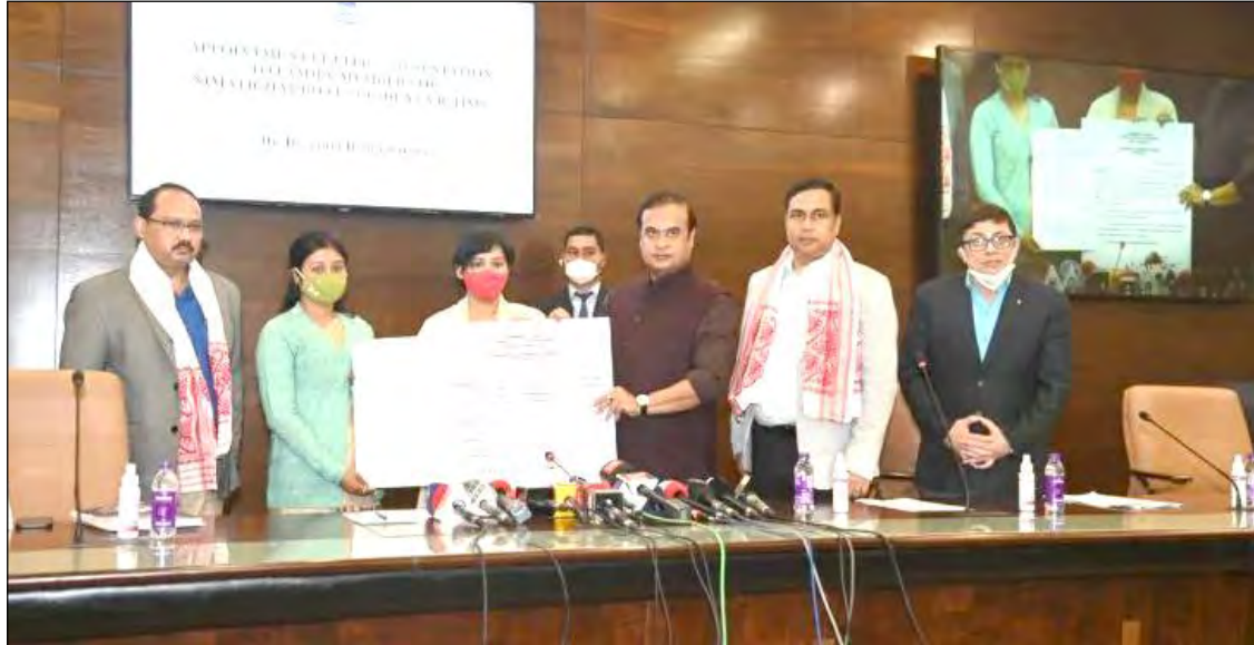
Chief Minister Himanta Biswa Sarma-i asür kinungertem nem appointment letters agütsüba noksa nung angur.

Guwahati, January 8, 2022 (Agencies): Brahmaputra nung Nimatighat rong meküpokba lendong nung asür kinungertem nem appointment letters agütsüogo.