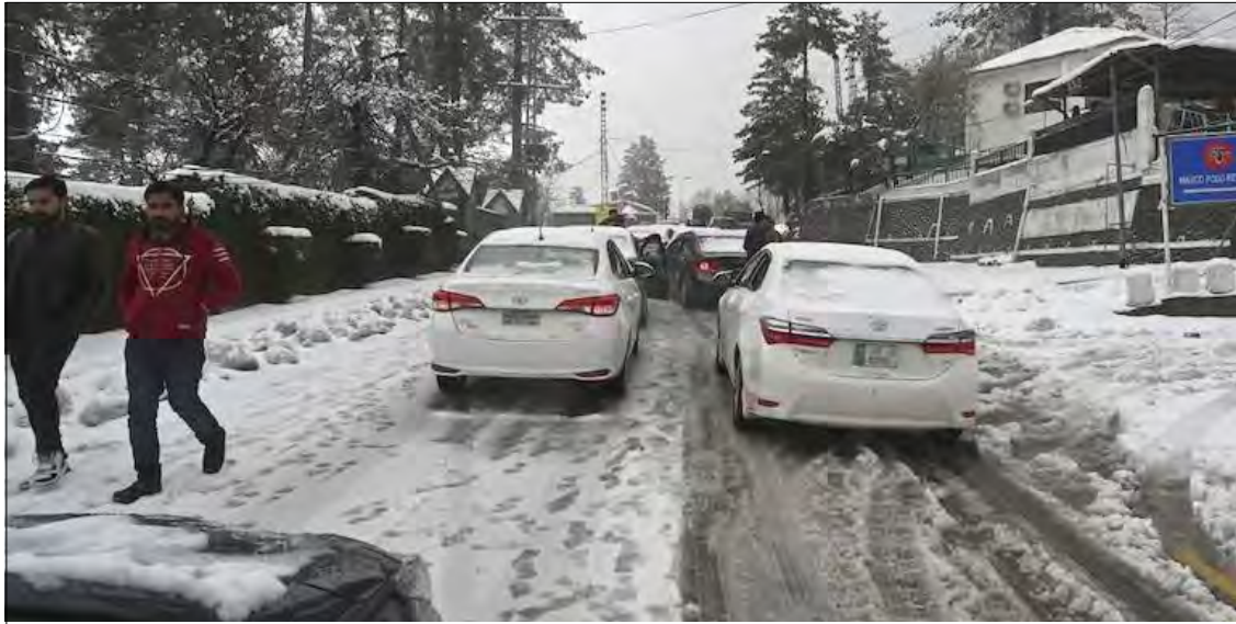
Pakistan kübok Murree tesem nung rür tali alaba ajanga garitem mouteti aliba noksa nung angur. Honibarnü raliwalirtem iba tesem nung gari taolen maka akümba sülen nisung ti tashi süogo. Nisungtem ya gari telung nung sü aika abener gari ajunga rür agi nümbangdaksüba ajanga tango moi asüba asütsü ta bilemer.