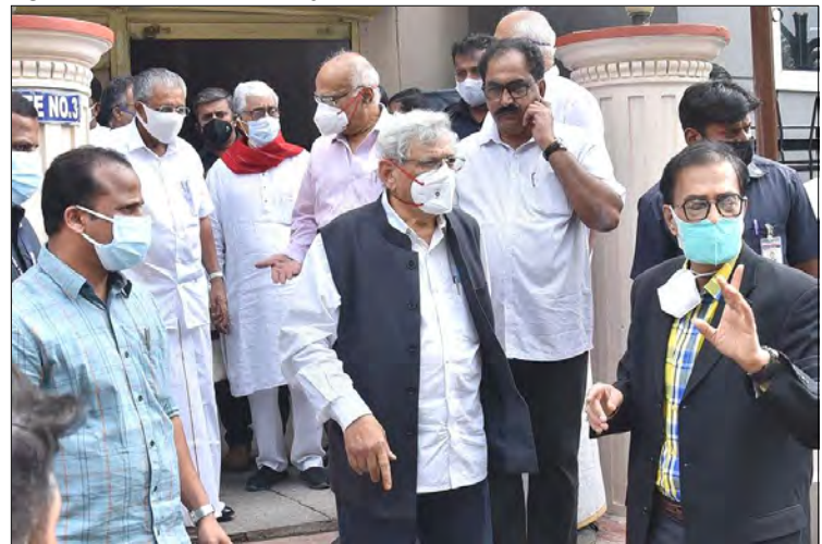
January 08, 2022 nü Hyderabad nung CPI-M party Central Committee senden nung adentsü aser Sitaram Yechuri, P Vijayan aser CPI-M lenirtem aruba noksa nung angur.

Mahua Moitra-i twitter ajanga, "BJP tamakok ngudaktsütsü atema TMC-i akokba tashi ajak inyaktsü," ta sangdong aser ibaji GFP aser Congress na den-a lemsatapa liasü.