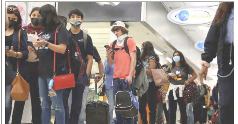
Paris, January 8: Alima nung January 1 nungi 7 tsüngda anogo nung coronavirus cases million ana dak tema potetba jangjaogo. Anogo tenet tsüngda average nung anogoshia nisung 2,106,118 dak tashidak poteta liasü.

Paisa, military base ka amakba atema iba tetuyuba agütsü, ta ashi. Abiy-i aniba sorkar aser TPLF lenirtem tsüngda ita aika mangatetep adoka aruba sülen tensa tamajungba aküm.