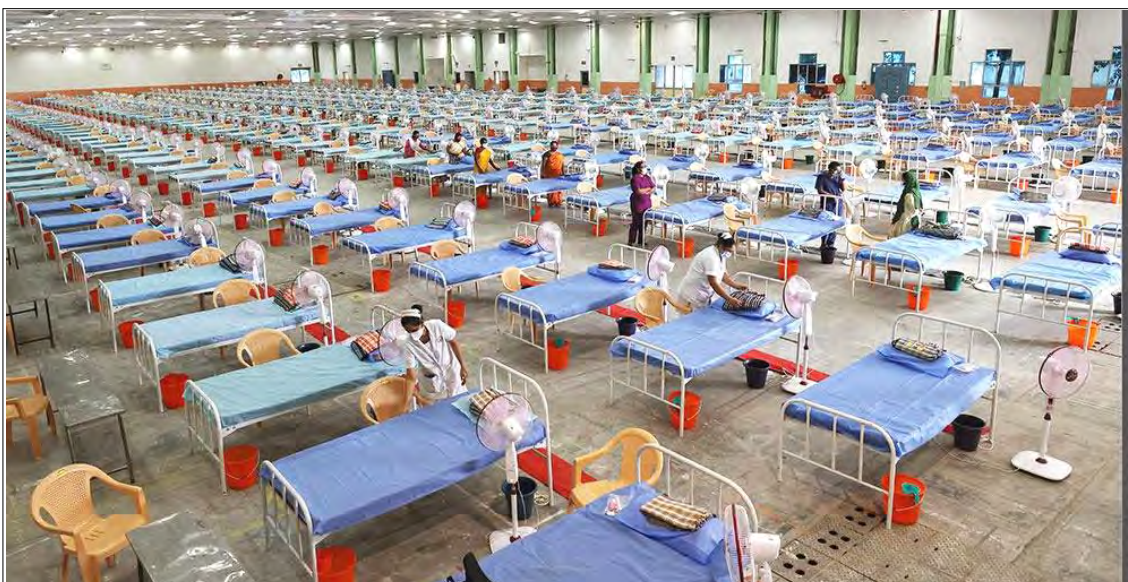
Chennai, January 08, 2022: Chennai nung coronavirus wara kanga prokba nung ajemdaker ketdangsertemi Chennai Trade Centre nung Covid-19 isolation ward amenoka yipten 900 renema aliba noksa nung angur.

Gujarat nung police-i Missionaries of Charity indang orphanage ka anema bushisüingdang tenzük. December 13 nü Gujarat kübok Vadodara yimti nung police-i Missionaries of Charity indang Nirmala Shishu Bhavan shelter home anema bushisüingdanga liasü.