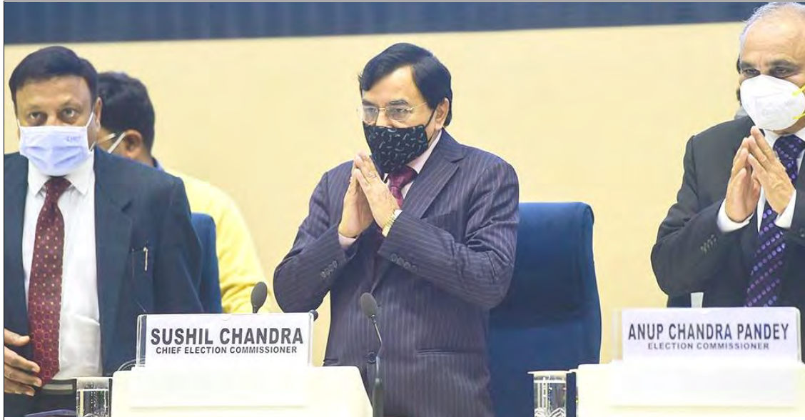
January 08, 2022 nü New Delhi nung osangbenertem senden ka nung Chief Election Commissioner, Sushil Chandra den Election Commissioner ana- Rajeev Kumar aser Anoop Chandra Pandey nungeri Goa, Punjab, Manipur, Uttarakhand aser Uttar Pradesh state tem nung assembly election agitsü atema anogotem sangdongtsü atema Vigyan Bhavan tonga aruba sülen tangokba noksa nung angur.

New Delhi, Aenjeti/January 08 (Agencies): February 10, 2022 nungi tenzuka shilem tenet lemsar state pongu nung assembly election agitsü atema Election Commission of India-i election agitsü anogotem sangdongogo.