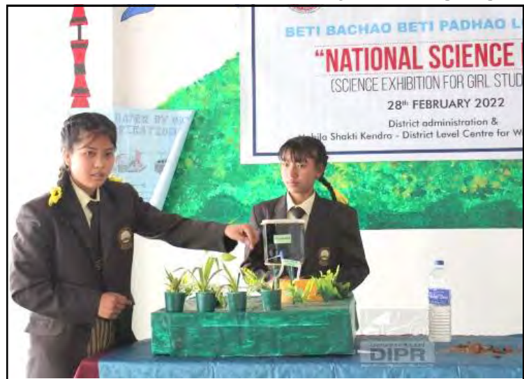
Longleng, Tsüklai/February 28, 2022: National Science Day anogomung dak sendakba nung VDB Hall Longleng kübok Inter-School Science Exhibition Competition ayonga agiba mapang kaketshirtemi shilem agiba noksa nung angur.