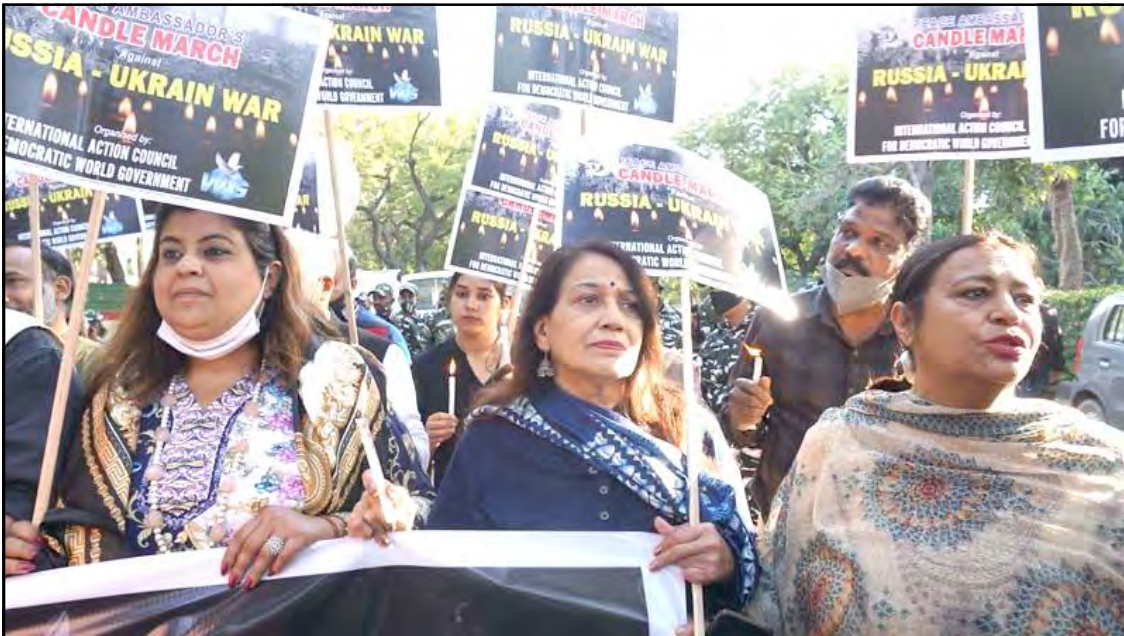
New Delhi, February 28, 2022: Russia-i Ukraine amakba anema Hombarnü Jantar Mantar, New Delhi nung International Action Council for Democratic World Government nungi züngsemtemi longkak aitba den külemi yimjung atema candle march agiba noksa nung angur.