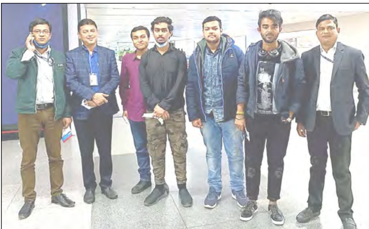
Feb. 27, 2022 nü Assam nung lanur par pezü Ukraine nungi New Delhi tonga arudang tanokba noksa nung angur.