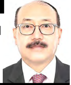
Foreign Secretary Shringla-i Ukraine tensa indang metetdaksü