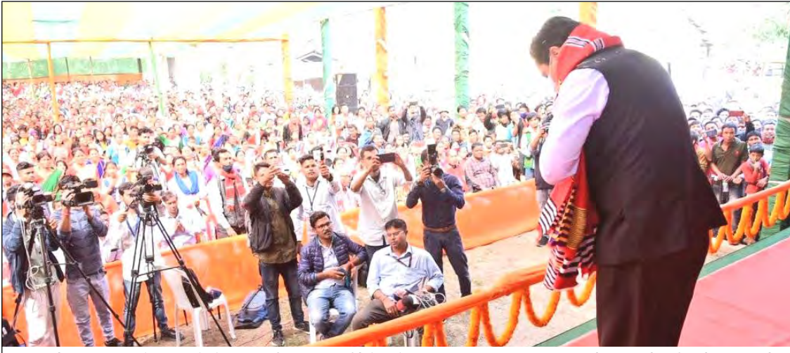
Hombarnü Union Minister of Ports, Shipping & Waterways and Ayush, Sarbananda Sonowal-i Majuli nung BJP candidate Bhuban Gam atema nüboyimba sentong nung tangokba noksa nung angur.