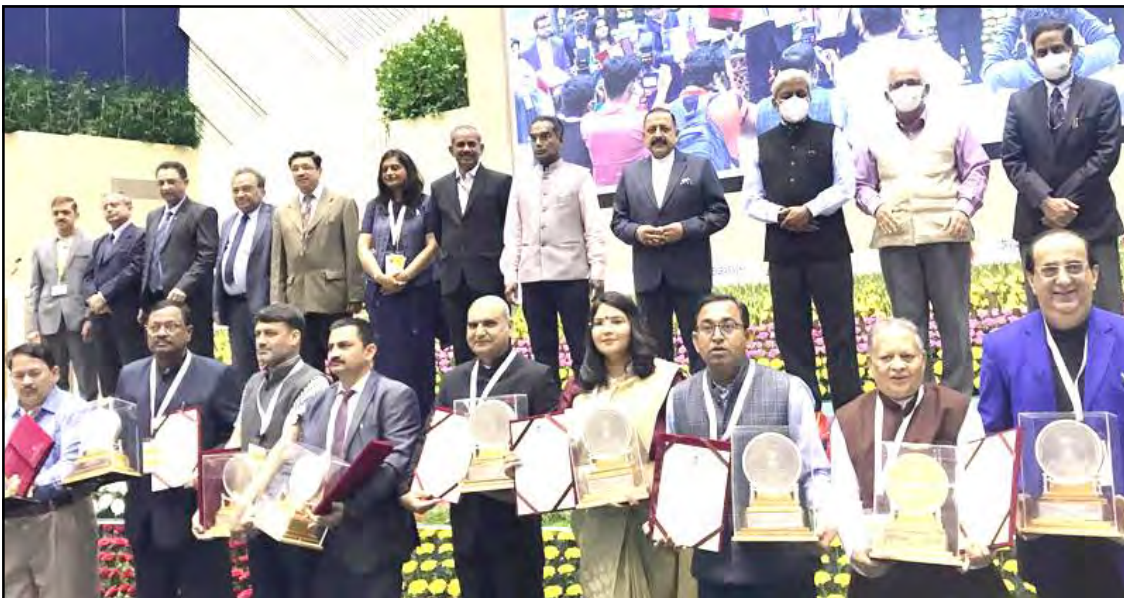
February 28, 2022 nü New Delhi nung National Science Week tembangba sentong nung Minister of State for Science and Technology and Earth Sciences (I/C), Prime Minister's Office, Personnel, Public Grievances and Pensions, Atomic Energy & Space, Jitendra Singh-i Science Communication Awards agütsüba noksa nung angur.

"Iba lima nung democracy tulutiba linük ka ama alima nung yimjung alitsü atema India-i anir kecha marendaki inyaksüla," ta laisa ashi.