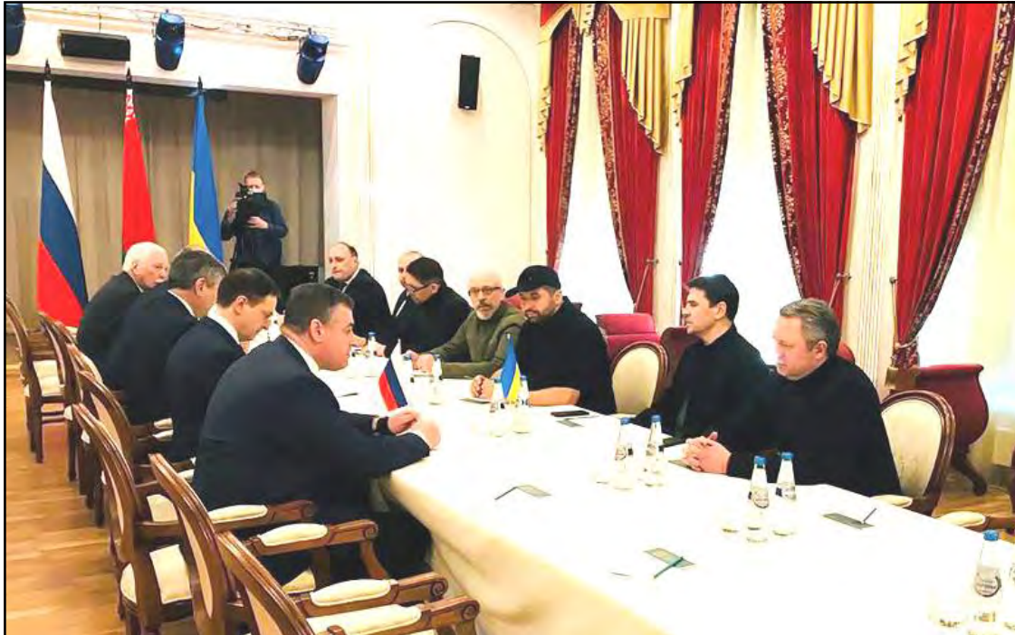
Gomel, Feb 28 : Belarus arütsü nung aliba Gomel yimti nung Russia aser Ukraine ketdangsürtem Hombarnü ajurutepa linük ana tsüngta rara adoka aliba indang jembishinüba mapang tangokba noksa ka yangi angur.

Kyiv, Tsüklai/Feb. 28 (Agencies): Ukraine-Belarus arütsü nung Russia aser Ukraine ketdangsürtem ajurutepa Russia-i Ukraine amakba indang jembishinü tenzükba noksa temai adok tenzükogo.