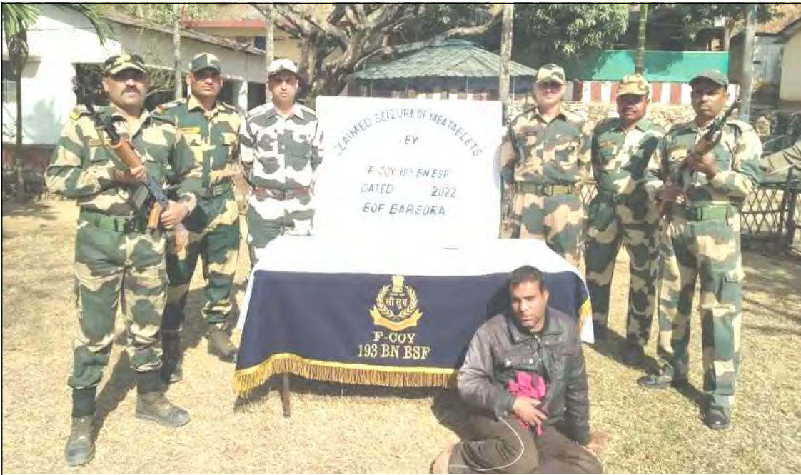
Meghalaya kübok South West Khasi Hills district nung nisung kati Yaba süngjang bener aotsü merandang apu. Iba nisung yagi Yaba süngjang 982 tashi Bangladesh-i bener aotsü lia Border Security Force (BSF) sepaitemi apu.