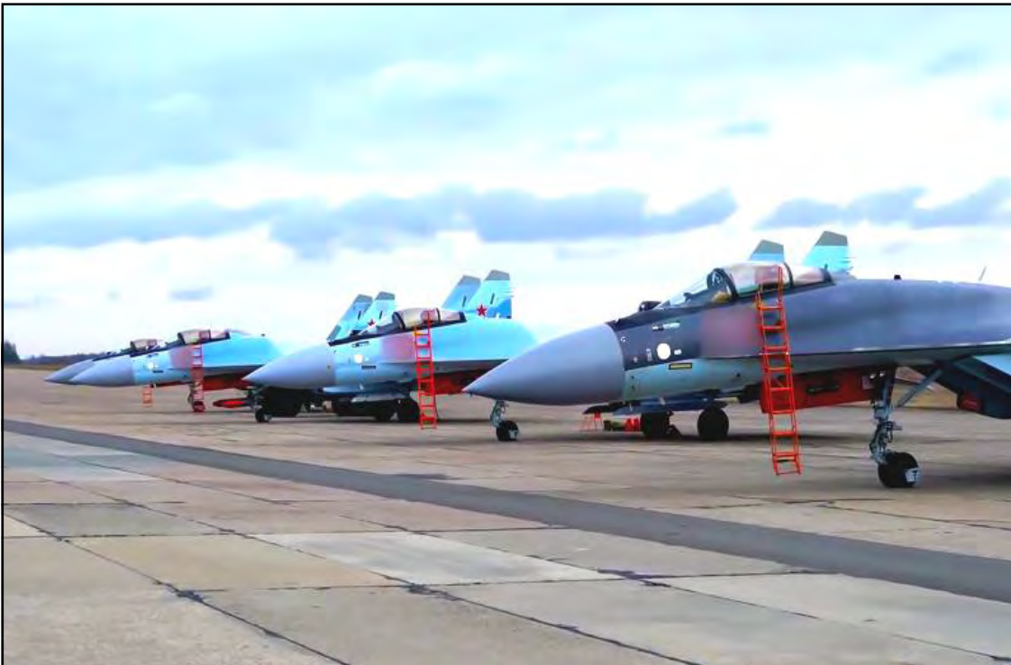
Moscow, Mar 7 : Ukraine nung Hombarnü Special Military Operation mapang tangokba noksa ka nung Russian Su-35 fighter jets tem angur.