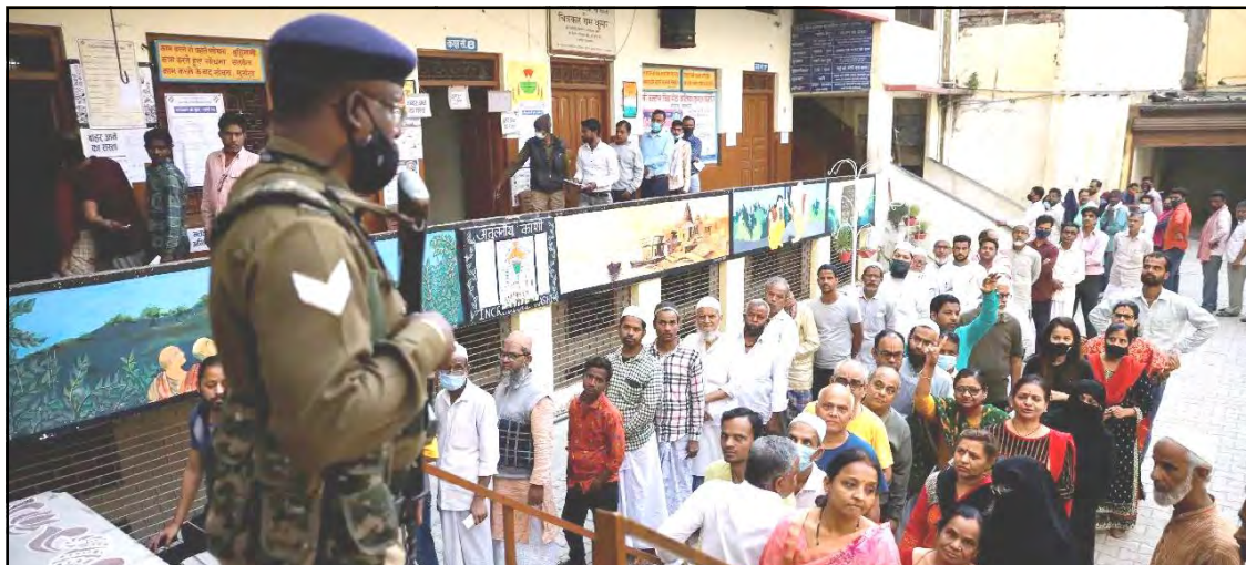
March 07, 2022 nü Uttar Pradesh nung assembly election shilem tatembangbuba anogo nung Varanasi nung aliba polling booth ka nung voters tarensena nokdaka aliba noksa nung angur.

Goa assembly nung menden 40 lir, aser sorkar akumtsü atema majority mark ji 21 lir.