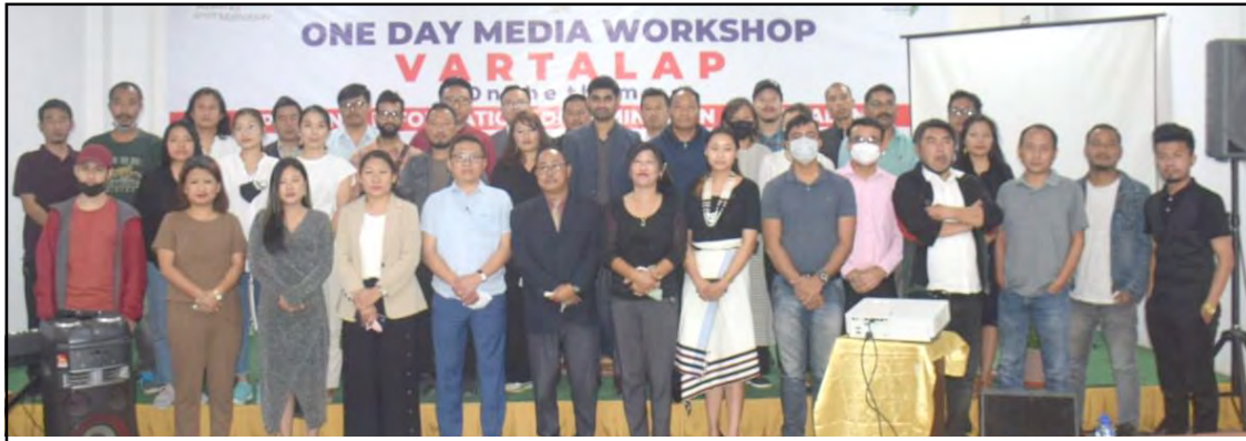
Hotel Saramat, Dimapur nung March 7, 2022 nü VARTALAP workshop agidang Dimapur nung aliba osangbener, shisalen sayur aser iba sentong ayongzükertem külemi tangokba noksa nung angur.

Dimapur, Metsüremi/March 07 (TYO): Ministry of Information and Broadcasting kübok Press Information Bureau Kohima ajanga media workshop sentong ka Hotel Saramati, Dimapur nung March 7, 2022 nü 'Improving information dissemination in Nagaland' omen nung ajemdaker ayongzüka liasü.