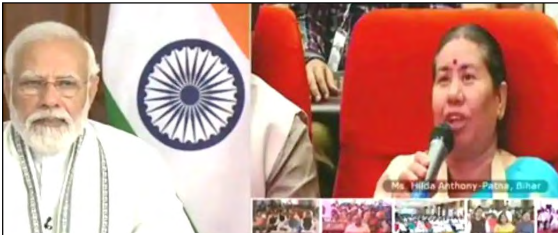
New Delhi, March 07, 2022: 'Jan Aushadhi Diwas' anogomong nung Ato kilonser, Narendra Modi-i 'Jan Aushadhi Yojana' scheme ajanga tajangzük angur tetsür ka den jembidang tangokba noksa nung angur.

New Delhi, Metsüremi/ March 07 (Agencies): Sorkari sensakertem dak rangloker inyaker, ibayongji tanübo Jan Aushadhi Yojana scheme kübok sensakertemi dialysis angati agiteter, ta Hombarnü Ato kilonser, Narendra Modi-i metetdaksü.