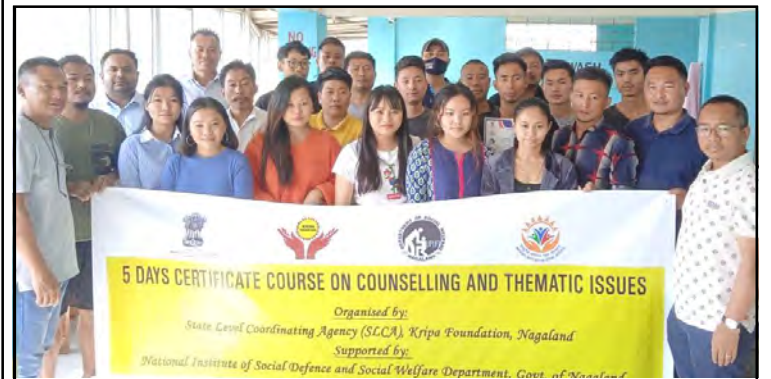
March 3 nungi 7, 2022 tashi Hotel Bravo Royal, Half Nagarjan, Dimapur nung "Certificate Course on Counselling and Thematic Issues" sentong ka ayongzüka agidang tangokba noksa nung angur.

Dimapur, Metsüremi/March 07 (TYO): State Level Coordinating Agency Kripa Foundation, Nagaland ajanga anogo pongu "Certificate Course on Counselling and Thematic Issues" sentong ka March 3 nungi 7, 2022 tashi Hotel Bravo Royal, Half Nagarjan, Dimapur, Nagaland nung ayongzüka liasü.