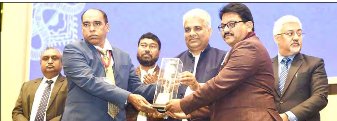
New Delhi, Mar 8 : Mongolbarnü New Delhi nung Azadi Ka Amrit Mahotsav hopta amungba nung shilem ka ama Union Minister for Environment, Forest and Climate Change, Labour and Employment, Bhupender Yadav-i mapa inyakertem nem Shram awards agütsüba noksa nung angur. Minister of State for Petroleum and Natural Gas, Labour and Employment, Rameswar Teli aser Secretary, Ministry of Labour and Employment, Sunil Barthwal nata noksa nung angur.

January 12 nü senden ghonda 13 shi menaka Kongka La anasa Hot Springs nungi PLA ainshia oatsü atema India-i takok ngua sensak mesemtet aser iba den Daulat Beg Oldi sector nung Depsang aser Demchok kübok Charding Nullah Junction (CNJ) nung patrolling rights ken o benteta meytet.