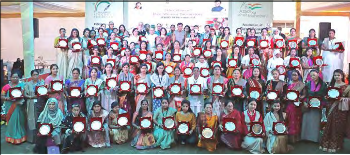
New Delhi, Mar 8 : Mongolbarnü New Delhi nung International Women's Day amungba anogo Union Minister for Health and Family Welfare, Chemicals and Fertilizers Mansukh Mandaviya-i, Best Women Vaccinators (COVID-19 Vaccinations) nem tetushi agütsüba sentong nung shilem agiba noksa nung angur.