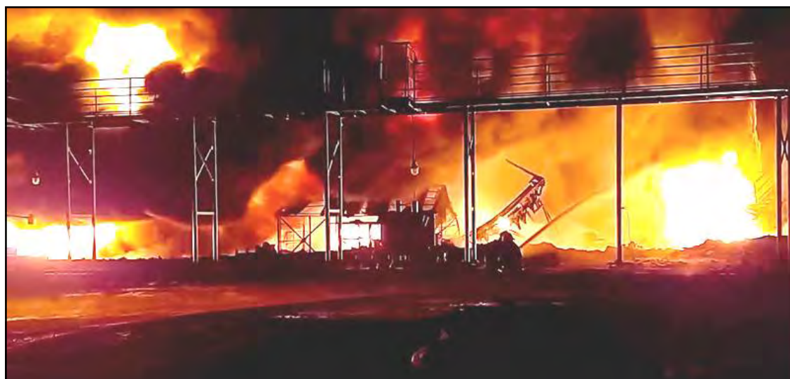
Zhytomyr, Mar 8 : Russia-i Ukraine amak tenzükter anogo 13 buba nung Mongolbarnü Ukraine kübok Zhytomyr tesem nung oil depot ka nungi mi adokba temseptsü merangba noksa nung angur.

October ita Senegal aser Rwanda-i, Africa nung mRNA vaccines yanglutsü atema mezüngbuba start-to-finish factories yanglutsü asoshi BioNTech den tenangzüktepba yangluogo.