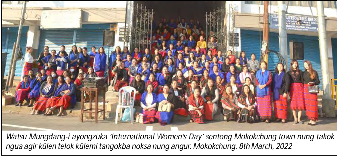
Watsü Mungdang-i ayongzüka 'International Women's Day' sentong Mokokchung town nung takok ngua agir külen telok külemi tangokba noksa nung angur. Mokokchung, 8th March, 2022

Mokokchung, March 8 (TYO): "Telung Tema Toburajung" omen dak rangloker Watsü Mungdang-i 'International Women's Day' sentong tajung ka yangi Mokokchung town tiyong nung ayongzüka mungogo.