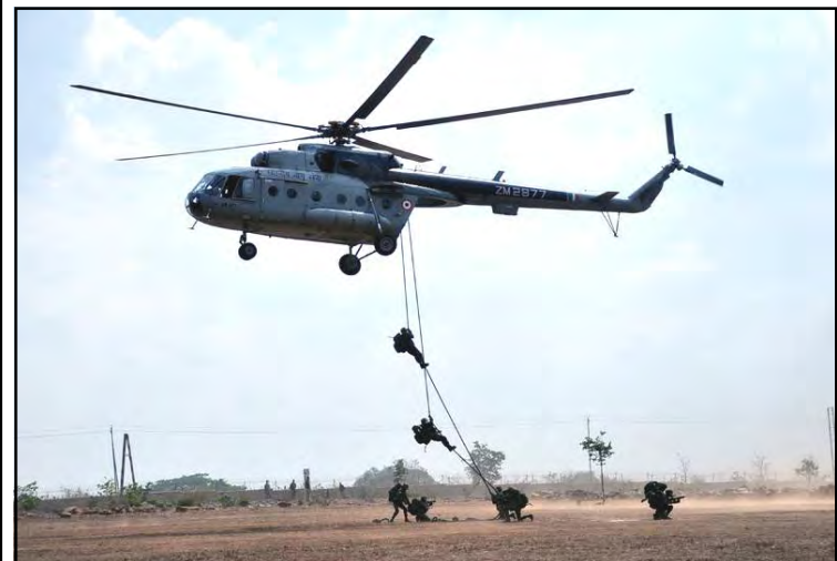
Belagavi, Mar 08 : Mongolbarnü Belagavi nung Indo-Japanese Military Exercise 'Dharma Guardian' mapang India aser Japan nung sepaitem tangokba noksa nung angur.

2021 TMC-i Assembly election akokba sülen taoba Union minister Babul Supriyo densema BJP lenirtem aika TMC nung denogo. TMC toktsür aoba lenir Mukul, Sabyasachi Dutta aser Rajib Banerjee nungera party-i tanaben meyipa aruogo. Parnok timba Assembly election matong tsüingda BJP nung dena liasü.