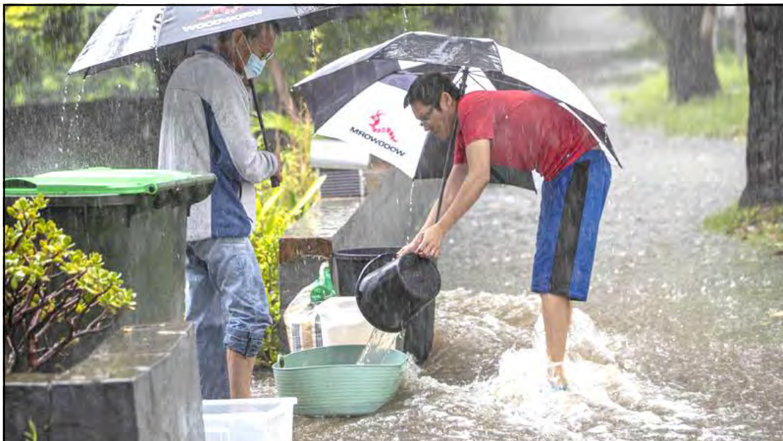
Sydney, March 8, 2022 : Willoughby, New South Wales, Australia nung nüburtemi tzümetzung nokdangtsü atema jenjang agiba noksa nung angur. Tzümetsüng, mopung aser yipru ajanga Australia anütok tzükümlen maneni timtem agütsür. Iba tesem nung aliba nüburtem aika pei ki toktsür jenshiogo. Iba lendong nung Queensland nung nisung 13 aser New South Wales nung nisung tenet süogo.