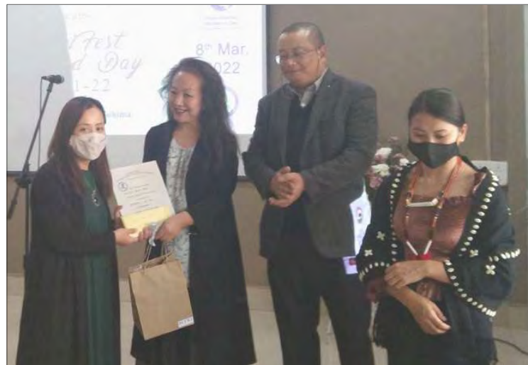
Sesino Yhoshü-i MykiFest Award 2021-2022 agizükba angur.

Dimapur, March 8, 2022 (TYO): March 8, 2022 International Women's Day indang sentong ka agidang tetsür pezü nem MykiFest Award 2021-2022 agütsüogo.