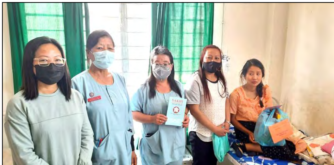
"International Women's Day" amungba tenüng nung March 8 nü district administration den külem sür Sakhi One Stop Centre Mokokchung-i Dr. Imkongliba Memorial District Hospital (IMDH) semdanga yangji amunger tetsür ajak nem temang nung teyari agütsüba chiyungtsü kar alemdang tangokba noksa nung angur. Mokokchung, 8th March, 2022

Iba Assembly ya anepdang 11:00 shitak nungi tenzüksü. Anungji, Angami Student's Union den sendaktepa alir tentet aser unit ajak medema aruagi 1st Union Assembly nung adentsü asoshi mepishir, ta kasa sangdong ajanga ashi.