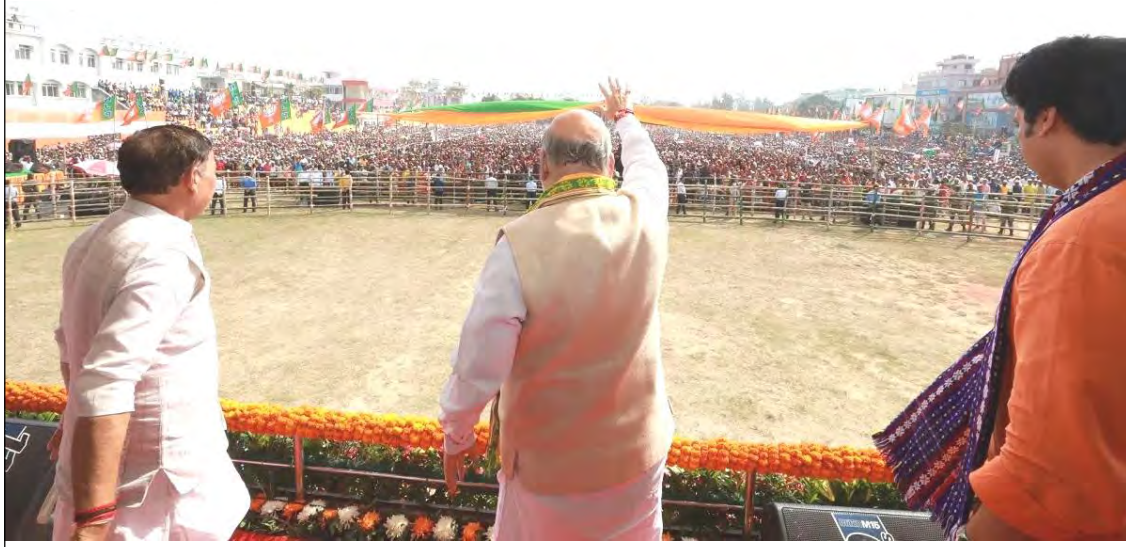
Mongulbarnü Union home minister Amit Shah-i Agartala nung aliba Swami Vivekananda Stadium nung lokti senden ka nung jembidang tangokba noksa nung angur.

Agartala, March 8, 2022 (Agencies): Mongulbarnü Union home minister Amit Shah-i Tripura nung dang BJP nem maongka agütsütsü ayongzük.