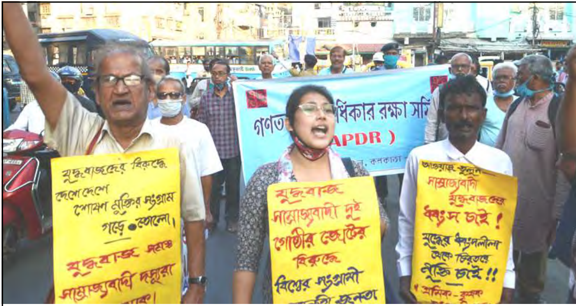
Kolkata, March 09, 2022: Bodhbarnü Kolkata nung Association for Protection of Democratic Rights (ADPR) züngsemtemi Russia-i Ukraine amakba anema longkak aitba noksa nung angur.