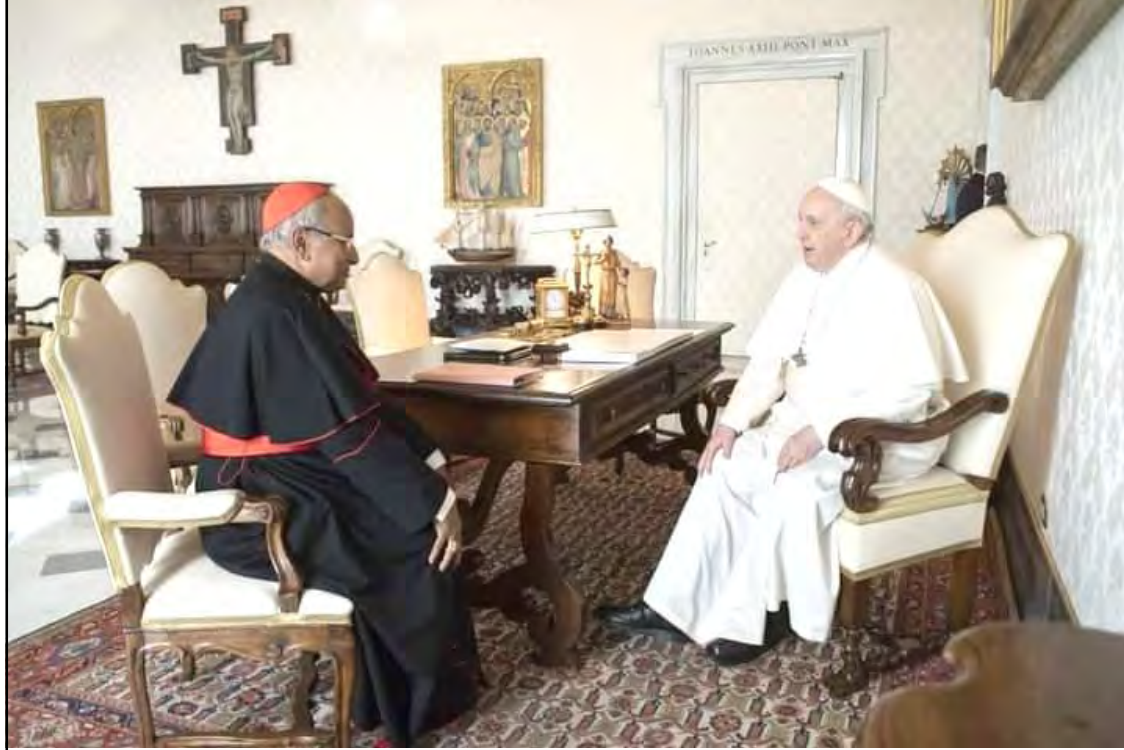
February 28, 2022 nü Vatican nung Sri Lankan Arogo Cardinal, Malcolm Ranjith-i Pope Francis ajurua senden amendang tangokba noksa nung angur.

March 09, 2022: Sri Lanka nung Arogoi United Nations (UN) dang 2019 küm Easter Sunday nü Tenla ki asem amakba tatalokba bushisüngdangtsü mepishio.