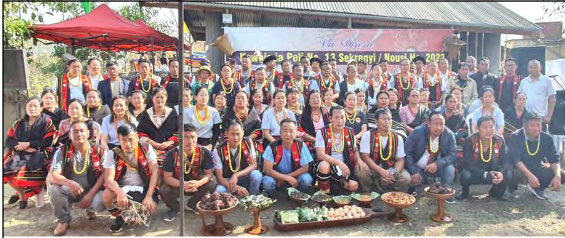
March 9, 2022 nü Sekrenyi-cum-Get-together sentong agidang tangokba noksa nung Kewhimia Peli No. 13 züngsemtem angur.

Kohima, March 09 (TYO): Kewhimia Peli No. 13 pur Sekrenyi-cum-Get-together 2022 sentong ka Khriesanuomia Badze, Pfuchatumia Khel, Kohima village nung March 9, 2022 nü munga liasü.