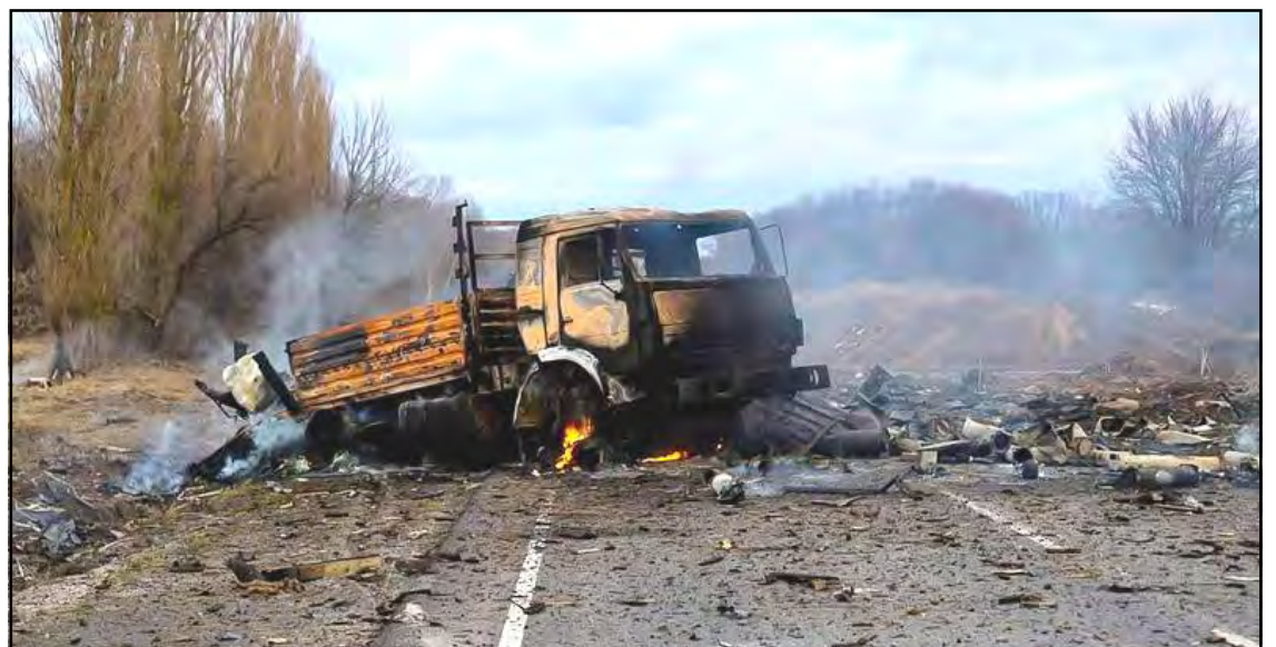
Chernihiv, Mar 9 : Ukraine nung Russian Special Military Operation tenzük Bodhbarnü anogo 14 ajungdang Chernihiv nung army gari teraksa ka tangokba noksa nung angur.