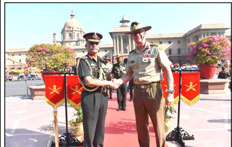
March 09, 2022 nü New Delhi nung Chief of Army Staff, General Manoj Mukund Naravane-i Australia Army Chief, Lt Gen Rick Burr ajurua salemdang tangokba noksa nung angur.

Ajisüaka oil company temi takoksa menoktsü atema khenyongi sen aika matutsüa akok saka anogo shia litre ka nung poisa 50 den tajemba atutsüa akok, ta osang angazüker.