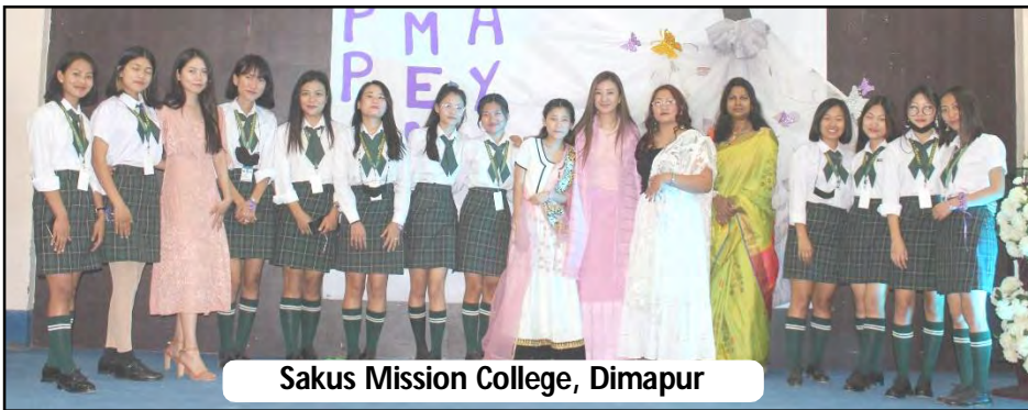
Sakus Mission College, Dimapur