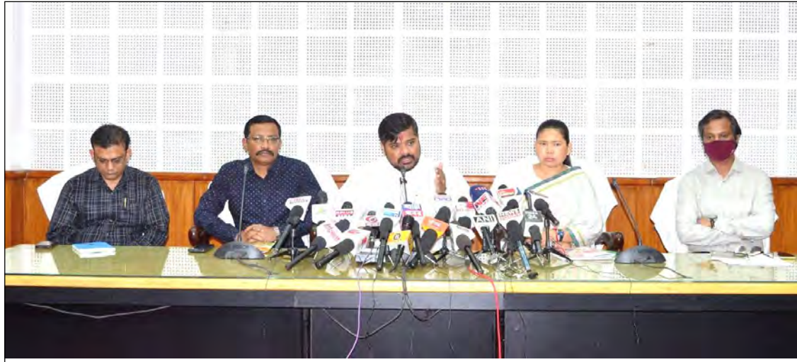
Tripura cabinet spokesperson aser Information & Cultural Affairs (ICA) minister Sushanta Chowdhury-i (Tiyong) Bodbarnü osangbener den jembidang tangokba noksa nung angur.

Agartala, March 9, 2022 (Agencies): Tripura sorkari tetsürtem tashi itdaksütsü atema 2022-23 financial year nung Rs 400 Crores endoktsü.