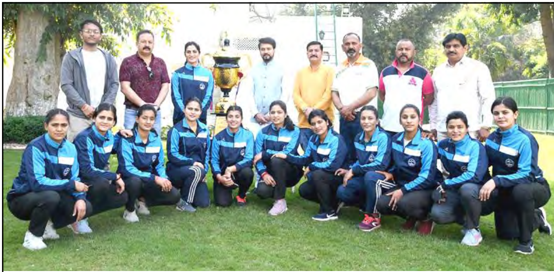
New Delhi, Mar 9 : Union Minister for Information and Broadcasting, Youth Affairs and Sports Anurag Singh Thakur den Himachal Pradesh nungi tetsür Kabaddi team New Delhi nung Bodhbarnü tangokba noksa nung angur.