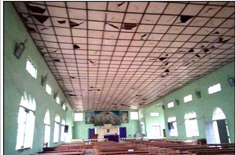
Myanmar nung Demoso jila kübok Saun Du La yimdak Fatima Arogo Tenla ki noksa nung angur.

March 09, 2022: Myanmar Khristan putir kati metetdaksü. kübok Kayah state nung Yaküm May ita nungi sepaitemi tayimtsü nungi tenzüka Loikaw nung aliba amakdang bomb ajanga Catholic Arogo kübok sepaitemi Tenla ki ti raksatsüogo. Tang iba Arogo kübok Arogo 38 nungi 16