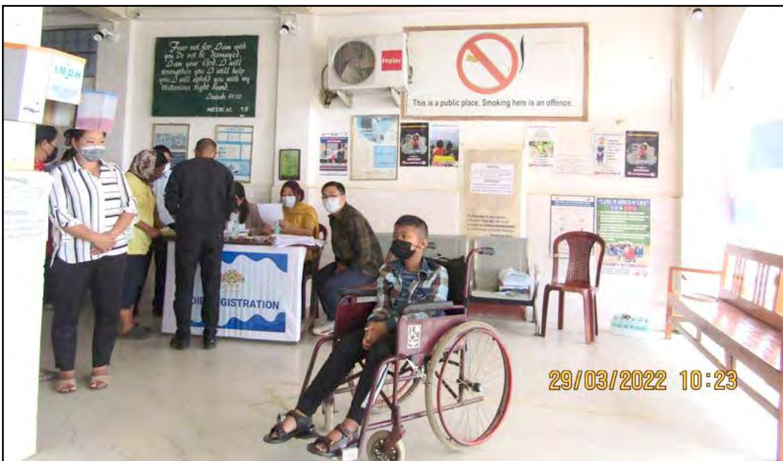
Mokokchung, Metsüremi/March 29, 2022: Mongolbarnü IMDH Mokokchung nung matamabensar tem atema Medical Assessment Camp ayongzükba mapang tangokba noksa nung angur. Iba camp ya IMDH Mokokchung den Department of Social Welfare longjemer ayongzuka liasü.