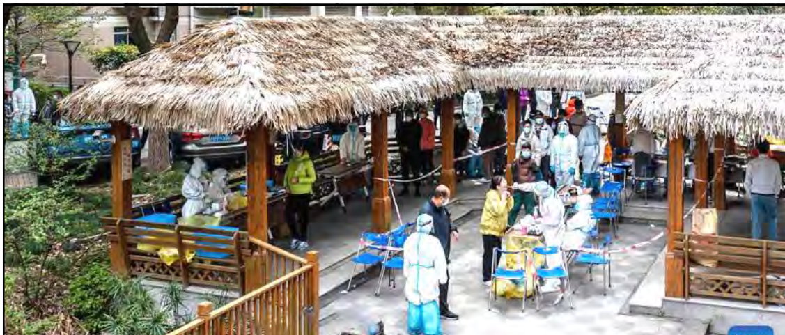
Shanghai, March 29: March 28 nü Shanghai kübok Pudong District nung COVID-19 tashidak tendangba tesem nung Zhejiang Province nungi medical worker temi nüburttem dak nucleic acid tests agiba noksa nung angur. Kidanger Zhejiang province nungi tashidak tenangertem, yimti nung nucleic acid test agishiba nung teyari agütsüsi atema Hombarnü Shanghai-i oa liasü.