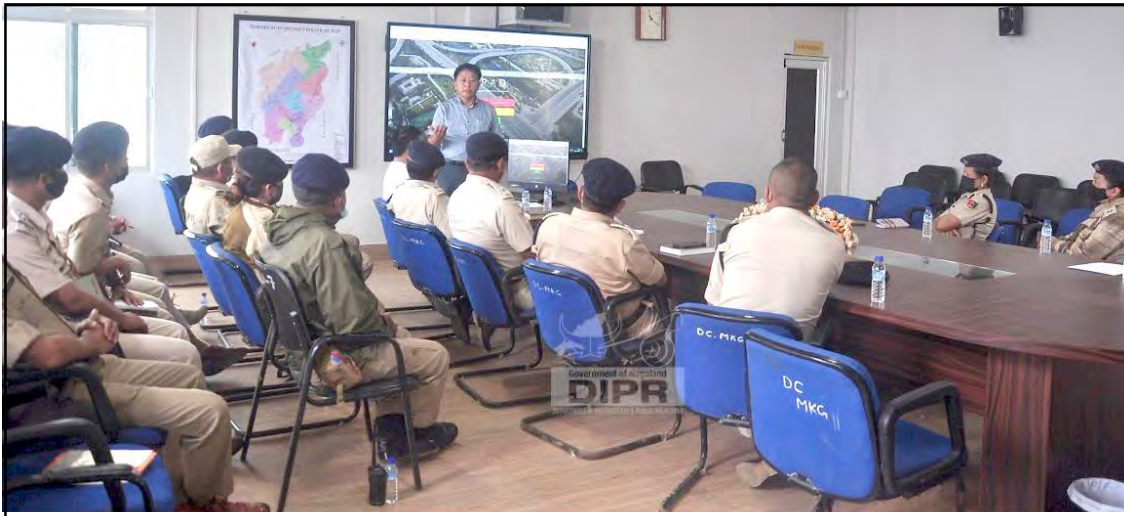
National Informatics Centre, Mokokchung nungi ketdangsürtemi ADC (Planning) Conference Hall, Mokokchung nung Mokokchung Police ketdangsür nem March 29, 2022 nü iRAD (Integrated Road Accident Database) training agütsüba mapang tangokba noksa ka yangi angur.