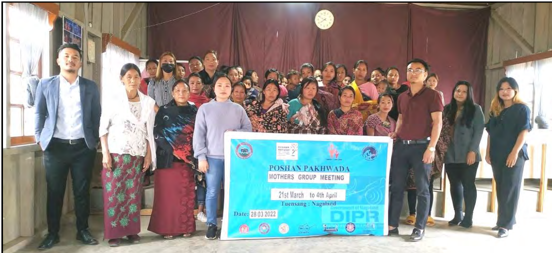
Panchayat Hall St. John A' Colony, Tuensang kübok ayongba Mothers Group Meeting nung adenertem külemi tangokba noksa nung angur.

Tuensang, Metsüremi/ March 29, 2022 (TYO): Hombarnü, Panchayat Hall St. John A' Colony, Tuensang nung 'Mothers Group Meeting' agia liasü, ta sangdong ka ajanga metetdaksü.