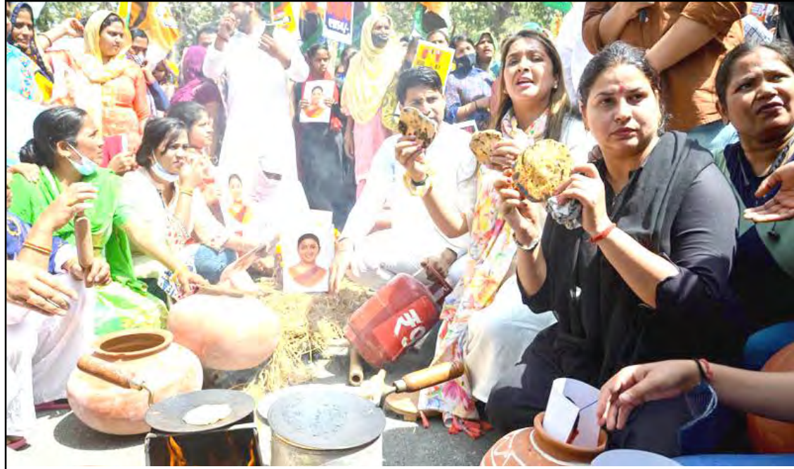
New Delhi, March 29 : Indian Youth Congress züngsemtemi petrol, diesel aser LPG jenjang ajungketba anema New Delhi nung Mongolbarnü longkak aiba mapang tangokba noksa nung angur.

New Delhi, Metsüremi/ March 29 (Agencies): Taoba anogo ti tsüingda tenetbenbuba petrol, diesel aser LPG jenjang ajungketba sülen Mongolbarnü Indian Youth Congress züngsemtemi Delhi nung petroleum ministry indang office kima longka aita liasü.