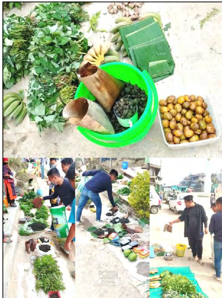
Phek, Metsüremi/March 29, 2022: Phek Town nung plastic juli/ yangkhu amshitsü melen PTYS, PTCU, PTC aser PDCCI den Plastic & Hygiene Police, Phek longjemer yimdong nung yokji-yokjar nem waküp (bamboo culm sheath) agi yangluba pungdangtem lema agütsüba noksa nung angur.