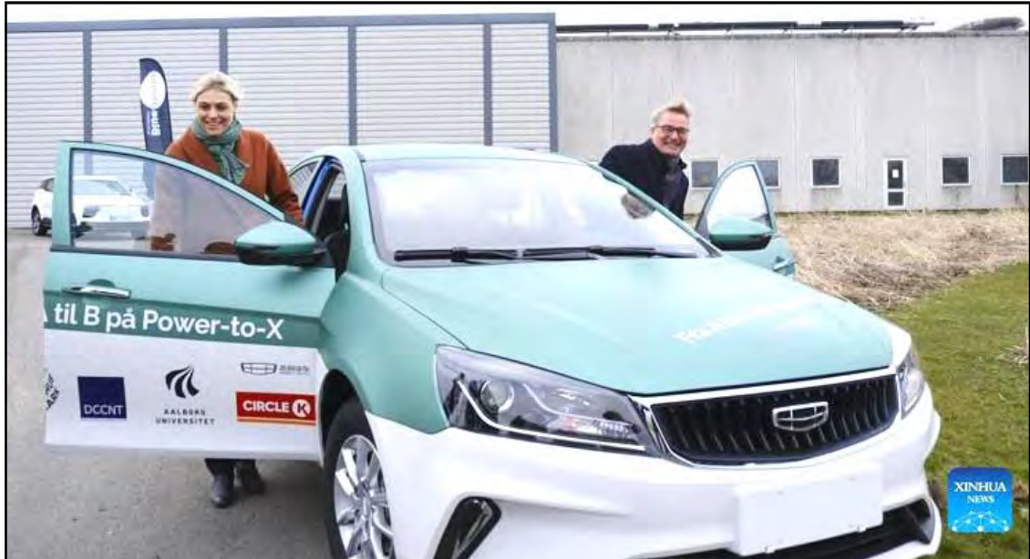
Copenhagen, March 29 : March 28 nü Aalborg, Denmark nung green e-methanol vehicle ka tendangba mapang Denmark indang Minister for Transport Trine Bramsen (tabelen)-i shilem agiba noksa nung angur. Chinese company Geely-i, Aalborg nung Hombarnü nungi green e-methanol vehicles tendang tenzükogo.

anasa tesem kar amak aser iba ajanga ki 80,000 dak tema electricity maka aküm, ta ketdangsürtemi ashi. Anütoktiplen Ukraine nunger sepaitemi telangzüba agüja radar ajisiüka Mariupol yimti maziükteti timtemba mapang ka lir. Russia nunger sepaitemi yimti mekütbanger lir aser iba ajanga yimti nung alir nisung 160,000 shi chiyongtsü, tajemtsü tzü aser mozü agi anünga kümdar. Ukraine ketdangsür tejen kati ashiba agi nisung 5,000 shi süogo, ajisiüka tasü mang bendenba sülenang asür nisung 10,000 shi asütsü.