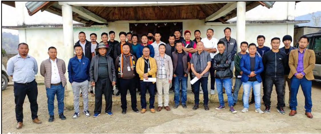
Chakhesang Youth Front ketdangsür aser dangartem Chetheba nung sentong ka agidang tangokba noksa nung angur.

Kohima, Metsüremi/March 29 (TYO): Chakhesang Youth Front (CYF) puri March 25 nungi 26 anogotem nung par den affiliate süa aliba unit ajunga semdanga senden mena liasü.