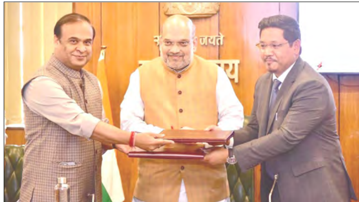
March 29, 2022 nü New Delhi nung Union Home Minister Amit Shah lia Assam CM Himanta Biswa Sarma aser Meghalaya CM Conrad Sangma nati tenangzüktep nung sign asüba sülen agiba noksa angur.

New Delhi, March 29, 2022 (Agencies): March 29, 2022 ya Northeast atema otsüsüsü anogo ka lir kechiyong tanü Assam aser Meghalaya chief minister temi küm 50 shi atsütepa aruba arrtsü ken o angatetteptsü atema tenangzüktep agiogo.