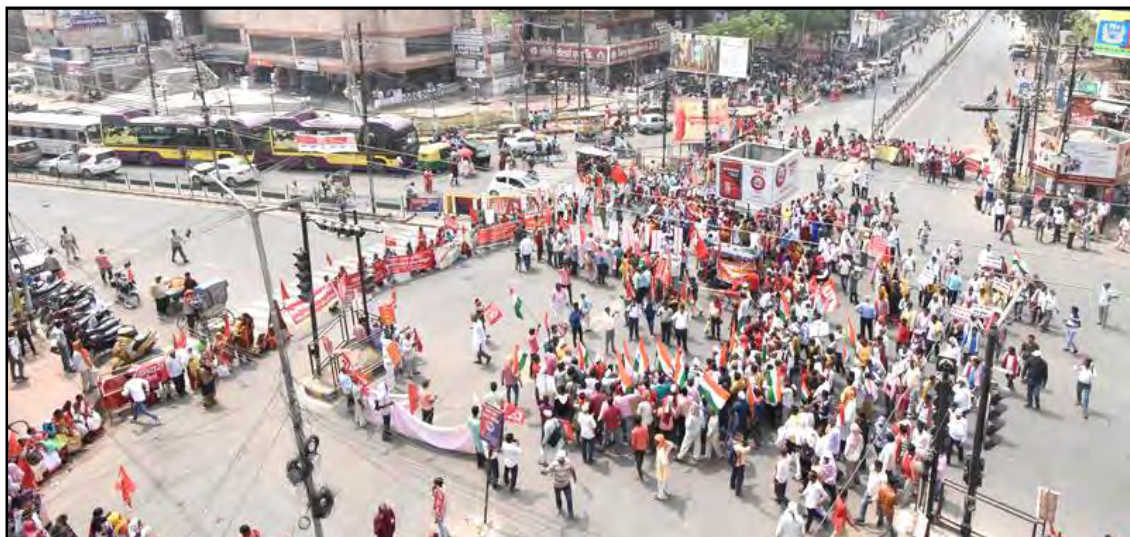
Patna, March 29 : Centre sorkar indang anti-labour policies anema linük ajunga nung longka aitba mapang Patna nung Mongolbarnü Dak Bungalow lenmang nung Left Trade Union-i longkak aiba noksa nung angur.

Modi-isa, linük nüjiso ngur küm 75 ajungba mapang, taruba ita 12 tsüingda district ajak nung 'amrit sarovar' (tzübo) 75 atutsü atema tenangzükba ka agitsü asoshi nüburttem ayongzüka liasü.