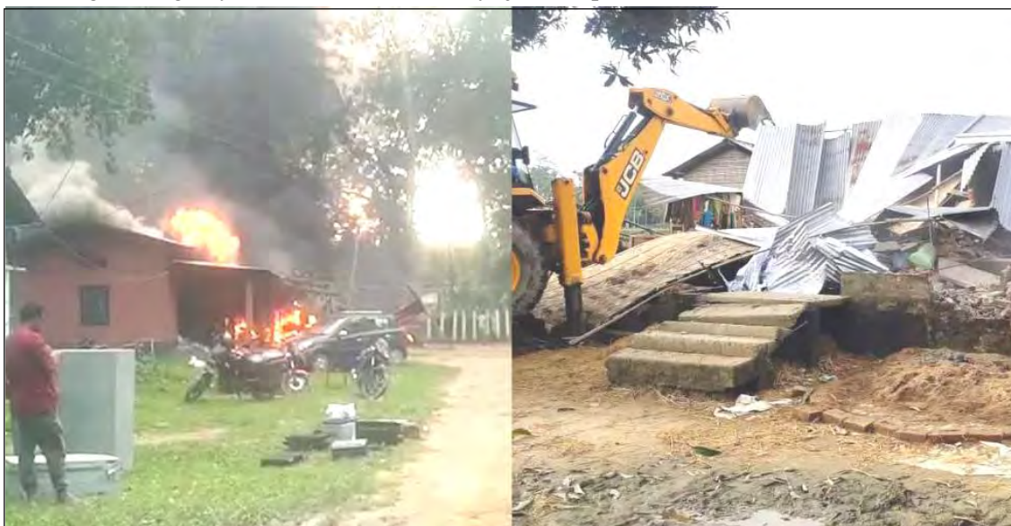
Assam Trinamool Congress (TMC)-i, Assam nung Nagaon district kübok Batatdrava nung ango ayoker ka police chiokba sülen mapang tatsüka dang lir asüba ken o bushisüngdangtsü khangogo. Iba nisungba asüba ajanga Batatdrava nung mepetmesü tulu adok aser nüburtemi police station rongtokja liasü.

"Iba rail lenmang raksar aliba ya yanglushiba ajanga Assam kübok Barak aser Brahmaputra valley sendaktepsüba dang masü saka Tripura, Mizoram aser Manipur nung tesem kar linük nung tanga tesemtem den sendaktepdaktsüsi," ta CM Sarma-i shisem.