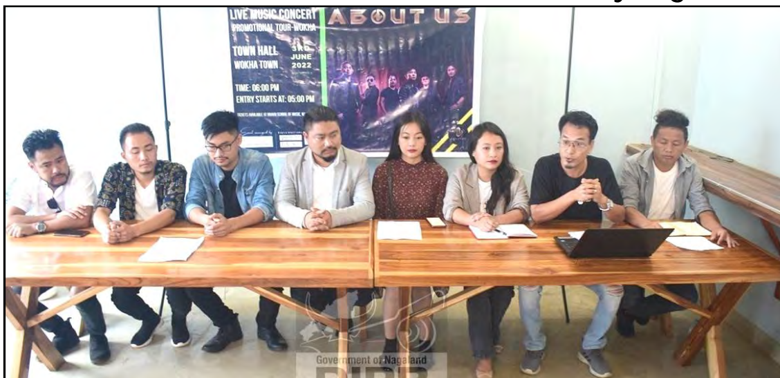
Hotel Morashen, Wokha nung press conference agiba mapang Acoustic Club puri 'About Us' band atema concert ayongzüksü jembiba noksa nung angur.

Wokha, Monupii/May 23, 2022 (TYO): Wokha nung amenoka aliba Acoustic Club-i "ABOUT US" band atema concert ka achayangtsü. About Us pur promotional tour shilem ama Acoustic Club-i iba concert ayongzüksü aser June 03, 2022 nungi iba concert tenzüksü, ta sangdong ka ajanga metetdaksü.