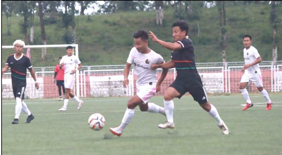
1st Kohima Super Cup asayamung nung Barak FC aser A Yhome FC asayar tsungda ball raktepba noksa nung angur.

Kohima, Monupii/May 23, 2022 (TYO): Indra Gandhi Stadium kübok tasayadak aliba Kohima Super Cup football asayamung nung Barak Football Club aser Aphuyemi FC nati pei pei tata league quarter final match takok nguogo. Kohima Town Club (KTC) ajanga iba asayamung ayongzüker.