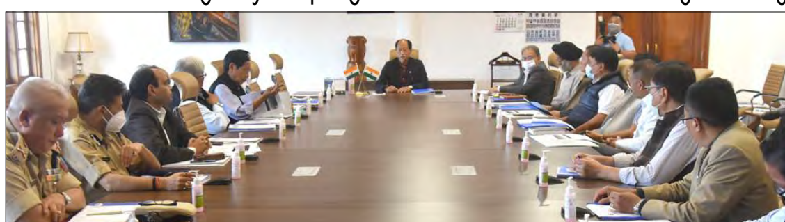
Chief Minister's Residential Complex, Kohima nung May 23, 2022 nü meyi mapang lendong-tsüdong ajurudang yariteptsü renemshia aliba asadanga senden ka mena liasü.

Dimapur, Monupii/May 23 (TYO): Nagaland Chief Minister & Chairman NSDMA, Neiphiu Rio lenisüba kübok Chief Minister's Residential Complex, Kohima nung May 23, 2022 nü meyi mapang lendong-tsüdong nungi kumzükba alitsü asoshi renemshia aliba asadanga senden ka mena liasü.