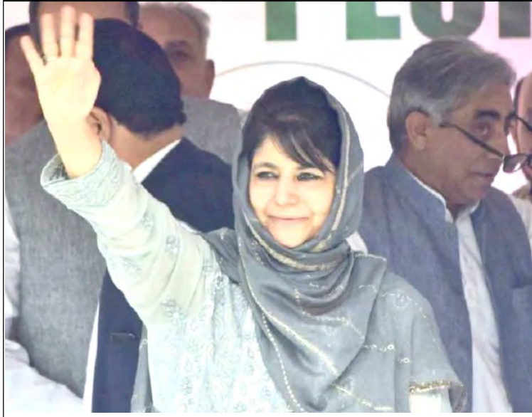
Mehbooba Mufti (File photo)

Guwahati, Monupii/May 23 (Agencies): Assam chief minister Himanta Biswa Sarma-i madrassa tem dak sendakba nung pa tebilemba lemsatepba sülen opposition party aser Muslim cleric temi pa aitsü tenzükogo.