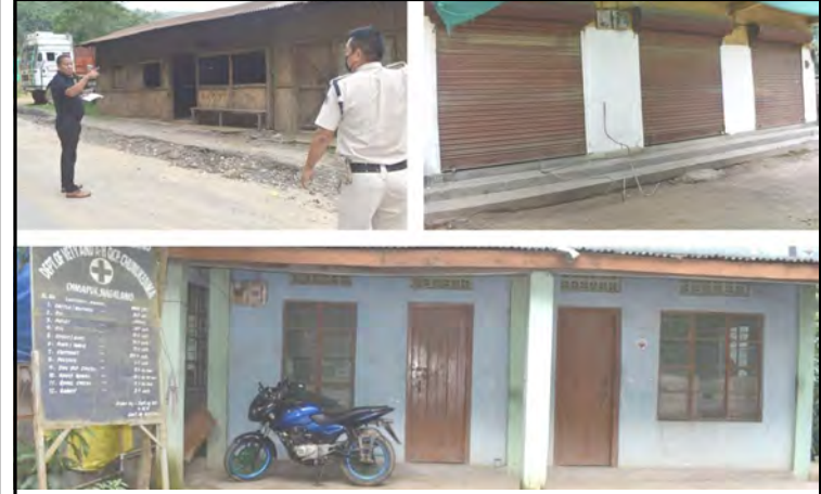
Ketdangsurtemi check gate tem meita aoba noksa nung angur.

Dimapur, Monupii/May 23 (TYO): Home Department tetuyuba dak ajemdaker Chumoukedima district-i, May 23 nü Check gate tem meitaogo. Check gate tem aser tanga tesemtem nung garitem nungi ozüng alema senotsü saruba indang osang angazükba sülen inspection team dang mapangshia osang agütsütsü tuyuba dak ajemdaker inspection team-i Chumoukedima aser Medziphema check gate meita oa liasü. Chumoukedima district kübok police check gate, Departmental aser Municipal, aser Town Council check gate tem ya Administration, police, aser DPRO Staff temi mieta oa liasü. Osang agütsüba anogo nungi tenzüker iba osang agütsüba mapang tashi nung Chumoukedima kübok check gates/toll-gate kecha inyaksangshi mesüi liasü. Chumoukedima Town Council aser Medziphema Town Council indang toll-gate-a shibangogo. Meita aoba mapang sorokar department balala indang check gate tem rongnung Veterinary, Geology & Mining, Forest, Police, Excise, aser Chumoukedima Town Council densema liasü, koba nija ki dang amenoker lir. Kasa mapang nung Home Department ajanga Nagaland sorkar tetuyuba dak ajemdaker Mon District Administration aser Police-i, interstate Police check