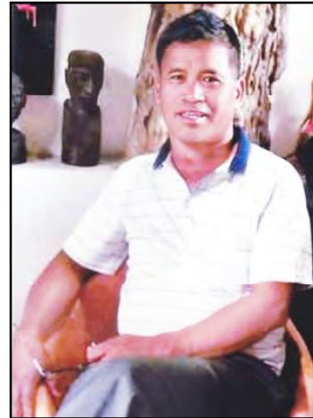
Asür Aomeren Lemtur 24/05/2020

Temeim oba, nai onok toktsür orr tanü küm ana (2) ajangba anogo nung onoki na menungra bilemteter.