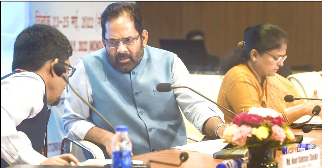
May 23, 2022 nü New Delhi nung Haj 2022 Deputationists atema training tenzüksüba sentong nung Union Minister for Minority Affairs, Mukhtar Abbas Naqvi adenba noksa nung angur.

Relay sentong Guardian Ring nungji linük 70 dak temai shilem agitsü aser item sentong nung Union minister tem, film actor tem, saisapongertem, Yoga mongintem aser tejangrartemi shilem agitsü.