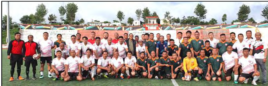
Men's football final match asyartem den tongtibang nisungtem aser NDPP Kohima Region ketdangsurtem külemi tangokba noksa nung angur.

Kohima, Aami/June 24, 2022 (TYO): 9-Kohima Town Assembly Constituency (A/C) aser 15-Southern Angami-II A/C nati National Democratic Progressive Party (NDPP) Kohima Region Inter A/C sports meet - men's football aser women's volleyball asayamung kokogo. Honibarnü Indira Gandhi Stadium Kohima nung NDPP Kohima Region Inter A/C sports meet asaya liasü, ta sangdong ka ajanga metetdaksü.