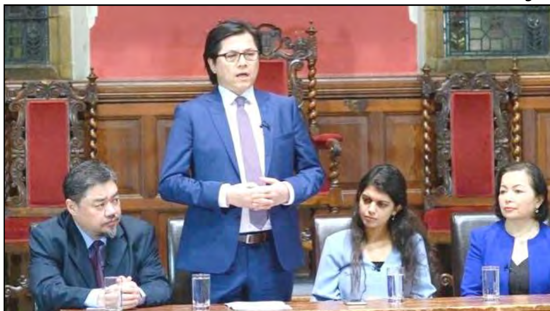
United States Commission on International Religious Freedom (USCIRF) summit ka nung Nury Turkel-i jembidang tangokba noksa nung angur.

Washington D.C, June 24 (Agencies): 2022-23 kümsük atema United States Commission on International Religious Freedom (USCIRF) Chair, Nury Turkel shimogo, ta International Christian Concern (ICC)-i metetdaksü.