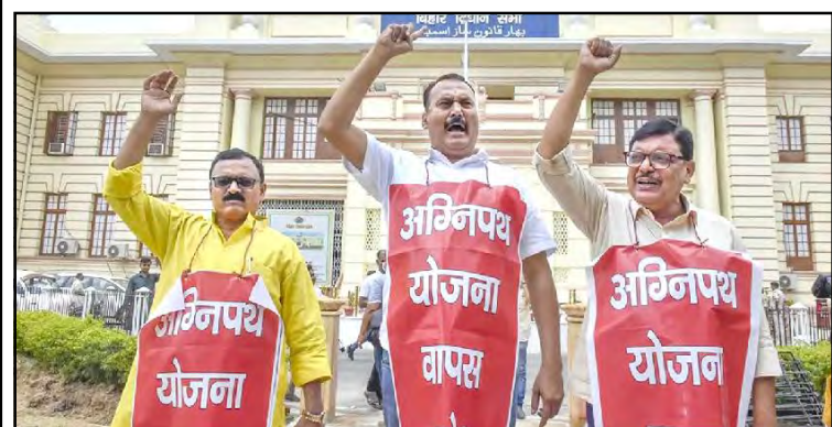
June 24, 2022 nü Bihar Vidhan Sabha, Patna nung Assembly senden mezüng anogo nung CPI MLA temi Agnipath scheme anema longkak aitba noksa nung angur.

Kerala nung, talisa Idukki, Wayanad, Kottayam aser Pathanamthitta district tem nung yimtenren party balala aser aluyimer telok balalai June 3 nü SC tetuyuba anema ola adokdar.