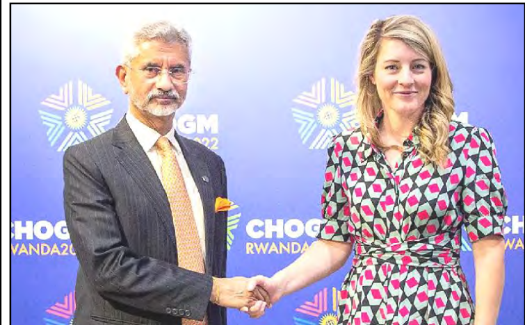
June 24, 2022 nü Rwanda nung India External Affairs Minister, S Jaishankar-i Canada Foreign Minister, Mélanie Joly ajurudang tangokba noksa nung angur.

Ano külen Research & Analysis Wing (R&AW) nung tongti, Samant Kumar Goel maneni R&AW tongti inyaksü atema küm ka bendenloktsüogo.