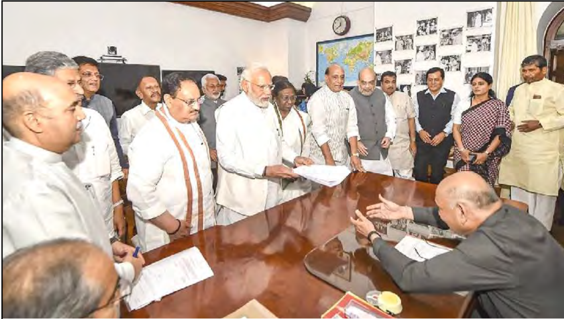
June 24, 2022 nü Parliament House, New Delhi nung NDA nungi Tir candidate, Droupadi Murmu-i nomination file asüdang tangokba noksa nung angur. Kasa noksa nung Ato kilonser, Narendra Modi den Union Minister tem- Rajnath Singh, Amit Shah, Nitin Gadkari aser BJP National Tir, J P Nadda nungera angur.

New Delhi, Aami/June 24 (Agencies): Hokolbarnü BJP-i aniba National Democratic Alliance (NDA) nungi Tir candidate, Droupadi Murmu-i nomination file süogo.