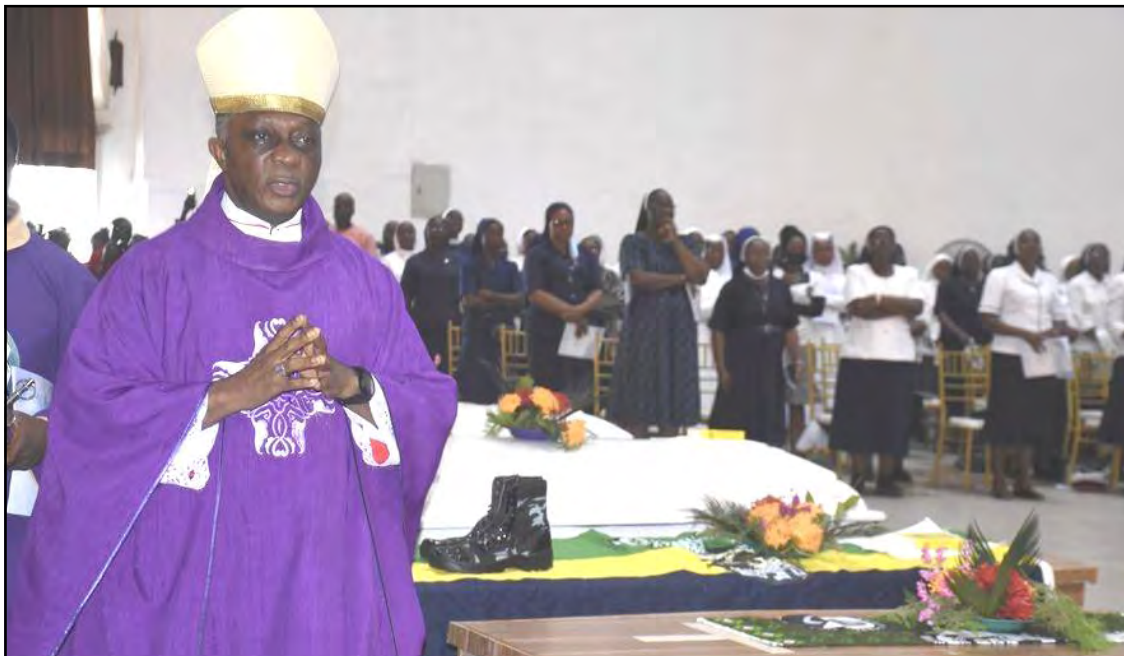
June 17, 2022 nü Nigeria kübok Owo jila nung aliba St. Francis Arago Tenla kidang tepsetba Khristantem atema asüpila sentong agidang tangokba noksa nung angur.