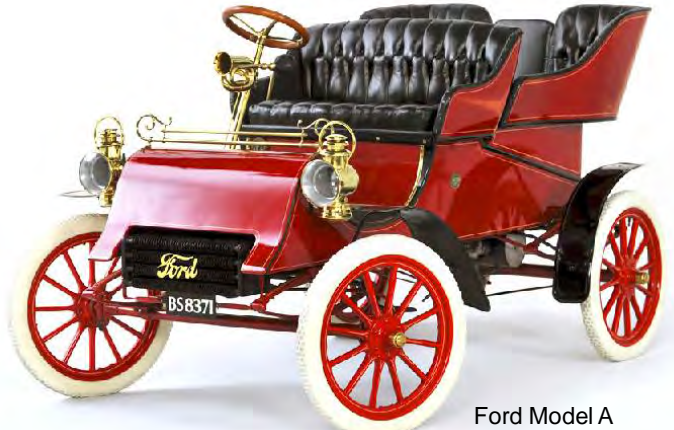
Ford Model A