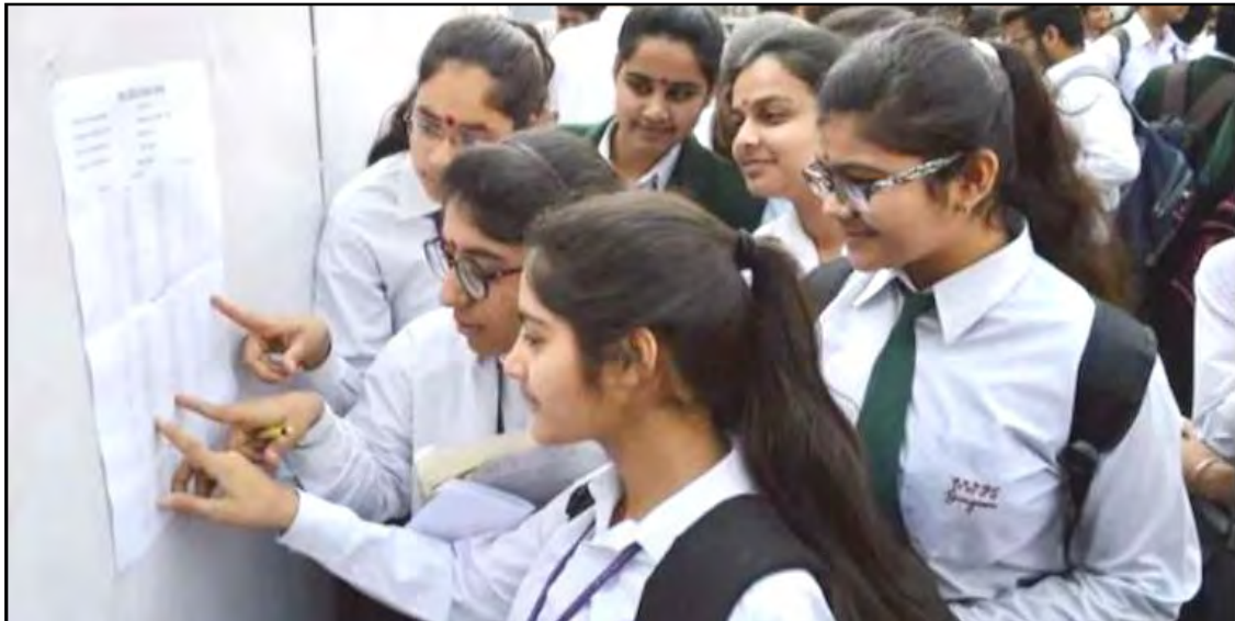
July 22, 2022 anepdang 10:00 ako nung Central Board of Secondary Education (CBSE)-i Class 12 final tatidang osang sangdongba sülen Class 12 nung azünger kaketshirtemi result reprangba noksa nung angur. Taküm Class 12 nung azünger shilem 92.71 aser Class 10 nung azünger shilem 94.40-i takok nguogo.

sülen iba Bill nung o lemtepa liasü. Antarctic region nung India-i research stations ana- Maitri aser Bharti amenoka lir, aser item stations nung scientist temi research agidar. Iba Bill ajanga temelaba magii mesüra Antarctic Treaty nung tanga party ka nungi tezüluba nung temelaba makai India nung Antarctic-i aotsü memelatsü. Iba ozüng kübok aibelenertem nem temerenshi agütsütsü. Iba bill kübok Antarctic region nung research agütsü aser rürjep continent wazüka ayutsü atema fund ka tentettsü.