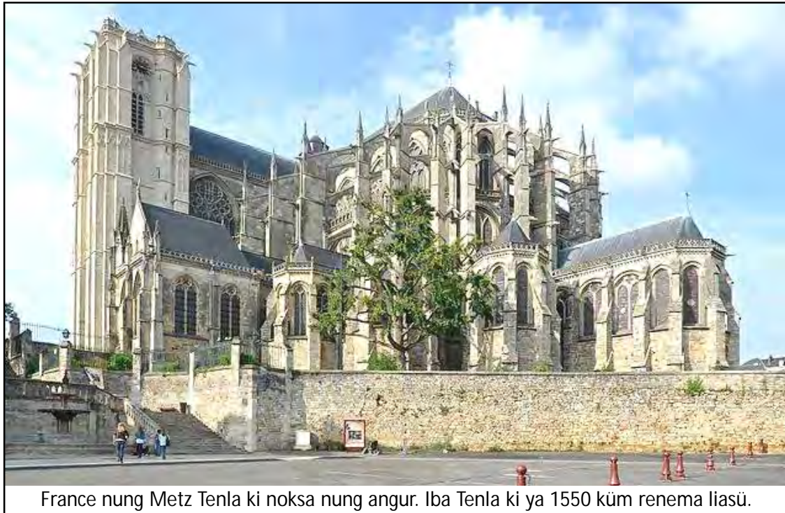
France nung Metz Tenla ki noksa nung angur. Iba Tenla ki ya 1550 küm renema liasü.

Paris, July 22 (Agencies): France nung MP aikati, akhidang asüba Tenla ki meyrjang aika anepalutsü atema sorkari senotsü teyari magütsüra item Tenla ki aika ayoktsüsa akümtsü mesüra bendoktsütsüa akok, ta metetdaksüogo.