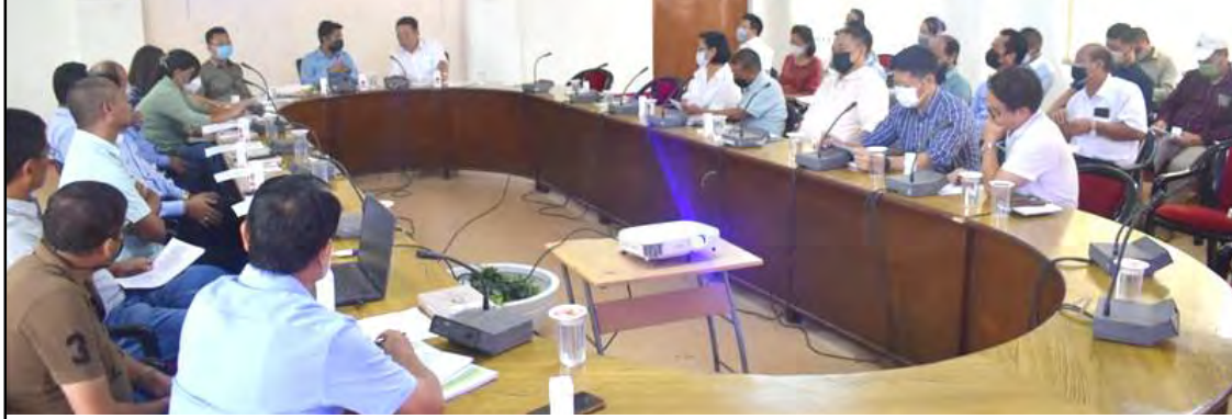
Deputy Commissioner, Dimapur indang Conference Hall nung July 22, 2022 nü Dimapur District Planning & Development Board senden alidang tangokba noksa ka yangi angur.

Dimapur, Chiteni/July 22 (TYO): Dimapur District Planning and Development Board züngsemtemi Dimapur district atema seed money lemzükja aliba nungi Truck Mounted Sweeping and Cleaner Machine alitsü pangjema liasü.