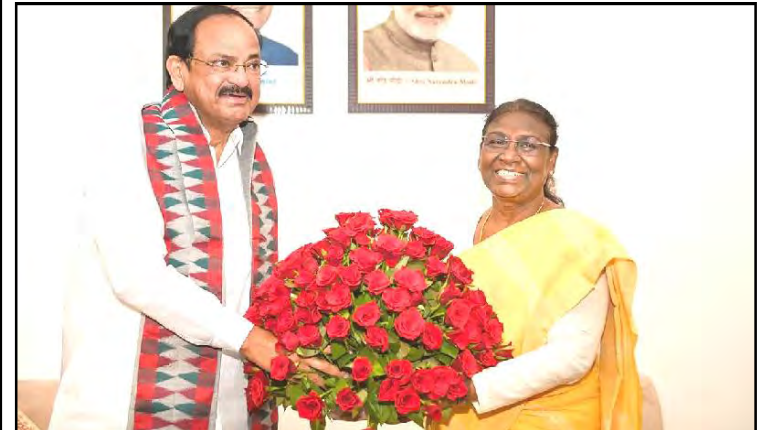
July 22, 2022 nü New Delhi nung linük tatong Tir, M. Venkaiah Naidu-i Tir election nung takok angula, Droupadi Murmu nem tenüngsang agütsüdang tangokba noksa nung angur.

New Delhi, Chiteni/July 22 (Agencies): Hombarnü (July 25) Droupadi Murmu-i Tir tenangzüka agütsü aliba dak sendakba nung Hokolbarnü Personnel Ministry-i Hombarnü sorkar office kar shibangtsü tuyuogo. Tenangzüka agiba sentong agiba mapang nung tang teyangludak Parliament building mapa-a anena atatsü tuyuogo. July 25 nü Parliament House Central Hall nung Tir tenangzüka agütsü, anungji July 25 anepdang 6:00 ako tashi nung office 30 azüngtettsür alitsü metetdaksü.