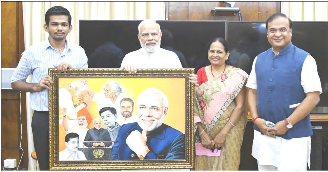
Assam kübok Silchar nungi differently-abled artist Abhijeet Gotani-i Prime Minister Narendra Modi den ajurutepa special portrait ka agütsüba angur. Iba portrait nung PM Modi tanur asüandang nungi pa Prime Minister akümba tashi noksatem dena lir. Abhijeet tetsü aser Assam Chief Minister Himanta Biswa Sarma na lia Abhijeet Gotani-i PM Modi nem sempetji agütsü.