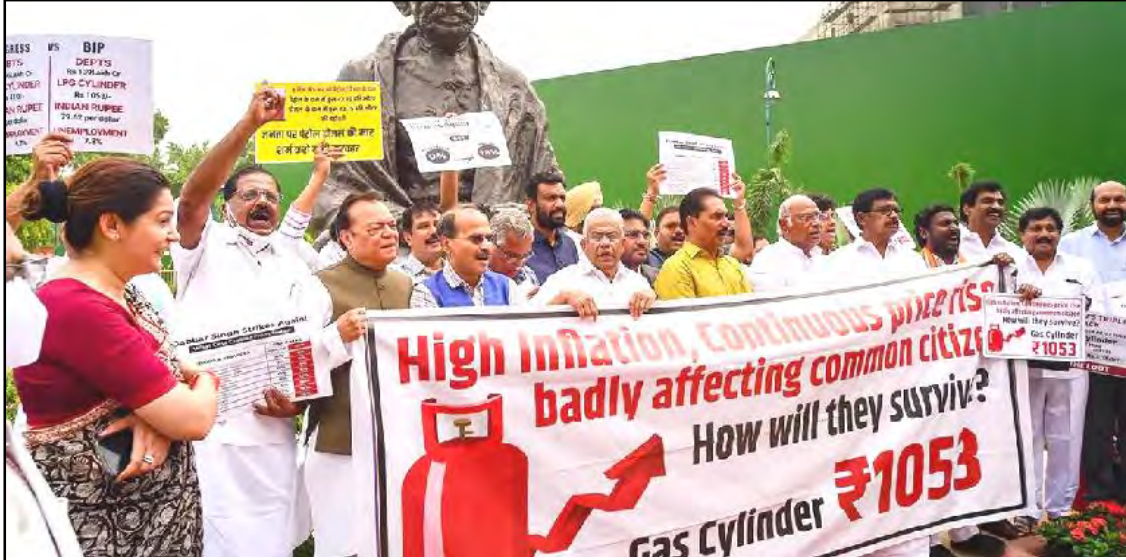
New Delhi, July 22, 2022: Chiyungtsü aika nung GST saru atuba anema opposition party balala nungi MP temi Parliament kima Mahatma Gandhi kürakyanglu anasa longkak aitdang tangokba noksa nung angur.

New Delhi, July 22 (Agencies): Hokolbarnüa Parliament nung Opposition party balala nungi lenirtemi tawa sorkari chiyungtsü balala nung Goods and Services Tax (GST) saru atuba anema longkak ait aser iba onük nung o lemteptsü atema takhangba agütsü. Opposition züngsemtemi linük nung osettsüset jenjang atuba anema Parliament House