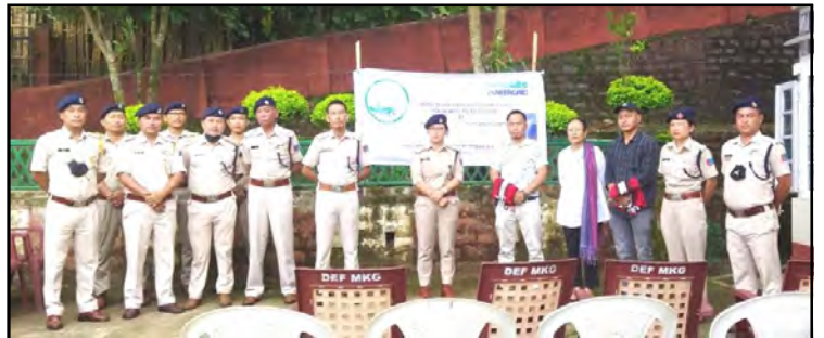
Power Grid Corporation of India Limited ajanga Mokokchung Police nem Solar Light 20 agütsüba sentong nung Mokokchung Police aser Power Grid Corporation of India Limited ketdangsürtem külemi tangokba noksa nung angur.

Mokokchung, Chiteni/July 22 (TYO): Power Grid Corporation of India Limited ajanga Mokokchung Police nem Solar Light 20 agütsüba sentong Mokokchung Police Station-1 nung July 22, 2022 nü agiogo.