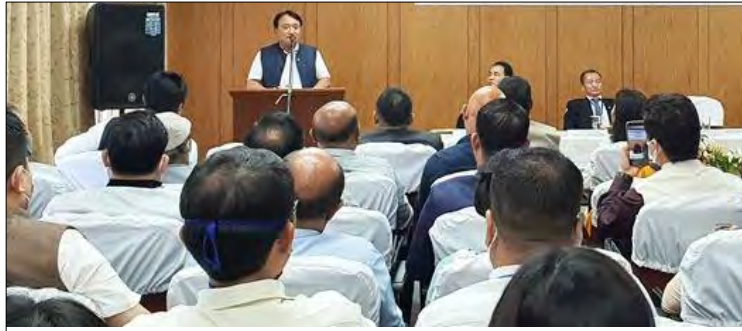
Kohima Hotel Japfu nung North East Engineers conference akaba mapang Minister Metsubo Jamir-i shilem agia jembiba noksa nung angur.

Kohima, July 22, 2022 (TYO): Engineer temi langka tasen ka purapitetsü mesüra yanglua aliba ka tajungba kümdakja loktiliba ajungtsü atema inyaker ta Rural Development Minister, Metsubo Jamir-i ashi.