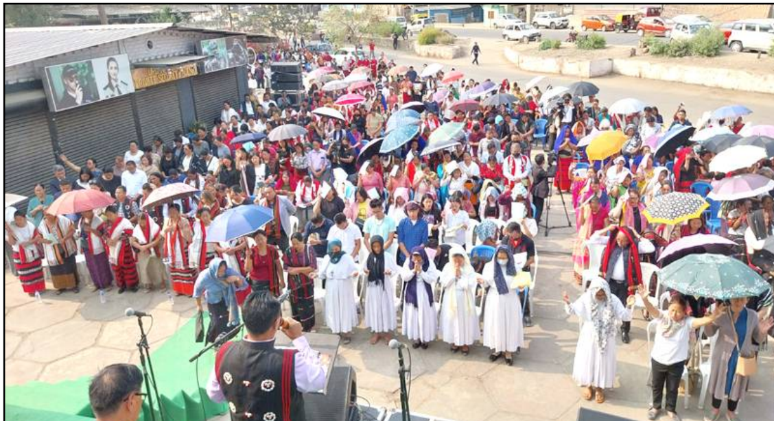
Dimapur, February 19, 2023: Nagaland Baptist Church Council (NBCC)-i Arogotem dang assembly election aser reshikangshiba Khristantem atema sarasademsü ayongzükba ama Amongnü Naga Shopping Arcade (Super market), Dimapur nung sarasadem rally agidang tangokba noksa nung angur. Iba sentong ya Nagaland Joint Christian Forum, Christian Forum Dimapur aser Nagaland Baptist Church Council senteper ayongzük.

Dimapur, Tsüklai/February 19 (TYO): Nagaland Baptist Church Council (NBCC)-i Arogotem dang assembly election aser reshikangshiba Khristantem atema sarasademsü ayongzükba ama Amongnü (February 19) Dimapur nunga Naga Shopping Arcade (Super market) nung sarasadem rally ka ayongzükba agiogo.