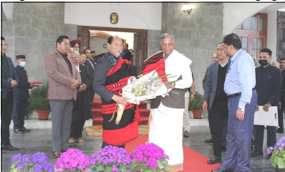
Chief Minister aser pa den külem tenzüker, Chief Secretary, DGP Nagaland, Home Commissioner aser ketdangsürtemi February 19, 2023 nü Raj Bhavan, Kohima nung Nagaland Governor inyaksü shimteta alisang La Ganesan agizüka liasü.

Dimapur, Tsüklai/February 19 (TYO): Nagaland asoshi Governor tasenba La Ganesan, February 19, 2023 nü Raj Bhavan, Kohima tonga aruogo. Pa arua atongba mapang yimsü nung aliba ama