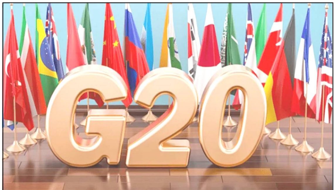
Shillong, April 13: Meghalaya Deputy Chief Minister Prestone Tynson-i Brehostibarnü ashiba agi, G20 senden atema renemshi tenzükogo, koba Shillong nung taruba hopta agitsü. April 17 aser 18 nü amentsü aliba G20 senden nung shilem agitsüpur nisung 120 shi agizüktsü atema state sorkar renema lir.

"Sen crore 70 intoka yangluba iba project yagi tang aser tarutsü nung consumer tem ajak indang nungdakba peritsütsü ta meteta kanga nema adanger," ta Teli-isa shisem.