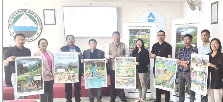
Department of Public Health and Engineering (PHED) ajanga Jal Jeevan Mission inyakym dak sendakba nung April 12, 2023 nü Social Behaviour Change Communication (SBCC) tools sayadang tangokba noksa ka yangi angur.

Kohima, Rongchii/April 13 (TYO): Jal Jeevan Mission (JJM) IEC inyakym asoshi Department of Public Health and Engineering (PHED) ajanga Social Behaviour Change Communication (SBCC) tools saya liasü.