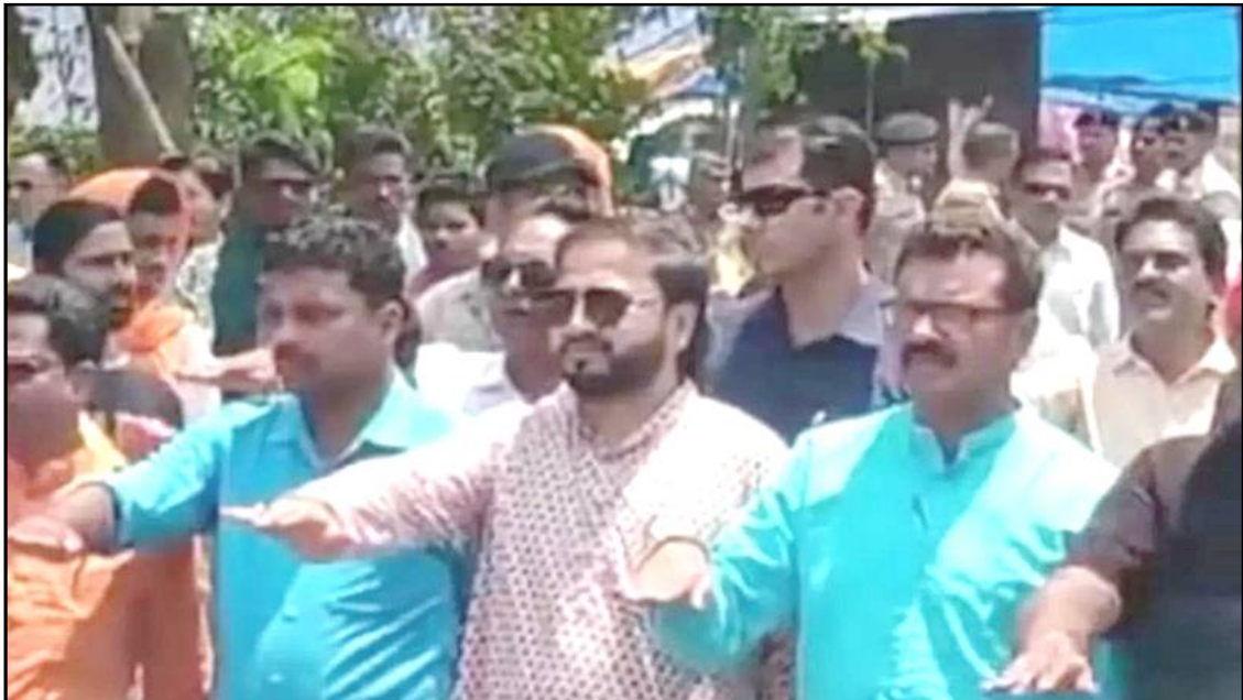
Chattisgarh state kübok Jagdalpur nung VHP züingsemtemi Muslim nung aser Khristantem den shishilemba masütsü tenangzükba agidang tangokba noksa nung angur.