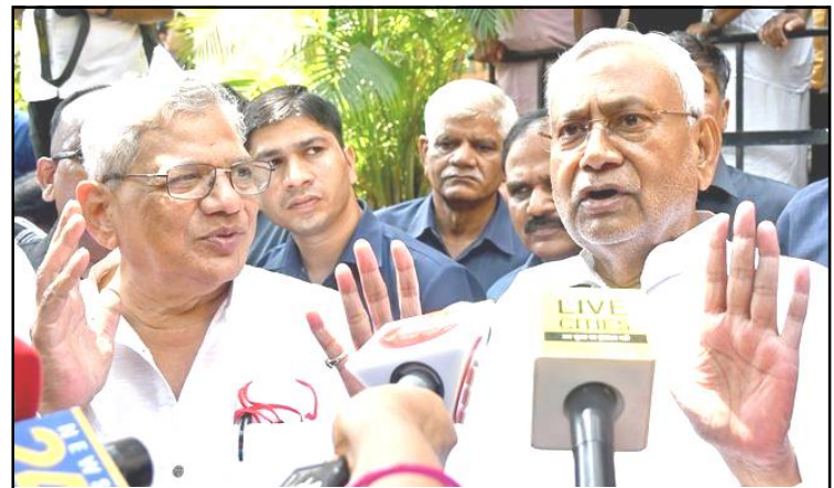
New Delhi, April 13, 2023: Brihostibarnü New Delhi nung CPI(M) general secretary, Sitaram Yechury aser Bihar Chief Minister, Nitish Kumar na ajurua senden amenba sülen tenati osangbenertem den jembidang tangokba noksa nung angur.

2019 küm August 5 nü Jammu & Kashmir nung Arlla 370 agiena state jenjang agienadok aser Union territories ana- Jammu & Kashmir aser Ladakh kümja liasü.