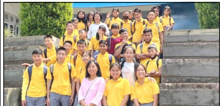
Nagaland Education Project - The Lighthouse - Nagaland Enhancing Classroom Teaching and Resources (NECTAR) sentong kübok shilem ka ama, Govt. Middle School, Salangtem kaketshirtemi April 12 nü Marepkong Ward, Mokokchung nung aliba Industrial Training Institute semdangba mapang tangokba noksa nung angur. Mokokchung, 13th April, 2023

Paisa, teka amoka inyakba department tem dang masü saka sorkar aser nüburtemi iba inyakyim nung shilem tajung agütsü kanga tongtibang lir ta ashi.