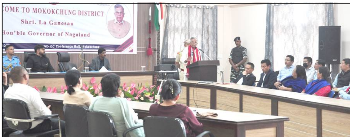
April 13 nü Mokokchung semdangba mapang Nagaland Angh La Ganesan aser sorkar tenzükertem aser lokti tentet balala lenirtem DCs Conference Hall nung senden amenba mapang tangokba noksa nung angur.

Dimapur, Rongchii/April 13 (TYO): Nagaland Angh La Ganesan-i April 13 nü Mokokchung semdanga office balala tekolaktem aser district kübok lokti tentet balala nungi lenirtem den senden ka mena liasü.