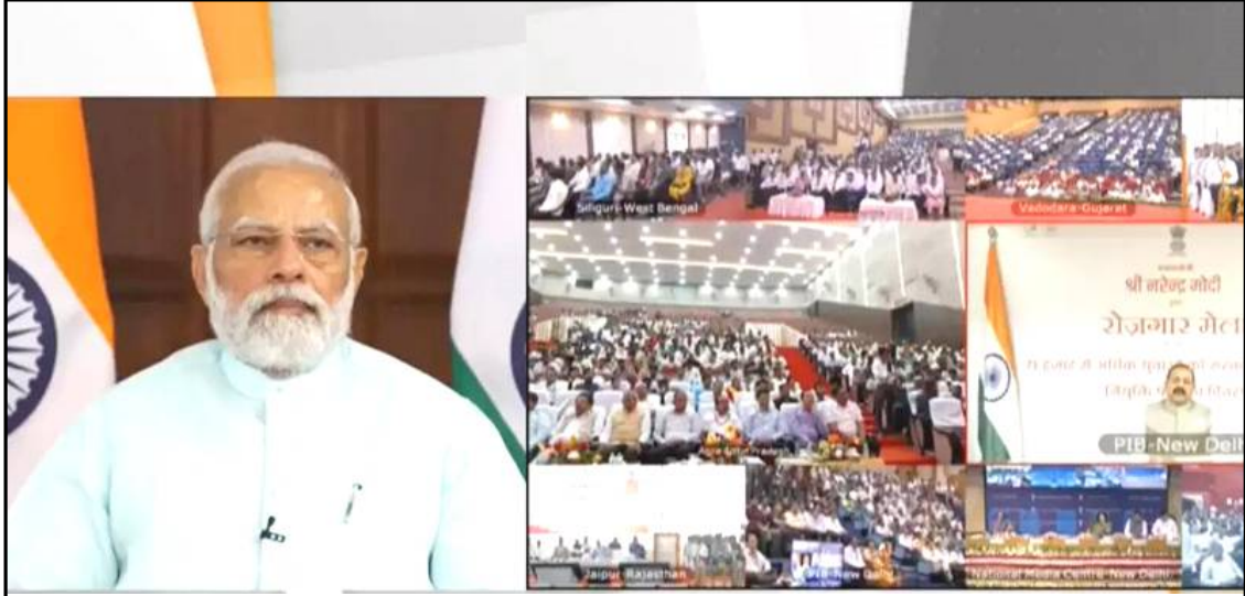
April 13, 2023 nü Ato kilonser, Narendra Modi-i video conferencing ajanga Rashtriya Rozgar Mela sentong nung adenba noksa nung angur. Brihostibarnü pai nisung 71,000 nem appointment letters agütsüba sülen o jembia liasü.

Chhattisgarh Chief Minister, Baghel-i iba tatalokba aitsüogo aser iba tatalokba dak sendakba nung police-i tang tashi nung nisung ti puogo.