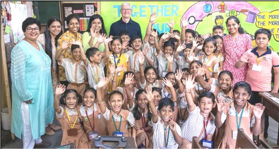
April 19, 2023 nü Apple CEO, Tim Cook-i Mumbai nung Akanksha Foundation school ka semdangba mapang kaketshirtem aser tesayurtem den külemi tangokba noksa nung angur.