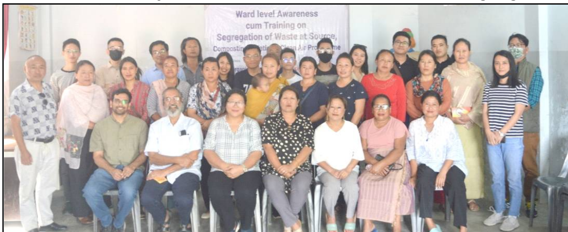
NCS (Probationers) 2023 Batch den CPR, New Delhi nungi shisalen sayur aser KMC ketdangsürtem April 19, 2023 nü Sepfuzou Ward, Kohima nung Solid Waste indang data bendenba exercise agidang tangokba noksa nung angur.

Dimapur, Rongchii/April 19 (TYO): Department of Personnel and Administrative Reforms, Government of Nagaland ajanga sponsor süa April 11, 2023 nü nungi tenzüka hopta trok atema NCS (Probationers) 2023 Batch asoshi Special Induction Training ka Administrative Training Institute nung Centre for Policy Research, New Delhi ajanga agütsür.