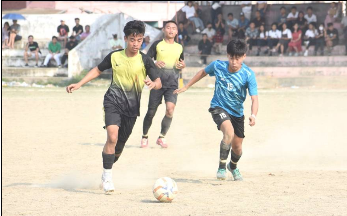
4 Buba Mokochung Inter Ward Football Tournament tanabuba Semi Final Artang Ward aser Sangtemla Ward tsüngda asayadang tangokba noksa.

Mokokchung, Rongchii/April 19 (TYO) : Tanu Imkongmeren Sports Complex Mokokchung nung 4 Buba Mokochung Inter Ward Football Tournament tanabuba Semi Final Artang Ward aser Sangtemla Ward tsüngda asayaba nung Sangtemla Ward-i goal 2-1 agi Artang Ward kokteta Final asayatsü jenjang ngutetogo.