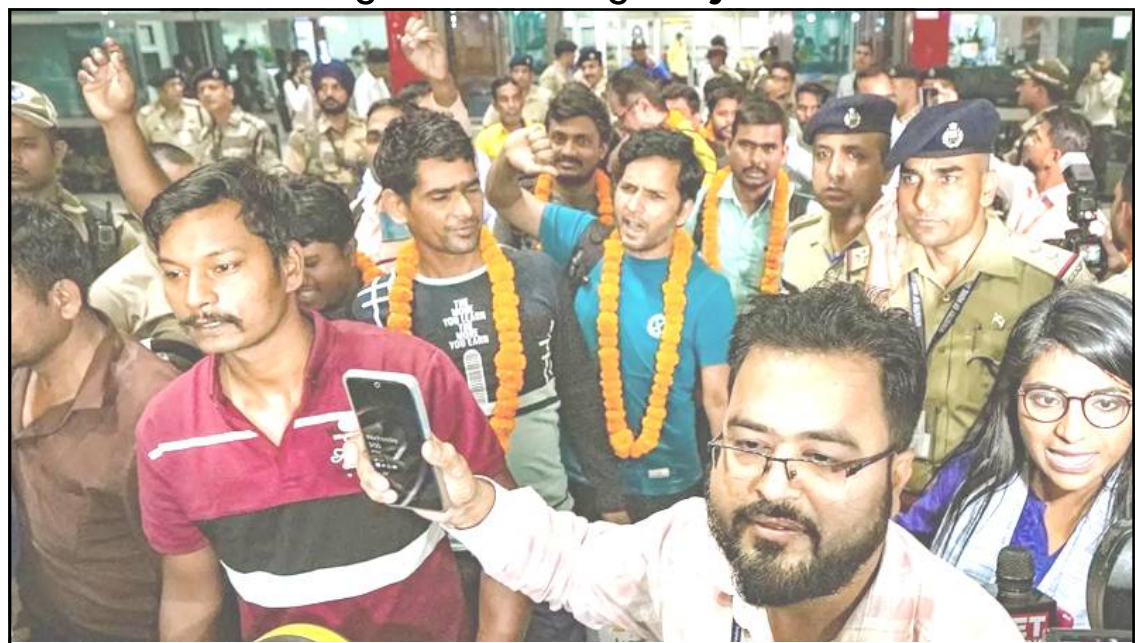
New Delhi, April 27, 2023: 'Operation Kaveri' kübok tang rara adoka aliba Sudan linük nungi India nunger sensotem tayimtsü ajanga New Delhi nung aliba IGI Airport tonga anir aruba sülen tangokba noksa nung angur.

New Delhi, April 27 (Agencies): Brihostibarnü Foreign Secretary, Vinay Mohan Kwatra-i, rara aliba Sudan linük nung India nunger ka danga anungzuka meyutsütsü, ta metetdaksü.