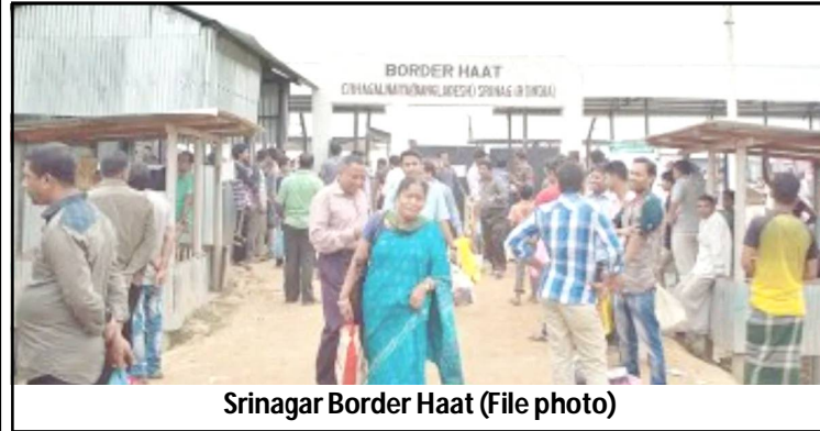
Srinagar Border Haat (File photo)

Agartala, Rongchii/April 27 (Agencies): Tripura kübok Srinagar district nung amenoka aliba Border Haat May 9 nü lapokshitsü. Iba haat ya Covid-19 wara poktetba ajanga küm ana tashi shibanger liasü.