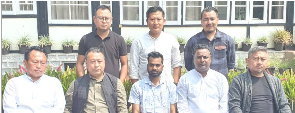
NMOPS aser CANSSEA ketdangsür temi Kohima nung April 27, 2023 nü osangbener den jembidang tangokba noksa ka yangi angur. (Kohima, April 27, 2023)

Kohima, Rongchii/April 27 (TYO): Mapang talangka nungi Old Pension Scheme (OPS) dangi meyiptsü khanga aruba joko matatsü, ta New Pension Scheme (NPS) kübok Central aser State sorkar mapa inyaker temi Brehostibarnü ashi.