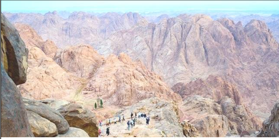
Tsüngremi lungpak ana nung Mosa nem ozüing ter metetdaksüba tesem- Sinai tenem noksa nung angur. Mosa ozüing ter indang ya Laishiba nung Anitet kaket nung shia lir.