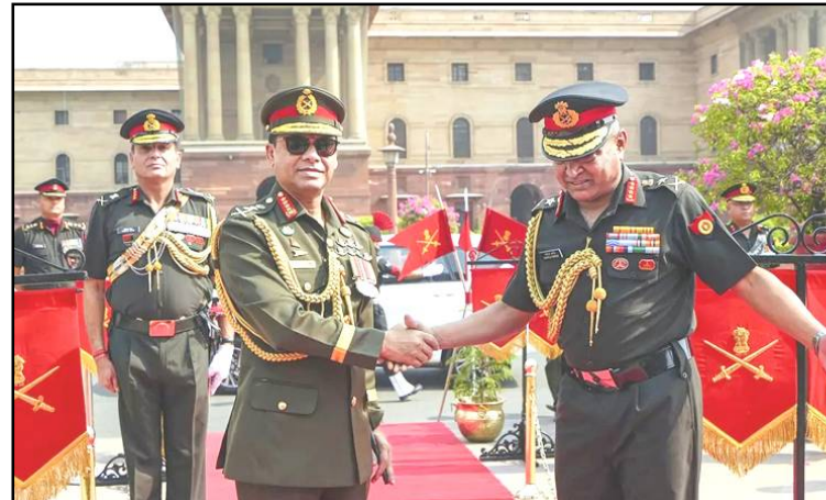
April 27, 2023 nü New Delhi nung Chief of Army Staff General, Manoj Pande-i Bangladesh Army Chief, General SM Shafiuddin Ahmed agizükdang tangokba noksa nung angur.

"Centre nungi Union health secretary leniba nung Empowered Committee aser state tem nung principal secretary, health/medical education-i ketdangsüa iba maparen inyaksü. States/UTs-i mapang shia Union ministry nem iba scheme kübok inyakba maparen osang metetdaksütsü," ta parnokisa metetdaksü.