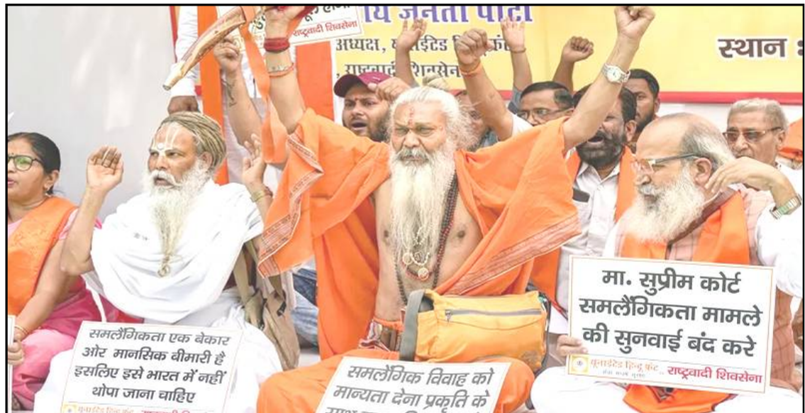
April 27, 2023 nü Jantar Mantar, New Delhi nung United Hindu Front nungi züngsemtemi kasa kiyimba anema longkak aيتدang tangokba noksa nung angur.

Karnataka nung assembly election May 10 nü agitsü aser May 13 nü vote azüngtsü.