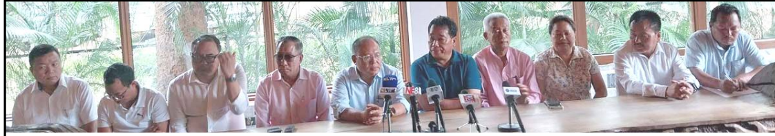
June 9, 2023 nü Niathu Resort, Chumukedima nung Manipur nungi Naga nunger MLA 10-i osangbener den jembidang agiba noksa ka angur.

Dimapur, June 9, 2023 (TYO): Manipur nung Kuki-Meitei ketdangsübaren balaka akümtsüsa kümra iba nung Naga nunger tesemtem nung mekongshitsüla ta Manipur nungi Naga MLA 10-i metetdaksü.