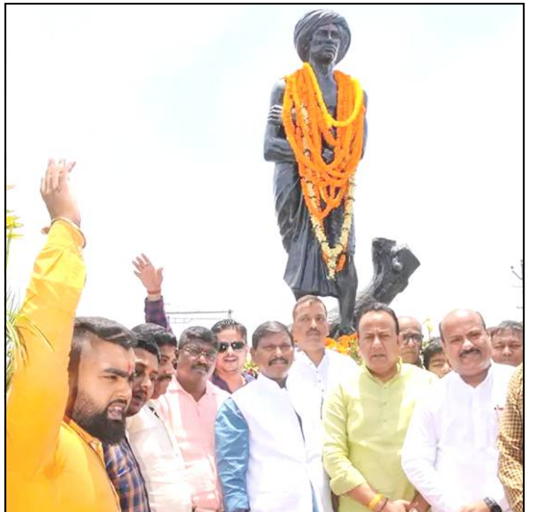
Ranchi, June 09, 2023: Linük nüchiso atema rarar, Birsa Munda asüba anogomong nung Ranchi nung Union Tribal Affairs Minister, Arjun Munda-i asür nem akhüm agütsüba sülen tangokba noksa nung angur.

nisungtemjia kobi melii diabetes agi shirangtsü," ta Dr Anjana-ashi. "Madhya Pradesh nung diabetes agi shiranger ka lira pre-diabetes keta alirbo nisung asem lir, ano Sikkim nungbo diabetes agi shirangertem aser pre-diabetes keta alir naprong aika lir. Item kuli ya bushisüingdangtsü nungdak," ta lai ashi. "Pre-diabetic nisung kaji normal blood sugar level dang nungi tera temaba lir saka 'type-2 diabetes' ta züingshitsüsa kanga 'high' bo masü. Taküm libaluru memelenshira pre-diabetes keta alir tanur-tain aika diabetes agi shirangtsü. Pre-diabetes keta alir nisung asem shia nungi nisung kabo küm ishika tsüingda diabetes agi shirangtsü aser pre-diabetic nisung asem shia nungi nisung kabo pre-diabetic dang alitsü," ta senior diabetologist Dr V Mohan-i metetdaksü. ICMR-i iba study atema October 18, 2008 nungi December 17, 2020 tashi nung yimtsüing aser jilattem naprongla nungi nisung lakh 1 dak tema tendanga liasü.