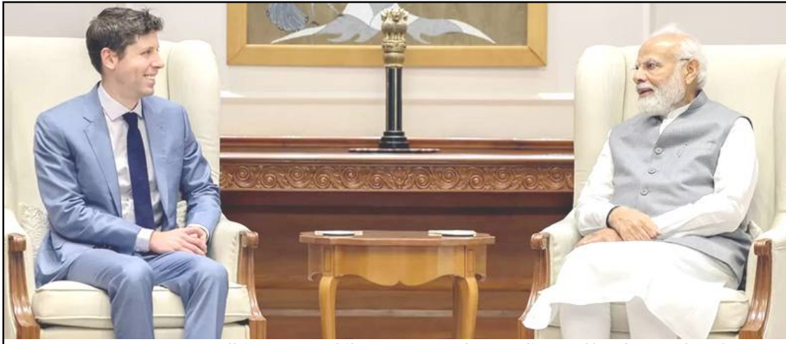
June 09, 2023 nü New Delhi nung Ato kilonser Narendra Modi aser ChatGPT maker OpenAI CEO, Sam Altman na senden amendang tangokba noksa nung angur.

Pune, Aami/June 09 (Agencies): Nisung kari socail media ajanga Nationalist Congress Party Tir, Sharad Pawar amokmerenba sülen Maharashtra nung Eknath Shinde-i aniba sorkari pa nem security agütsüogo. Hokolbar nü osangbenertem den jembidang pai, amokmeren ajanga nisung ka ola nembangtsütetsü ta nisung kari bilemra nisungba tangatetbaji tai, ta ashi. Pawar-isa, pai Maharashtra police dak tamang akar, ta metetdaksü. "Linük nung onük balala nung pei tebilemra lemsateptsü atema senso ajak dak temeden lir. Ajisüaka nisung kari, amokmeren ajanga nisung kar ola nembangtsütetsü ta bilemra iba tangatetbaji tai," ta pai ashi. Nisung kari social media ajanga arrshi küm 82 NCP Tir, Pawar amokmerena "Kobi melii nai-a (Narendra) Dabholkar-i ajuruba kasa tia ajurutsü" ta metetdakja liasü. 2013 küm August 20 nü Pune nung Narendra Dabholkar anepdang senzua lia motorbike nung nisung ana arur pa dak injang khalokja khaseta liasü. Pawar-i, "Ni police dak tamang akar; state nung tzüzüing ozüing benoktsü aser tensa azüoktsü atema parnok nem mapa nunglokja lir, ibayongji ni shisa mebular," ta ashi.