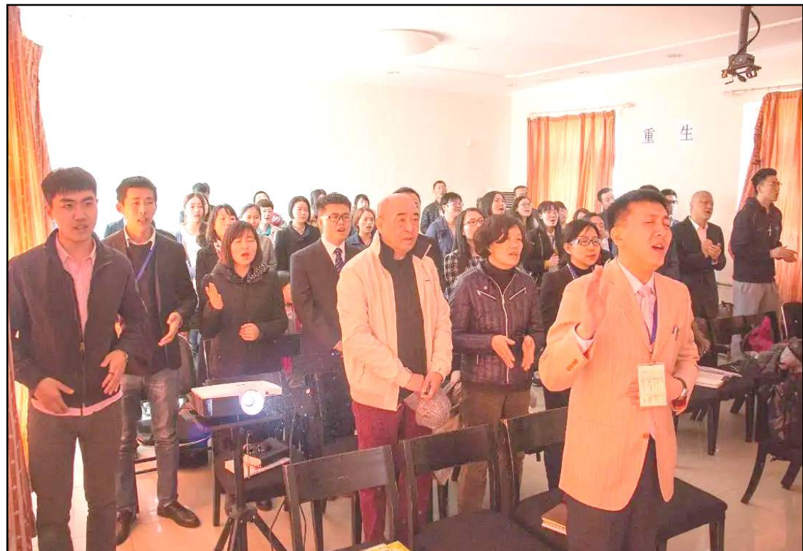
Beijing kübok Shunyi nung aliba underground Arogo ka nung Khristantem tekülem sentong agidang tangokba noksa nung angur.

Linük rongsenkettzüng tsütsü timtem nungi kümzüksü atema sorkari March ita nung International Monetary Fund (IMF) nungi dollar sen billion 2.9 loan nguogo, ta shia Ranjith-i, "Mezüngbo sorkari electiona gitsü atema sen mali ta jembir, aser tangbo sen lir ta jembir. Sorkar ket nung sen lira nüburtem taginüba metettsü atema nüburtem nem mesüngjem tashi local elections ayongzükanag," ta paisa metetdaksü.