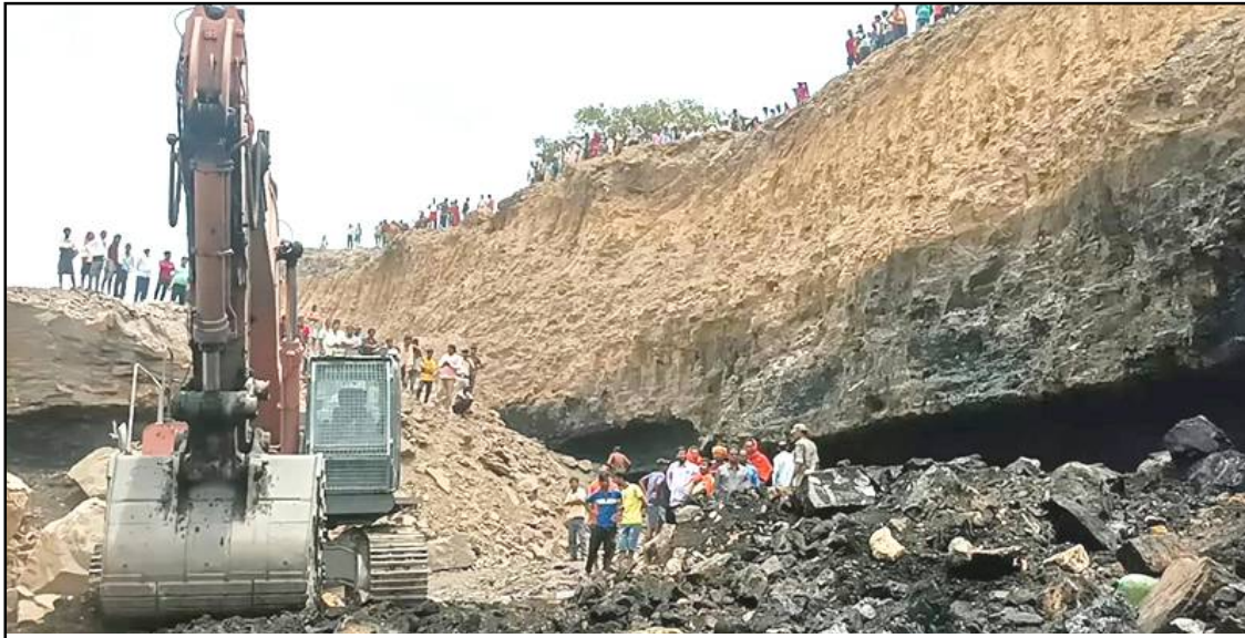
June 09, 2023 nü Jharkhand kübok Bhowra colliery area nung ozüing alema koila atuba ongken ka chirepba sülen kümzükba maparen inyakdang tangokba noksa nung angur. Iba lendong nug nisung asem asü aser aika telung nungji lir ta bilemer.

Ranchi, June 09 (Agencies): Hokolbar anepdang Jharkhand state kübok Bhowra colliery area nung ozüing alema koila atuba ongken chirepba lendong nung tang tashi nung nisung asem asüba jangjaogo aser ano aika ali agi anebanga lir ta bilemer. Hokolbar nep 10:30 ako meta Bharat Coking Coal Limited (BCCL) indang Bhowra Colliery Area nung