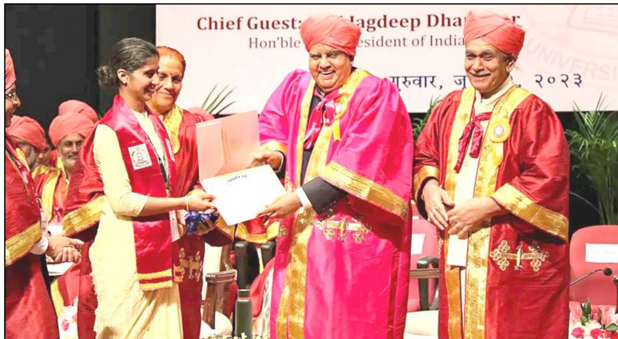
June 22, 2023 nü General Zorawar Singh Auditorium, Jammu nung University of Jammu convocation sentong nung linük tatong Tir, Jagdeep Dhankhar-i kaketshir ka nem degree agütsüdag tangokba noksa nung angur. Kasa noksa nung Jammu & Kashmir Lt Governor, Manoj Sinha-a angur.

May 29 nungi anogo pezü tashi Amit Shah-i Manipur semdanga relief camps nung jenoka alir Meitei aser Kuki nunger naprongla ajurua liasü.