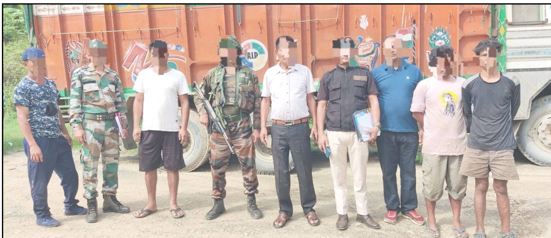
Assam Rifles temi June 4, 2023 nü Chakabama kübük Jessami-Chakabama lenmang nung sen crore 4.80 jenjang Areca Nuts (kozü) ton 40 shi aser sen lakh 75 shi jenjang Burma teak ton 60 shi pua liasü. Item oset ya Jessami nungi Dimapur leni truck pezü nung bener aodang apu.

Department ajanga Science Stream agütsüba college aser school ajunga dang iba sentong nung shilem agitsü aser kaketshirtem yoktsü ayongzükba, ta sangdong ajangasa ashi.