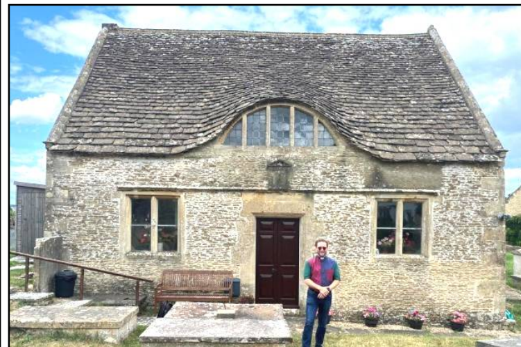
England nung Wiltshire kübok Monks Chapel Arogo Tenla ki noksa nung angur.