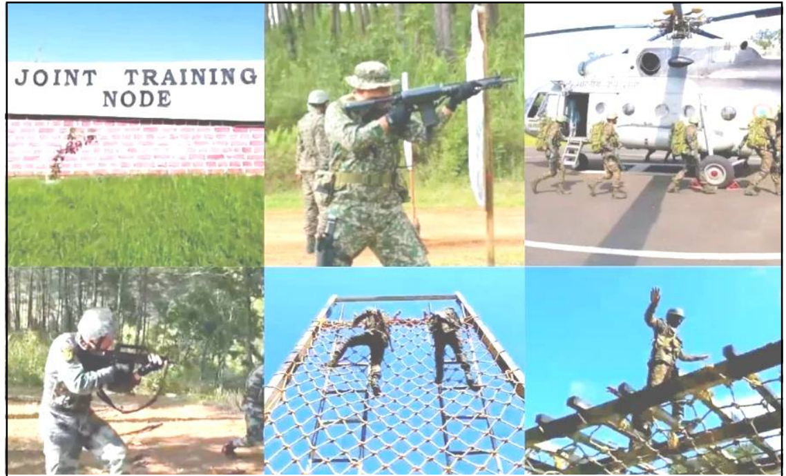
November aser December ita Meghalaya kübok Umroi nung United States aser Myanmar Army-i Indian Army den joint military exercises agitsü. Iba sentong ya Joint Training Node (JTN) nung agitsü aser Malaysian Army-ia tawa tu iba mesükba exercise ka agiogo. Umroi JTN ya Indian Army nung Eastern Command indang nominated node lir aser ib tesem nung bendanger linüktem den joint exercises agia arur. Tesüiba küm 7 tsüngda Umroi JTN ya international Army joint training centre ka kümogo.