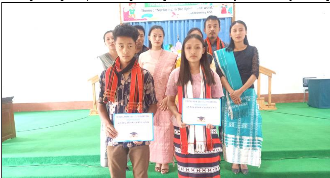
November 5, 2023 nü Tening Village Baptist Arogo nung World Sunday school day anogomong nung graduate asür ana den Sunday school tesayurtem tangokba noksa nung angur.

Dimapur, November 05 (TYO): Nagaland aser alima tesem balala nung Arogotem den külemi November 5 nü Tening Village Baptist Arogo nunga World Sunday school day mongogo, ta Rutmakbo Media cell Tening Village Baptist Church-i sangdong ka ajanga metetdaksü.