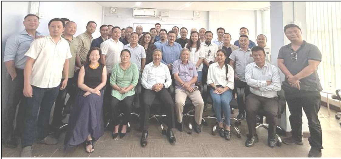
Business Association of Nagas (BAN) pur ketdangpur tasen shimba sentong nung tangokba noksa angur.

Dimapur, Yimpoksüi/Nov. 05 (TYO): Business Association of Nagas (BAN) pur ketdangpur tasen shima November 4, 2023 nü BAN Conference Hall, DC Court Junction, Dimapur nung tenangzüktep agia alizüing tasen ka tongteta liasü.