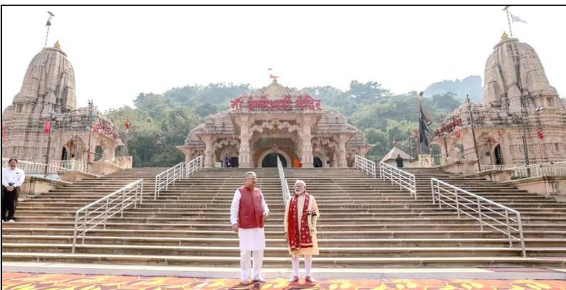
November 05, 2023 nü Ato kilonser, Narendra Modi-i Dongargarh (Chhattisgarh) nung Chhoti Bamleshwari tekülem ki semdangba mapang tangokba noksa nung angur.

Assembly menden 90 aliba state nung election shilem ana lemsar agitsü; November 7 nü assembly menden 20 aser November 17 nü menden 70 atema election agitsü.