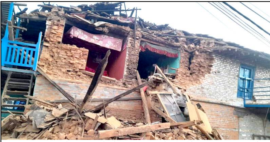
Nov. 05, 2023 : Nepal nung menoknok ajanga ano teraksa jenti bener arutsüogo. Honibar aonung menoknok asadangba magnitude 6.4 anoka Nepal nung nisung 157 takum samaba sülen yimdaklir meyrirjang aika sükseta aonung kima mejanga liasü.