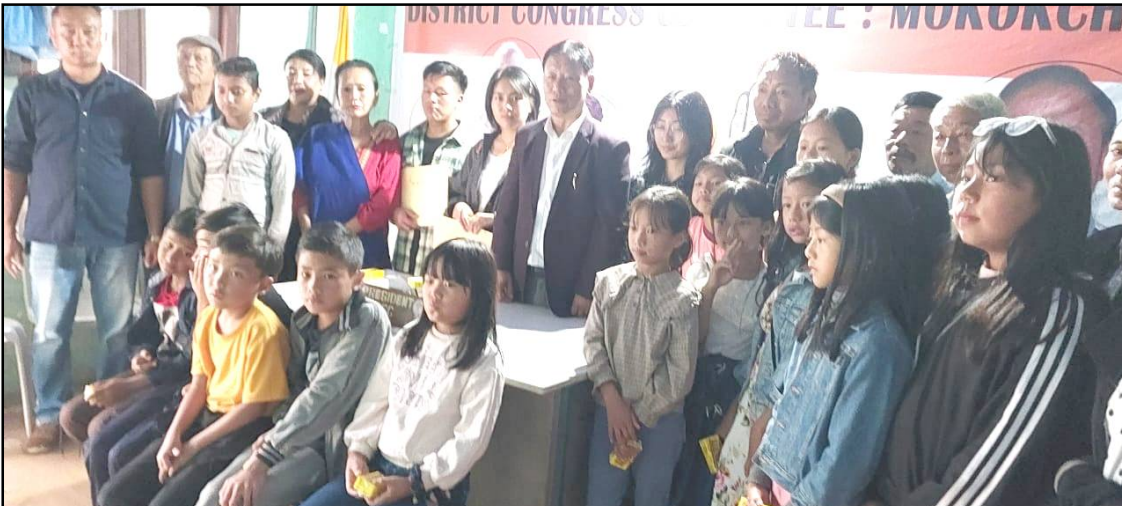
"Jawahar Baal Maanch" (Jawahar Children Platform) kübok class 10 tashi azüngertem atema painting tetoktepba ka Nov 3 nü liasü aser iba tetoktepba nung takoker nem District Congress Committee, Mokokchung ajanga tenüngsang agütsüba sentong ka ayongzüka liogo. Iba ya district level sentong ka lir aser yangi takoker angurtemi state level aser national level nung shilem agitsü. National level sentongji taküm küm tatemlen akatsü aser iba nung takoker nem senpet sen lakh ka agütsütsü, ta DCC, Mokokchung osang ka ajanga metetdaksü. Mokokchung, 5th November, 2023

Advisor-isa department telungzük nung temelenshi bener arutsü asoshi bendanga agütsür inyakba lemsatep aser iba atema stakeholders ajungai yaritsü tongtipang lir ta ashi.