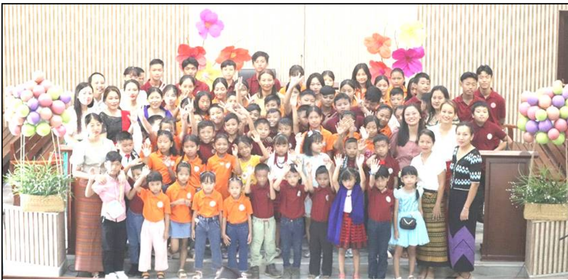
November 5, 2023 nü Nükmen Baptist Arogo, Darogapathar, Dimapur nung World Sunday School Day amongba sülen tesayurtem aser Sunday School tanurtem tangokba noksa nung angur.