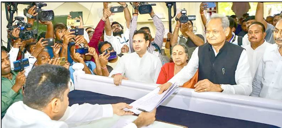
Rajasthan Chief Minister Ashok Gehlot-i taruba Rajasthan Assembly election atema Sardarpura constituency nungi Jodhpur nung nomination papers file asüba noksa nung angur.

Rajasthan nung election November 25 nü agitsü aser result December 3 nü sangdongtsü.