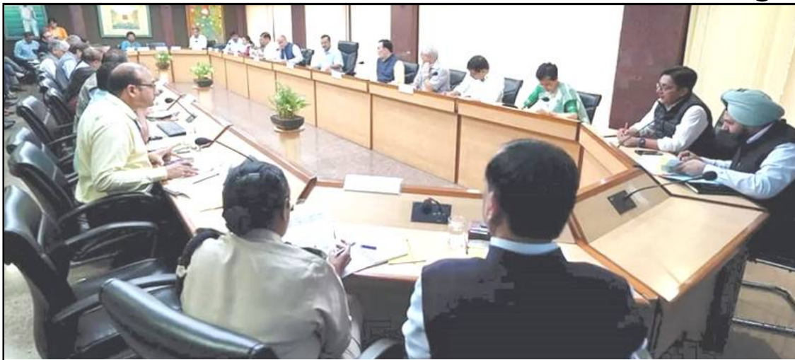
Linük yimtiba nung mopung kanga menena akümba ken o sensaksemtsü asoshi Delhi Chief Minister Arvind Kejriwal lenisüba nung senden ka amenba mapang tangokba noksa nung angur. Delhi Ministers Gopal Rai, Kailash Gahlot, Atishi Singh aser Saurabh Bhardwaj nungera noksa nung angur.

New Delhi, Yimpoksüi/ November 6 (Agencies): Delhi nung mopung kanga mejungu akümba mapang ka nung Delhi sorkari school tem dang class 10 aser 12 dak alaker November 10 nü tashi physical classes magitsü tetuyuba agütsüogo aser November 13 nungi 20 tashi odd-even scheme tanaben benokogo.