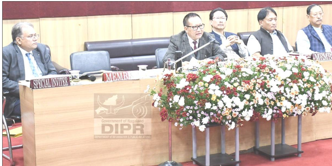
November 6, 2023 nü Capital Convention Centre nung Select Committee to Examine the Nagaland Municipal (Bill) 2023 züngsemtemi osangbener den jembidang agiba noksa angur.

Thorang (ST) Assembly constituency kübok Thelep polling station nungbo voters 26 dang lir ta parnokisa ashi.