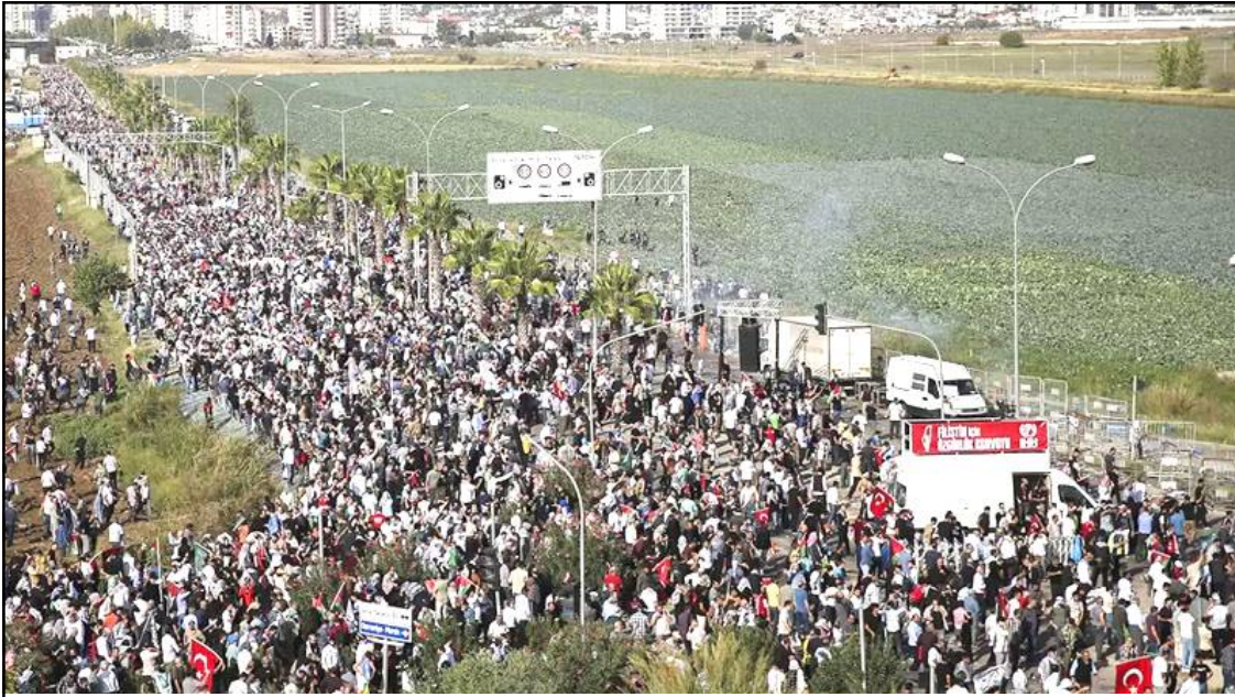
Palestine nunger dang temeim sayua Adana, southern Turkey nung aliba U.S. - Turkish Incirlik military air base tezülen longkak aita nūburtem adenshiba noksa nung angur. Deobarnū iba tesem nung Palestine nunger bhukuma adenshia alir nisung meyrirjang aika dak police temi tear gas aser water cannon khaloktsū.