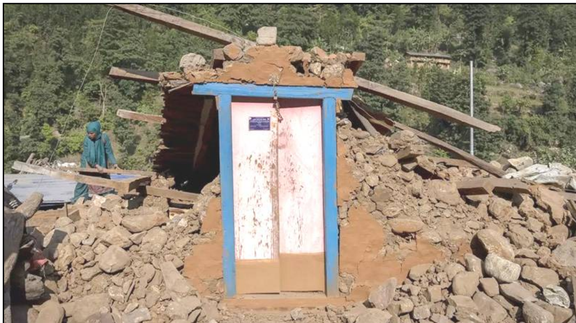
Nepal northwest tsütsü Rukum District nung menoknok agi raksatsür aliba ki ka nungi nisung kati jana indoka oset bendenba noksa nung angur. Hokulbar aonung Nepal northwest tsütsü menoknok tesashi anoka nisung 150 dak tema asü aser nisung meyrirjang aika talidak ki makai akum.

Russia telungzük nung Putin indang approval ratings ya shilem 80 lir. Russia nunger osangkaket Kommersant nunga Putin-i election nung tokteptsü ta taoba ita sangdonga liasü.