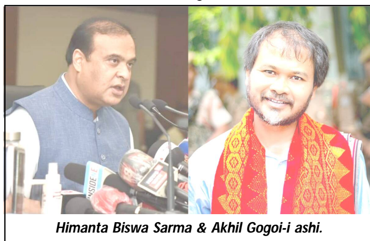
Himanta Biswa Sarma & Akhil Gogoi-i ashi.