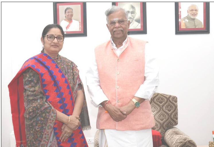
Minister of State for Education, Government of India, Annpurna Devi-i Nagaland semdangba mapang November 8, 2023 nu Raj Bhavan, Kohima nung Nagaland Angh La Ganesan den ajurutepa liasü.

VOL. XXI NO. 32 (ADOK 32) DIMAPUR YANGTEPNÜ (THURSDAY) YIMPOKSÜI (NOVEMBER) 09, 2023 ₹ 5.00