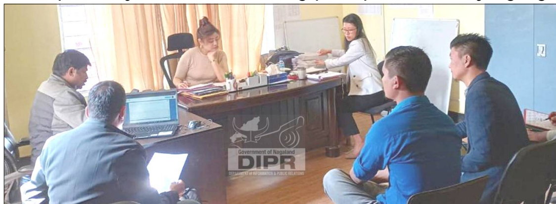
General Observer MG Rajamanickam IAS, Returning Officer of 43 Tapi AC Rongsenmenla SDO (C) aser ARO Tshelhi - u EAC nunger den candidate tem indang teshimtet nisungtem lia November 8, 2023 nu 43 Tapi Assembly Constituency nung bye-election agiba indang post poll scrutiny mapareninyakba noksa angur.

Dimapur, Yimpoksüi/Nov. 08 (TYO): 43 Tapi Assembly Constituency nung bye-election agiba indang post poll scrutiny maparen General Observer MG Rajamanickam IAS, Returning Officer of 43 Tapi AC Rongsenmenla SDO (C) aser ARO Tshelhi - u EAC nunger den candidate tem indang teshimtet