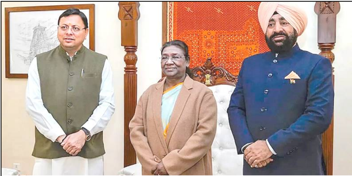
November 08, 2023 nù Raj Bhavan, Dehradun nung linük Tir, Droupadi Murmu-i Uttarakhand Angh, Lt General Gurmit Singh aser Chief Minister Pushkar Singh Dhami na ajurudang tangokba noksa nung angur.