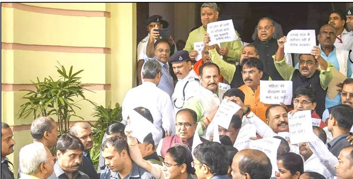
Patna, November 08, 2023: Bihar Chief Minister, Nitish Kumar-i Assembly nung jembidang, nütsüng arenba azüoktsü atema tetsürtemi shisaliok nungdaker, ta jembiba anema BJP MLA temi State Assembly kima longkak aitba noksa nung angur.

Ato kilonserisa, pai maneni ochimashi anema raratsü, ta shia lokti dang, nenoki yamaji inyakdaksüner asü meinyakdaksüner?, ta asüngdanga liasü.