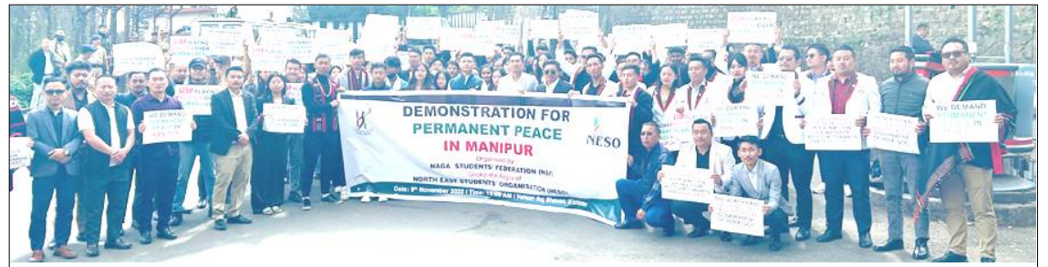
Manipur nung teti asoshi yimjung khanga North East Students' Organisation (NESO) kübok Naga Students' Federation (NSF) ajanga November 9, 2023 nü Kohima nung Raj Bhavan kima sentong ka ayongzüka agidang tangokba noksa ka yangi angur.