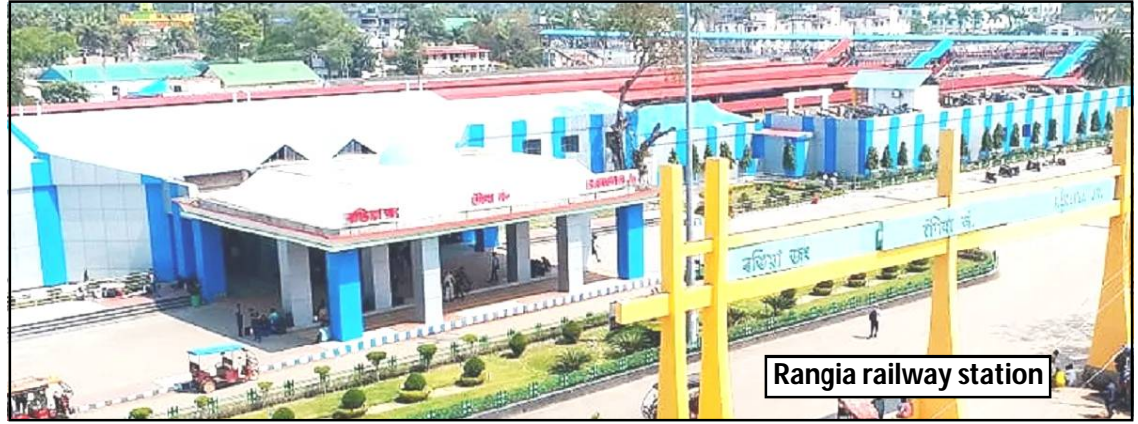
Rangia railway station

Guwahati, Yimpoksüi/ November 9 (Agencies): Assam nung railway station ana nem "Eat Right Station" certification agütsüogo. Passenger tem nem jenjang aketba chiyongtsü tajung agütsüba atema iba certificate agütsüogo.