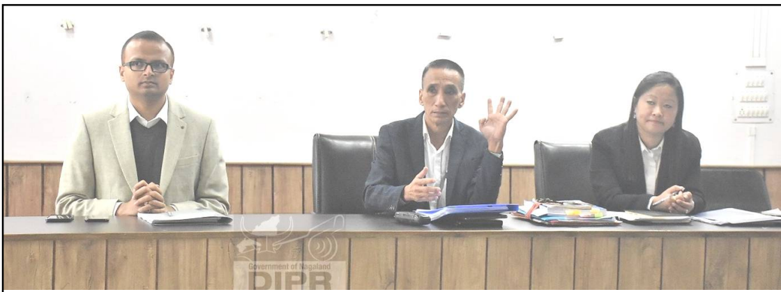
November 9 nü Commissioner & Secretary aser Kohima district E-Roll Observer K. Libanthung Lotha, IAS-i ayongzüka DC Conference Hall, Kohima nung senden aliba mapang tangolba noksa angur.

Dimapur, Yimpoksüi/ November 9 (TYO): November 9 nü Commissioner & Secretary aser Kohima district E-Roll Observer K. Libanthung Lotha, IAS-i ayongzüka DC Conference Hall, Kohima nung senden ka menogo.