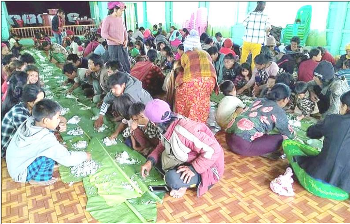
Myanmar nung rara ajanga Tenla kidang jenoka alirtem noksa nung angur.

November 09, 2023: Myanmar linük nung ano rara tesashiba akümba ajanga Khristantem densema nisung meyrjang aika ajener; ajioda Arogoi ki toktsür ajenertem yaria jenokdaksür, ta osang tasen ka ajanga metetdaksü.