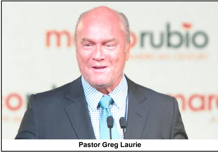
Pastor Greg Laurie

November 10, 2023: Kaketzülur aser pastor Greg Laurie-i, tang Middle East nung tatalokbatem ya Laishiba nung shin otem asen matsüngdang tenük agi ngua ataloker ama ni bilemer; Khristantemi Israel pusemba den külemi region nung yimjung atema sarasademtsüsüla, ta ashi.