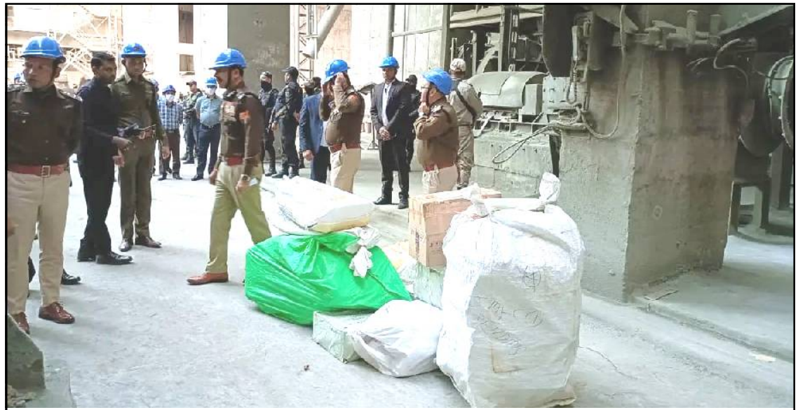
East Jaintia Hills district nung aliba Star Cement Plant, Lumshnong nung Rs 4 crore alang narcotic drugs and psychotropic substances raksa endoktsüba jakdang agiba noksa angur. Star Cement Plant nung aliba furnace rongdokba ya ken o 51 nung apuba mozütem liasü ta Meghalaya DGP LR Bishnoi-i ashi.

Roman nungertemibo natzü agisa tepo merük-merüka meyu ta otsüi ashir. Atangji ibaji shitak liasü kechiaser natzü agi meyuba sülen tepoji mesüng-mesünga aküm. Aji oda süaka, nungni, naibo yamaji teinyak.