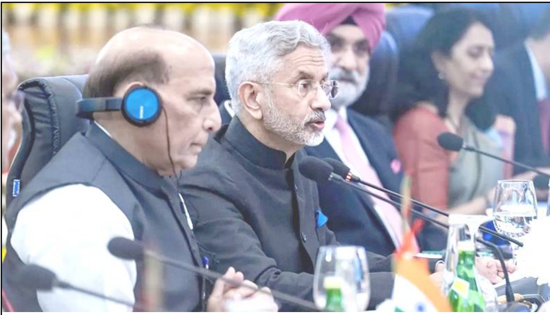
November 10, 2023 nü Sushma Swaraj Bhavan, New Delhi nung 5buba India-US 2+2 Ministerial Dialogue senden nung Defence Minister Rajnath Singh aser External Affairs Minister S. Jaishankar na noksa nung angur.

New Delhi, Yimpoksüi/ November 10 (Agencies): Hokolbarnü New Delhi nung 5buba India-US '2+2' ministerial senden nung External Affairs Minister, S Jaishankar aser US Secretary of State, Antony Blinken nati Hamas-Israel rara atema jembio.