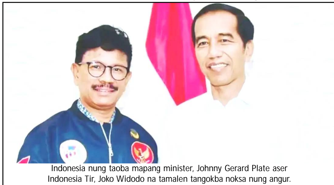
Indonesia nung taoba mapang minister, Johnny Gerard Plate aser Indonesia Tir, Joko Widodo na tamalen tangokba noksa nung angur.

Pai ashiba agi, ochimashi ken o nung Plate dak melung malem tenzükba sülen prosecutor's