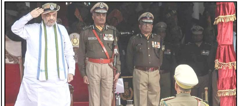
November 10, 2023 nü Dehradun nung ITBP pur 62buba Foundation Day Parade nung Union Home Minister Amit Shah adenba noksa nung angur.

"2018 küm Centre sorkari crop residue management machines (CRM) alitsü atema state sorkar nem sen crore 1,400 agütsüogo. Iba atema senji kechi nung indokar @ArvindKejriwal (Delhi CM) aser @BhagwantMann (Punjab CM) nati langzütsü mapang tongogo," ta Yadav-i metetdaksü.