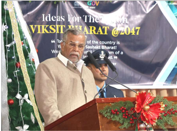
December 11, 2023 nü Dr. Imkongliba Ao Hall Raj Bhavan nung Governor La Ganesan-i Viksit Bharat@2047 tenzükba sentong nung o jembiba angur.

Paisa international, domestic aser local tourist meyirjang aika dang pelaba metetdaksü. “Nenoki Nagaland aser Naga nunger indang ambassadors akümtsü imlar aser metokmeperi kar lira tatok agütsütsü mepishir” ta Rio-i ashi.