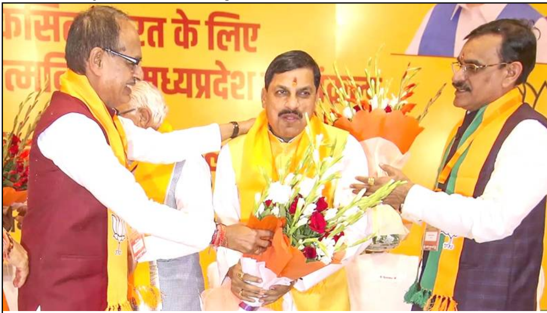
December 11, 2023 nü Bhopal nung Ujjain South nungi BJP MLA, Mohan Yadav (tiyong) Chief Minister menden atema shimba sülen taoba Madhya Pradesh CM Shivraj Singh Chouhan (abelen) aser state BJP Tir, VD Sharma nati pa nem tetushi agütsü dang tangokba noksa nung angur.

Bhopal, Luchii/December 11 (Agencies): Tawa Madhya Pradesh assembly election nung BJP-i takok anguba sülen Hombarnü BJP-i Madhya Pradesh nung Chief Minister menden atema Mohan Yadav shimogo.