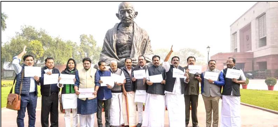
Sabarimala Sree Ayyappan Temple nung facility aser security shitak maliba atema Kerala nungi MP temi Parliament Winter session agiba mapang New Delhi nung Gandhi kerakyanglu jakedang longkak aitba noksa nung angur.

"Centre-i sen lakh crore 1.1 agütsüsü lir. Parnoki sen ya agütsü asübo kechi koma ka terenlok maparen balala inyaker lila aji bilemdangang. Centre-i senotsü sota yuaka onoki Centre-i sponsor asüba scheme balala maneni nongita yariogo. Parnoki senotsü ya agütsüsü kanga tongtibang, ajita mesüra sorkar melenshitsü nüngdaka akümtsü," ta Manata-i Alipurduar nung rally ka nung o jembiba mapang ashi.