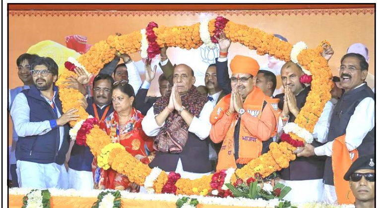
Defence Minister aser Rajasthan indang BJP central Rajnath Singh, Rajasthan BJP tir CP Joshi, taoba Rajasthan CM Vasundhara Raje aser Rajasthan Chief Minister tasenba Bhajan Lal Sharma nunger Jaipur nung BJP Legislature Party senden nung tangokba noksa nung angur.

New Delhi, Luchii/ December 12 (Agencies): Bharatiya Janata Party (BJP)-i Mongolbarnü Rajasthan chief minister mapa abentsü atema Bhajan Lal Sharma shimogo. Sanganer tang mezüngbuba election nung takok nguogo aser pa ya state BJP general secretary lir. BJP-i Shivraj Singh Chouhan melena MLA Mohan Yadav chief minister asütsü shimba sangdongba sülen anogo ka lir Sharma shimba sangdongogo. Chhattisgarh kong BJP puri December 1 nü sorkar kümteta