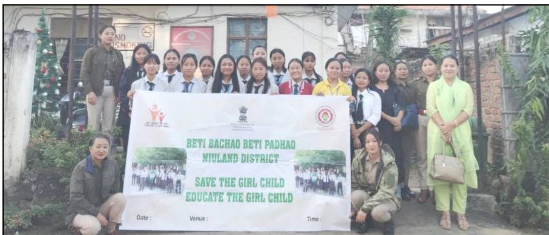
Beti Bachao Beti Padhao kübok Office of the Deputy Commissioner of Police, Niuland den lungjemer District Administration ajanga Exposure trip ka Government Higher Secondary School, Niuland nungi kaketshir 15 aser parnok tesayur asoshi ayongzükba Niuland Police Station nung Women Help Desk semdanga liasü. Maneni parnoki Women Police Station, Dimapur semdanga tetsür police ketdangsur den sensaksema liasü.