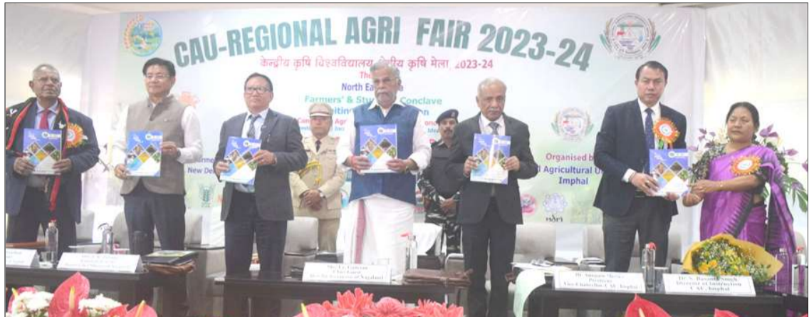
Regional Agri Fair 2023 nung Nagaland Governor La Ganesan den ketdangsürtemi Central Agriculture University (CAU) kakat sayatsüba angur.

Dimapur, December 12, 2023 (TYO): North east state ajak nung sobaliba nungi beshia aruba inyakyim ajanga aluyimba maparen inyaker aser shirurutema yamaji metsür ta Nagaland Governor La Ganesan-i ashi. "Mozü mamshii tsünüsenbongba ya tanü alima atema rongsen tulu ka lir aser teimba tsünütetba masü saka tajungtiba tsünütetba nung temulung agütsür" ta Ganesan-i ashi. Agri Expo, 4th mile Chumoukedima nung Central Agriculture University (CAU) Regional Agri Fair 2023 nung jembidang "aluyimertem sentong ya Nagaland nung agri revolution adokdaktsütsü atema lir kechiyong Nagaland nung aluyimbaren wadang tulu inyaktsü sadema lir" ta Governor Ganesan-i ashi. "North east nung chiyungtsü tapu balala aika anungji CAU-i North east state indang food atlas ka yanglu nung junger" ta paise ashi.