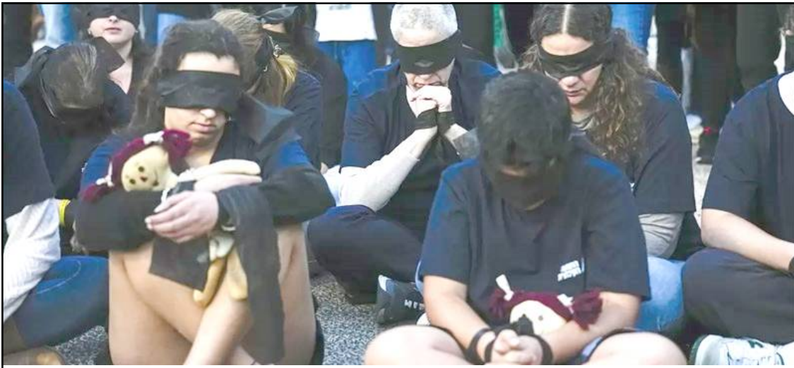
Gaza Strip nung Hamas telungpuri pia aliba kinunger aser tembar temi pua alirtem tia sayua Tel Aviv, Siraal nung aliba Museum of Art indang Hostage Square nung parnok chioktsü khanga tenük zübanger mena aliba angur.