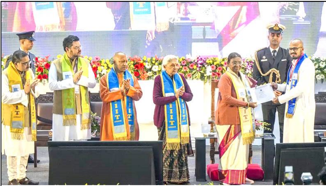
Tir Droupadi Murmu, Uttar Pradesh Angh Anandiben Patel, Chief Minister Yogi Adityanath aser tanga ketdangsütem Lucknow nung India Institute of Information Technology convocation sentong nung shilem agiba noksa nung angur.