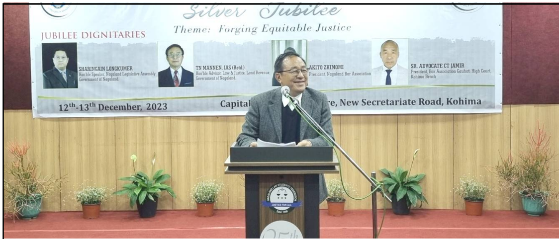
Capital Convention Centre, Kohima nung December 12, 2023 nü Nagaland Law Students' Federation kum 25 ajungba nungtem nung ayongzükba sentong mezüngbuba nung Advisor, Law & Justice, Land Revenue, T.N. Mannen, IAS, (Retd.) ajanga kaketshirtem ayongzükba o jembidang tangokba noksa nung angur.

Dimapur, Luchii/December 12 (TYO): Nagaland Law Students' Federation kum 25 ajungba nungtem nung sentong ka Capital Convention Centre, Kohima nung December 12, 2023 nü "Forging Equitable Justice" omen nung ajemdaker agia liasü.