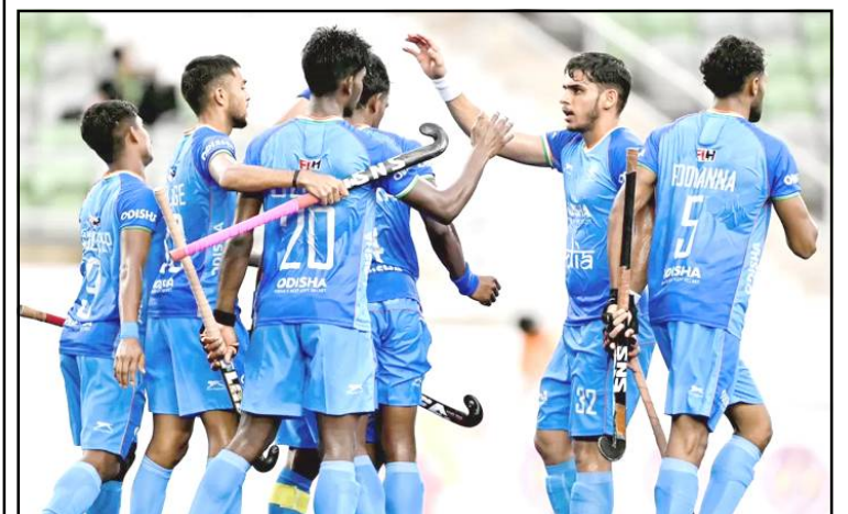
Mongolbarnü Kuala Lumpur, Malaysia nung tang asaya aliba Men's Hockey Junior World Cup quarter final nung India team-i 4-3 agi Netherland kokogo.

Tanü asayamung tenzükba Ground 1 nung Aroju Club o Wingers Club na asayaba Aroju-i goal 2-1 agi Winger madak takok angu aser aser Ground 2 nung Youngster FC o Rocky Club na asayaba Rocky Club-i goal 14-2 agi Youngster pur akok. Iba asayamung ya tan Dec ita 16 tashi asayaa amungtsü.