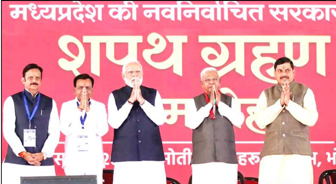
December 13, 2023 nü Bhopal nung Ato kilonser Narendra Modi aser Madhya Pradesh Angh, Mangubhai Patel nati Chief Minister tasenba, Mohan Yadav (ajichilen nungi mezüngbuba) den tangokba noksa nung angur. Amongnü Mohan-i CM tenangzükba agi.

Chhattisgarh assembly election nunga BJP-i menden 54 nung takok ngua Congress sorkar atsüngdok. Congress-i menden 35 dang ngua liasü.