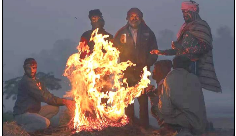
December 13, 2023 anepdang Jammu nung tebur telok ka mi wangtepdang tangokba noksa nung angur. Jammu & Kashmir nung temperature kanga aluogo. Srinagar nungbo temperature 4.6°C tashi alu.

Erdan-i, "Nenoki chichiba ceasefire aginüra Gaza nung Hamas office tem dangi call süang aser Yahya Sinwar asüngdangang. Hamas dang raraba hadir tokjang aser pua alirtem chiokang ta shiang. Ibaji ajanga dang rara anentsü aser teti yimjung alitsü," ta metetdakja liasü.