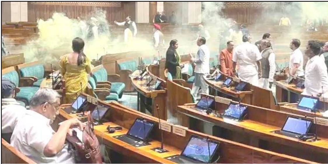
December 13, 2023 nü New Delhi nung Lok Sabha senden tagidak mapang nung mejangjaba nisung ana telungi aiter pongdang ka nungi mokozü chiokba sülen tangokba noksa nung angur. 2001 küm kiralongrartemi Parliament amakba anogomong nung ya atalok.

New Delhi, Luchii/December 13 (Agencies): Bodhbarnü Lok Sabha nung senden tagidak mapang mejangjaba nisung ana Lok Sabha sabangleni oa mokozü chiok.