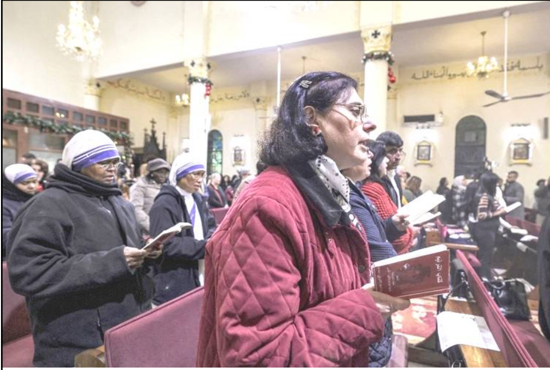
Yaküm December 24 aonung Gaza yimti nung aliba Holy Family Arogo Tenla kidang Khristmas tekülem sentong agidang tangokba noksa nung angur.

December 13, 2023: Gaza Strip nung Roman Catholic Arogo Tenla ki ka dang aliba ibajia taoba hopta Israel sepaitemi anünglen nungi amakdang raksatsüogo.