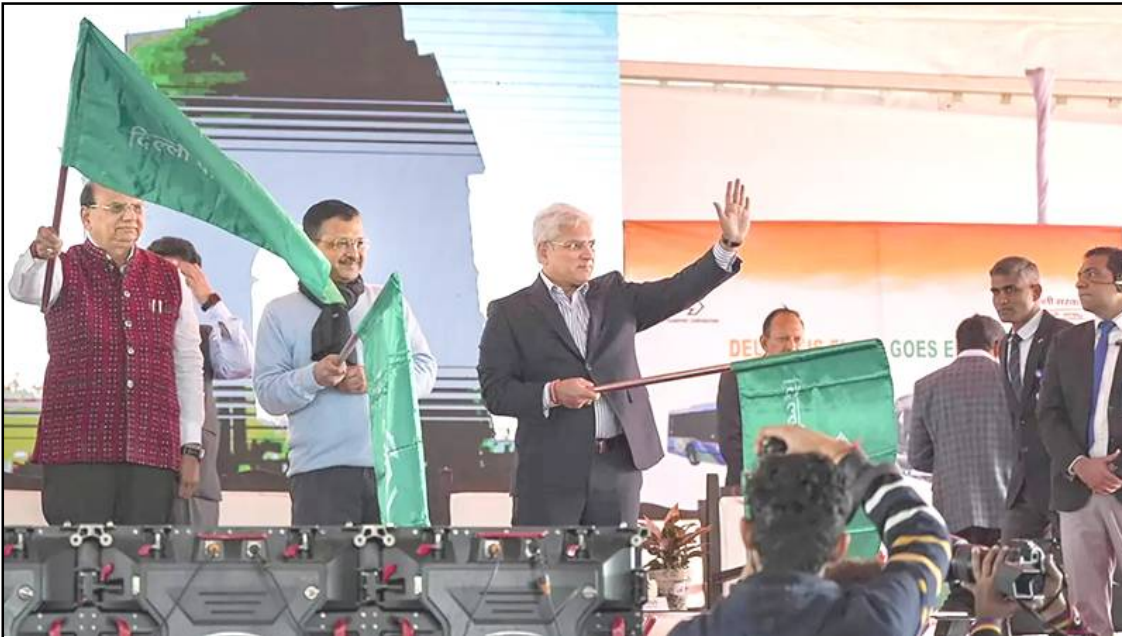
December 14, 2023 nü New Delhi nung Delhi Lt. Governor VK Saxena, Chief Minister Arvind Kejriwal aser Transport Minister, Kailash Gahlot nungeri electric bus 500 tenzüksüdüng tangokba noksa nung angur.