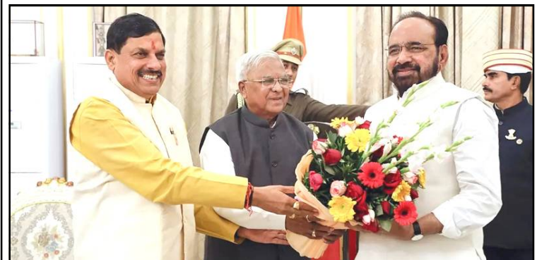
December 14, 2023 nü Bhopal nung Madhya Pradesh Angh, Mangubhai Patel aser Chief Minister Mohan Yadav nati State Assembly nung Pro-tem Speaker tasenba, Gopal Bhargava nem tetushi agütsüdüng tangokba noksa nung angur.

Paisa, "India nung aluyimertem soseta asüba shilem 37 bo Maharashtra kija nung lir, ajisiüaka iba sorkar dak taaktsü maket. State nung July 1, 2022 nungi July 1, 2023 tsüngda alu nung takoksa anguba aser sentsüh ajanga aluyimer 3,000 soseta süogo, ajisiüaka iba sorkari iba onük ya süoki ia magir," ta aija liasü.