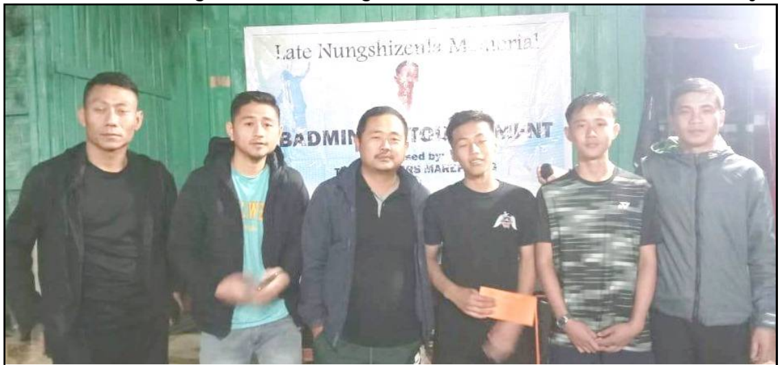
3rd Late Nungshizenla Memorial Badminton Tournament nung takokertem nem senpet agütsü dang tangokba noksa nung angur. Mokokchung, 14th December, 2023.

Mokokchung, Luchii/December 14 (TYO): Marepkong Shuttlers-i ayongzükba 3buba Late Nungshizenla Memorial Badminton Tournament December 12 aser 13 ta ana aonung Thy-coon Cottage, Marepkong Ward nung asayaa mungogo.