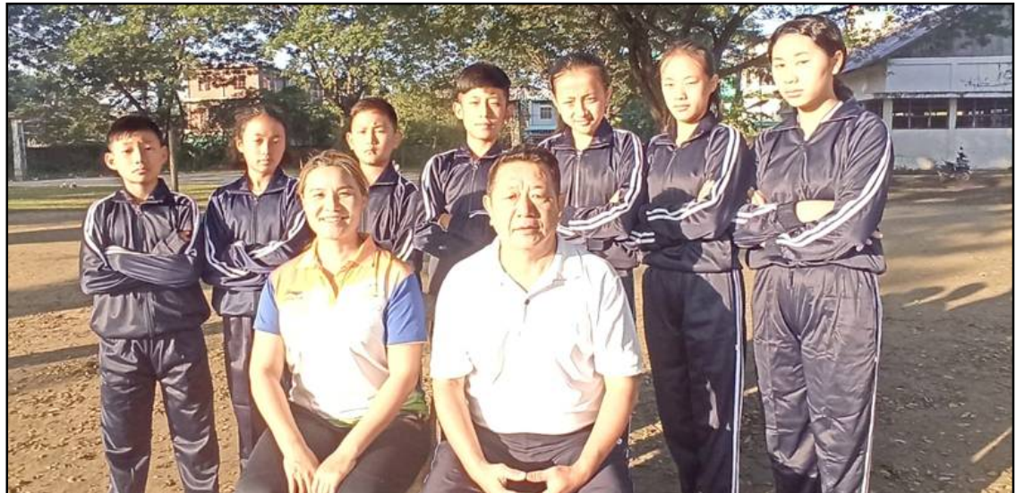
Nagaland sepaktakraw under 14 tetsür aser tebur team 67buba National School Games nung shilem agitsü. Iba asayamung ya Delhi nung December 16 nungi 19 tashi asayatsü. Nagaland team ya department of Youth Resources and Sports Nagaland-i senotsü teyari agüja iba asayamung nung shilem agitsü.