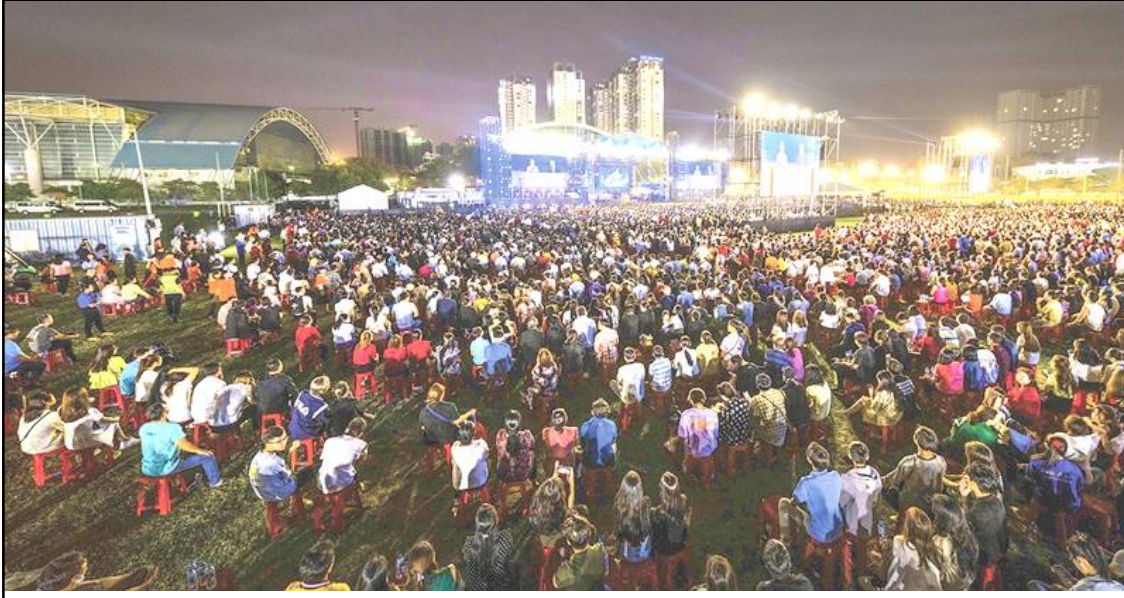
Taküm March ita nung Franklin Graham-i Vietnam kübok Ho Chi Minh yimti nung 'Spring Love Festival' evangelistic sentong agidang tangokba noksa nung angur.

December 14, 2023: Tawa pastor kati, taküm küm tetenzüklen sayutsünger Franklin Graham-i ayongzüka agiba Evangelistic sentong ajanga Yisu Khrista memeteter Vietnam nung aika kongshiogo, ta ashi.