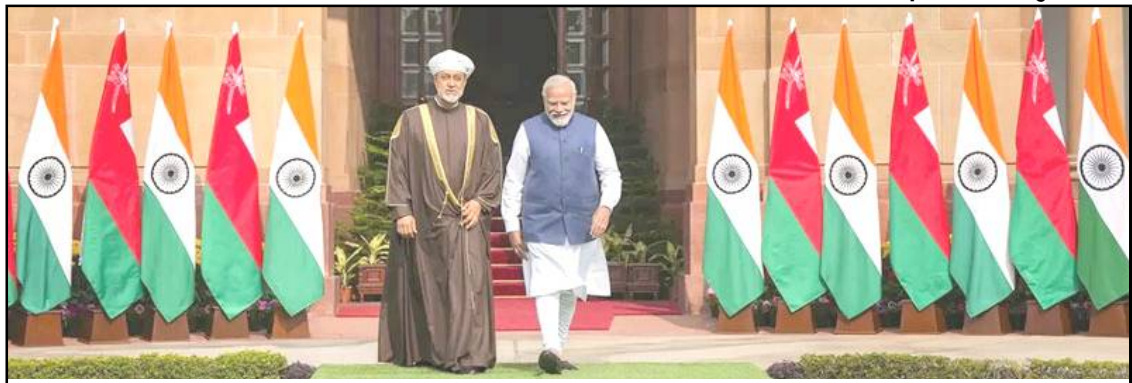
December 16, 2023 nü Hyderabad House, New Delhi nung Ato kilonser Narendra Modi-i Oman Chuba, Haitham Bin Tariq agizükba sülen tangokba noksa nung angur.

New Delhi, Luchii/ December 16 (Agencies): Honibarnü New Delhi nung Ato kilonser Narendra Modi aser Oman Chuba, Haitham Bin Tariq na senden mena tenati lenla aika nung linük ana tsüingda amalitepa inyaksü atema jembio.