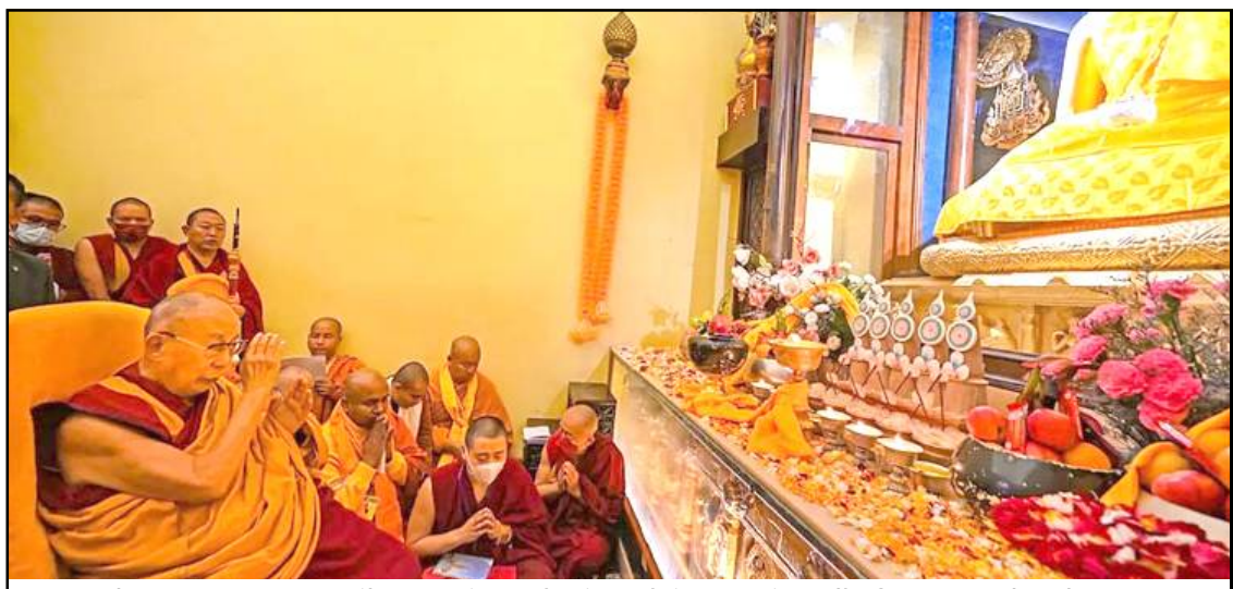
December 16, 2023 nü Tibetan yimsü lenir Dalai Lama-i Bodh Gaya semdangba mapang Mahabodhi tekülem kidang sarasadem dang tangokba noksa nung angur.