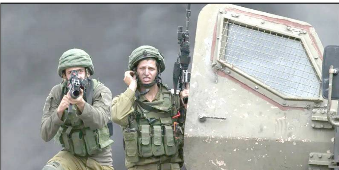
Gaza nung tesem balala meita aoba mapang Israel nung sepaitem tangokba noksa nung angur. Gaza nung aibelena Israel nung hostage asem tepsetba Israel nung sepaitemi nangzükogo.

Sheikh Nawaf ya taoba mapang Kuwait indang interior aser defense minister liasü, ajisüaka sorkar inyakyim nungbo kanga yakyaka inyaka maliasü.