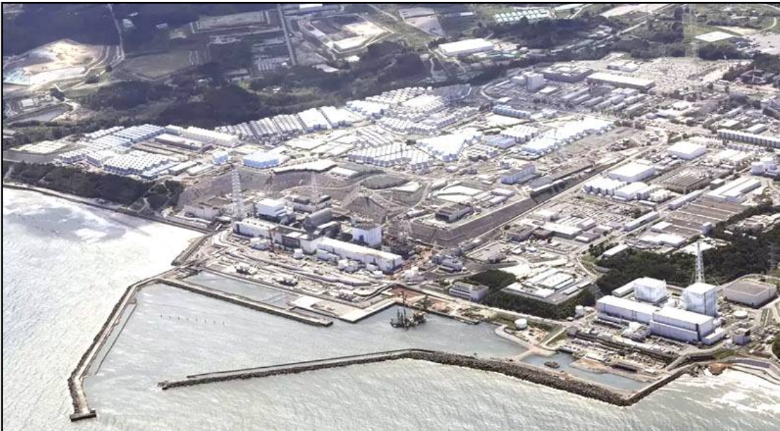
Japan nung Fukushima nuclear power plant nung inyaker ka dak radiation level tali kümer aliba ngutetogo, ta ketdangsütemi metetdaksü. October ita mapa inyaker pezü dak dak radioactive material keta aliba tzü shilokba sülen parnok ronung ana mozükidangi anir aoba sülen ita asem tsüngda tang iba osang ya agütsüogo.