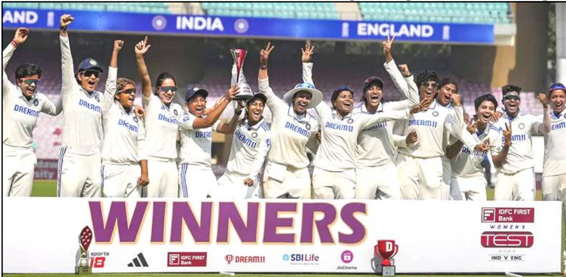
DY Patil Stadium, Navi Mumbai nung one-off Test cricket match asaya India tetsür team-i England team akokba sülen pelatepa tangokba noksa nung angur.

Luchii/December 16, 2023 (Agencies): Mumbai nung India aser England tetsür team Test asayaba India team-i anogo asembuba nung otsüsütsüsa run 347 agi asaya kokogo.