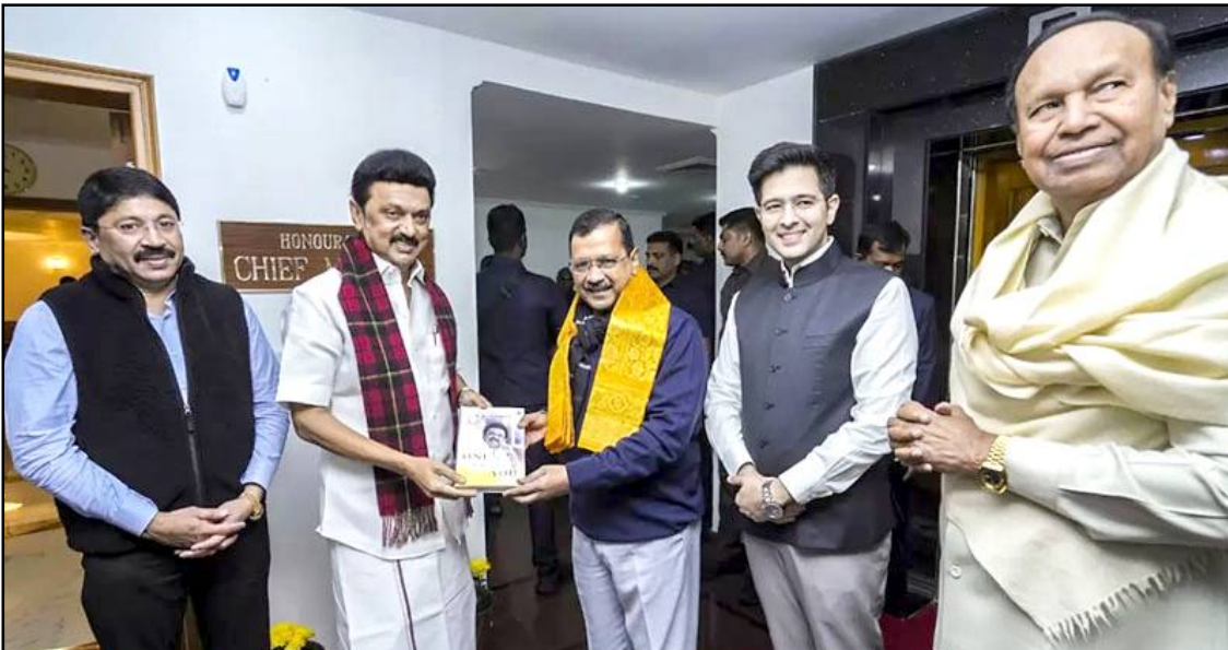
Delhi Chief Minister aser AAP Convenor Arvind Kejriwal aser Tamil Nadu Chief Minister MK Stalin na New Delhi nung senden amenba mapang tangokba noksa nung angur. AAP MP Raghav Chadha aser DMK MP TR Baalu aser Dyanidhi Maran nata noksa nung angur.