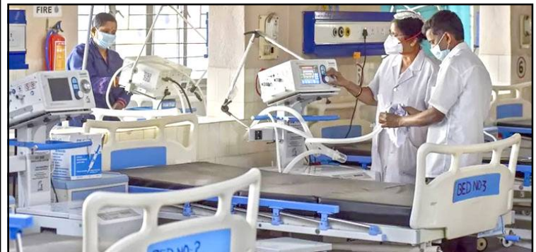
Centre-i Covid dak sendakba nung tetuyuba agütsüba sülen Hyderabad nung Government Fever Hospital nung Healthcare worker temi medical equipment aser yipdentem anepaluba noksa nung angur.