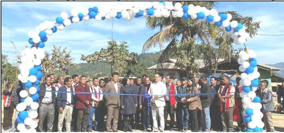
Changtongya town nung SDO (Civil), Wb.C.Wangani petrol pump ka tenüng agi Tir Service Station lapoktsüba noksa nung angur. ( CTN December 19,2023).

CTN.December 19(TYO): Changtongya town kümer mezüng gari nung totzü enokba tesem ka National Highway agi ajangba New Medical Colony, Changtongya town nung tanü Mongolbar nü SDO(Civil) Changtongya, Wb.C.Wangan (NCS)-i semzüksüogo.