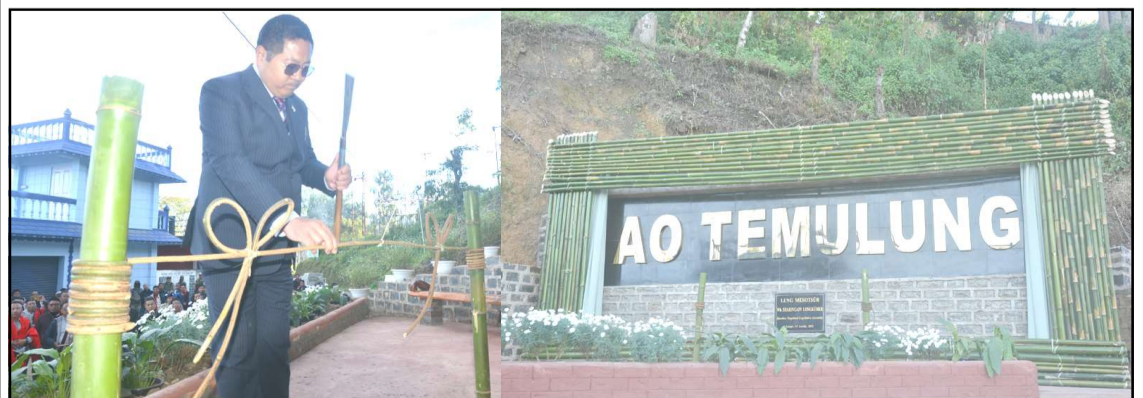
Mopungchuket yim süngküm anasa Aotemulung nungja nungshi lung ka Dec 19 nü Nagaland Legislative Assembly, Speaker, Sharingain Longkumer-i lapoktsüba mapang tangokba noksa nung angur. Mokokchung, 19th December, 2023