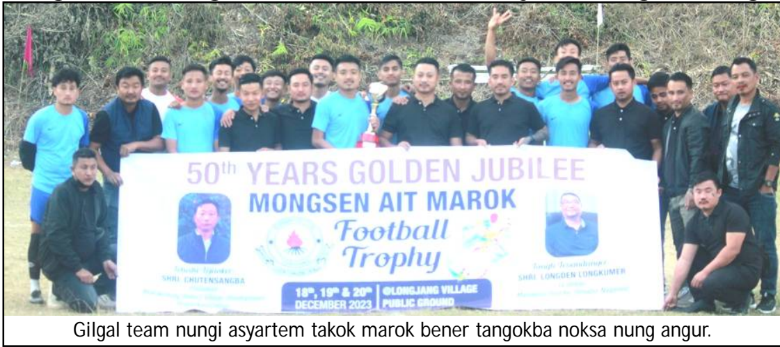
Gilgal team nungi asyartem takok marok bener tangokba noksa nung angur.

Mokokchung, Luchii/December 20 (TYO): Mokokchung district kübok Longjang yimtsüung nung Mongsen Ait Club (MAC)-i ayongzüka asayaba Mongsen Ait Marok asayamung Gilgal team-i kokogo.