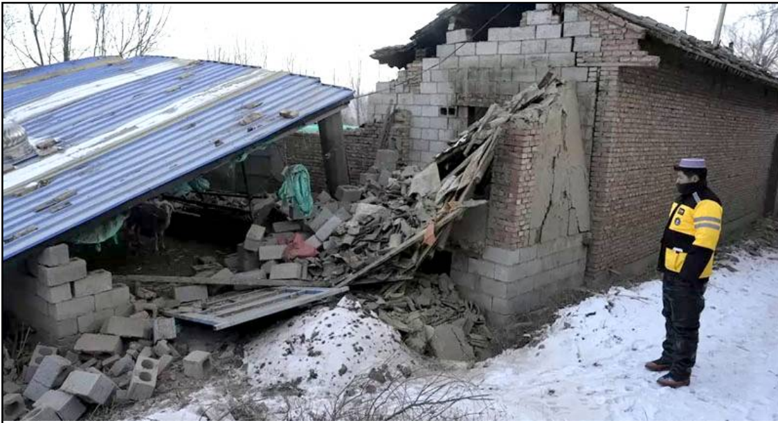
China northwest tsütsü Gansu province kübok Dahejia jila anasa Yangwa yimtsüung nung ki ka laor aliba nisung kati repringba noksa nung angur. Hombar aonung menoknok tesashi anokba ajanga tenem agi sünga aliba region nung nisung aliba ki raksatsü aser nüburtem asük-asa agi kanga tim atemer. China nung ibai küm tuko nung menoknok tesashitiba alitsü.