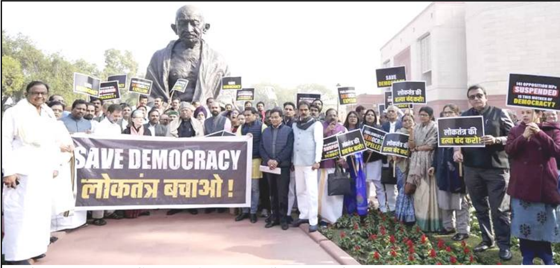
Asükwa mongpu Parliament piyong MP aika anentsüba anema December 20, 2023 nü Parliament kima Mahatma Gandhi kürakyanglu anasa Congress Tir, Mallikarjun Kharge leniba nung party balala nungi opposition MP temi longkak aيتدang tangokba noksa nung angur.