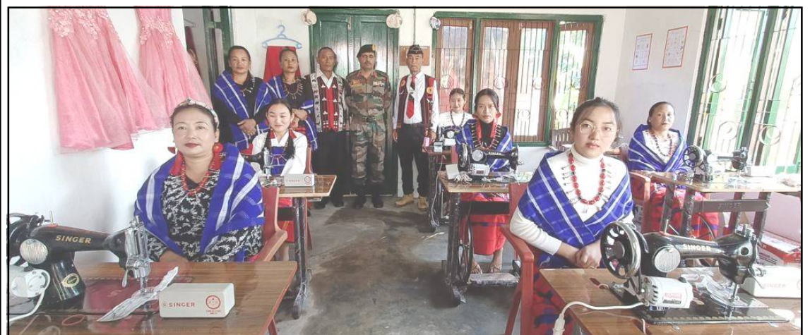
OP Sadbhavana project kükok Assam Rifles-i, 'Passion to profession' omen nung ajemdaker December 20 nü tetsürtem atema Skill Development Centre ka lapoktsüogo aser Tuli nung Merankong Women Association nem Sewing machines 20 tenla agütsüogo. Iba Centre ya DIG, 7 Sect Assam Rifles-i lapokja liasü. Sewing machine aser training agütsüba ajanga aiür chanutem aser tetsürtem nem sen aatsü asoshi lenmang lapoktsütsü.

Temtetsü kaji 2024 Lok Sabha election agitsü asoshi ita pezü dang anunga lir aser iba election atema Meghalaya nung party timbai parnok indang candidate shimatokogo.