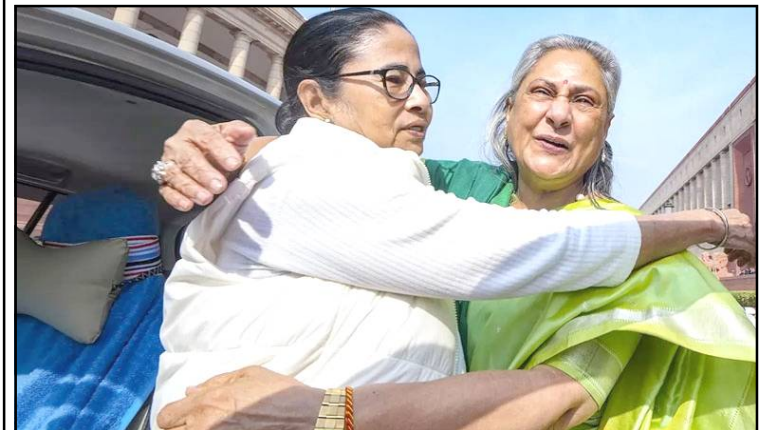
December 20, 2023 nü New Delhi nung Parliament kima West Bengal Chief Minister, Mamata Banerjee aser Samajwadi Party MP, Jaya Bachchan na ajurudang tangokba noksa nung angur.

Linük nung AIIMS 8 dang aliba nungi tangbo 23 kümogo, ta paisa shisem.