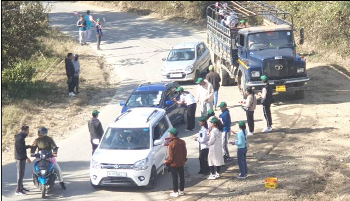
December 20, 2023 nü Koinonia Baptist Church (KBC) nungi lanurtemi Koinonia Prayer Centre (KPC), Tsiesema Army Camp anasa National Highway-2 nung ainen jajar tem nem angati coffee, süngo aser amtsük agütsü dang tangokba noksa nung angur.

Kohima, Luchii/December 20 (TYO): Bodhbarnü Koinonia Baptist Church (KBC)-i Koinonia Prayer Centre (KPC), Tsiesema, Army Camp anasa National Highway-2 nung ainen jajar tem nem angati coffee, süngo aser amtsük agütsü. Koinonia Media Ministry-i sangdong ka ajanga, Khristmas mongpu tenzuka temeim aser tepela osang sangdongtsü nükjidong nung