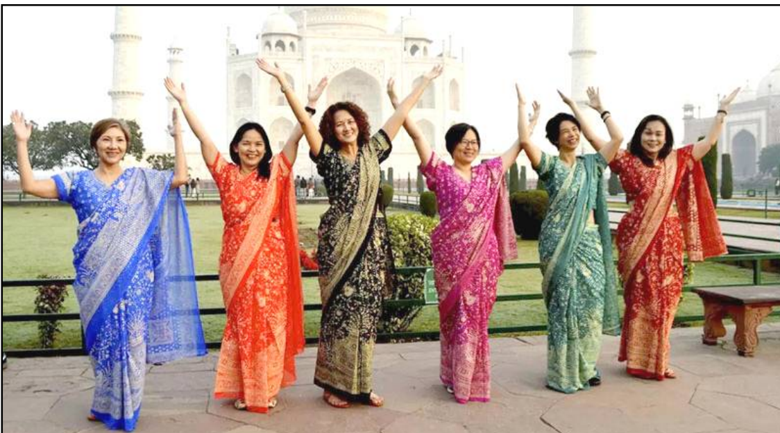
World Saree Day amongtsü anogo ka jelia December 20, 2023 nü Agra nung bendangtsür raliwalirtemi saree agir Taj Mahal anasa tangokba noksa nung angur.

Insacog official sangdong ka ajanga, tawa Kerala nung nisung ka asübaji Covid ajanga dang masü saka temang nung tanga timtem balala ajanga-a liasü, ta metedktsü.