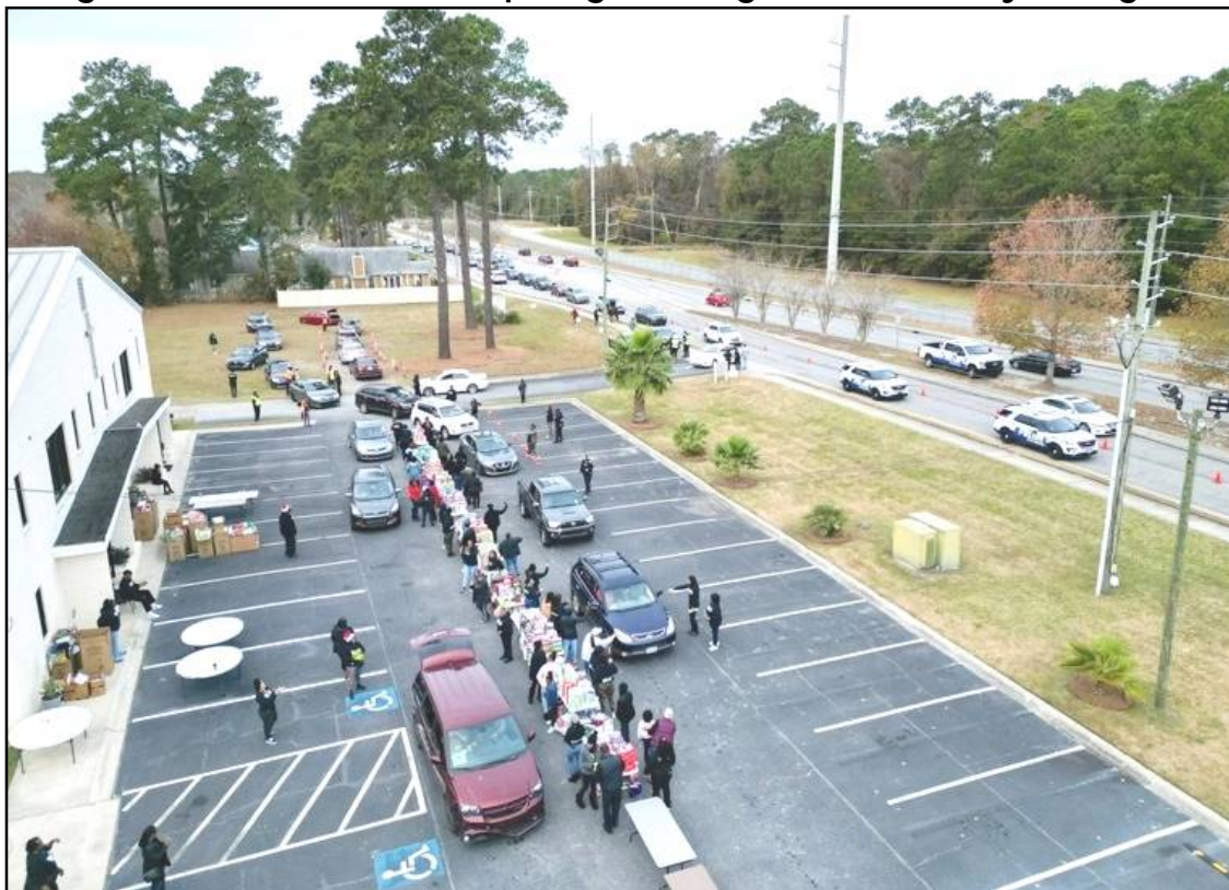
Savannah, Georgia nung aliba Kingdom Life Christian Fellowship-i nungdakba kibongtem nem teyari oset balala lema agütsü tangokba noksa nung angur.

Luchii/December 20, 2023: Khristmas atongtsü mapang anasa Savannah, Georgia nung aliba Kingdom Life Christian Fellowship-i teyari nungdakba kibong noklang aika nem chiyungtsü box 1,200 den gift cards agütsü.