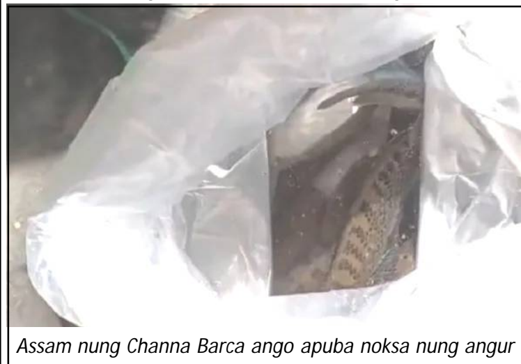
Assam nung Channa Barca ango apuba noksa nung angur

Dibrugarh, Luchii/December 21 (Agencies): Dibrugarh Forest Department-i Brehostibarnü Dibrugarh Airport meita aoba mapang Channa Barca ango 500 puogo.