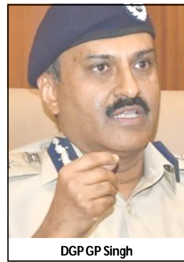
DGP GP Singh

ULFA-I puri grenade pokloktsüba mapang ka nung district ajak nung security akangshitsüba dak rangloker iba