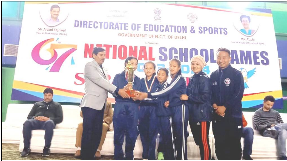
Nagaland tetsür team-i tawa tembangba Under 14 boys aser girls 67th National School Games nung Bronze medal (Girls Regu Event) ka nguogo.