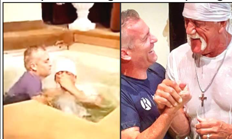
Hulk Hogan baptidang tangokba noksa nung angur.

December 21, 2023: WWE nung kanga nüngtugu wrestler tem rongnung ka, Hulk Hogan arrshi küm 70 nung pa kinüngtsü den külemi tzü nung baptiogo.