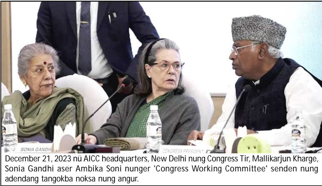
December 21, 2023 nü AICC headquarters, New Delhi nung Congress Tir, Mallikarjun Kharge, Sonia Gandhi aser Ambika Soni nung 'Congress Working Committee' senden nung adendang tangokba noksa nung angur.