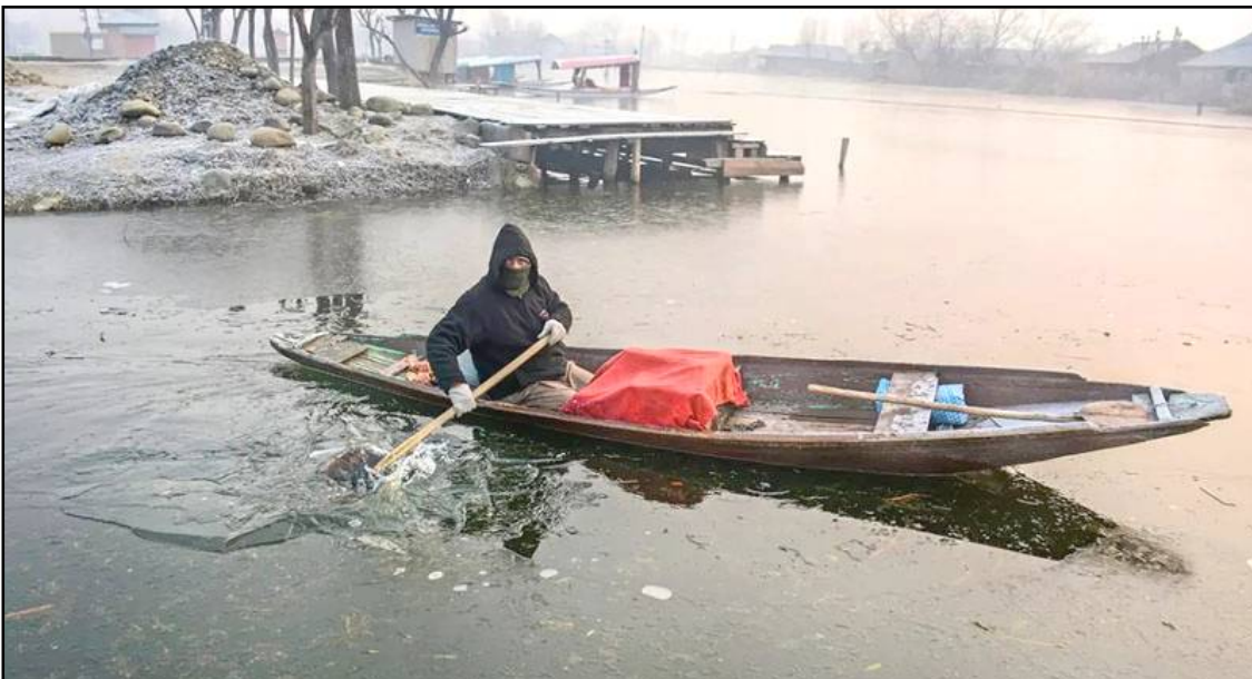
December 21, 2023 anepdang Srinagar nung rürjep tera kümer aliba Dal awatsüng nung nisung ka rong nung aodang tangokba noksa nung angur. Jammu & Kashmir nung temekongtiba anogo 40 mongpu dang 'Chillai Kalan' ta ajar aser iba mongpu Brihostibar nungi tenzük.

Delhi excise policy ochimashi ken o dak sendakba nung CBI ketdangsertemi ashiba agi, AAP sorkari excise policy nung ochimashi mapa aika inyakogo, iba nungji Excise Policy yanglushiba, yi ayoktsü license atema sübokrem agiba, licence fee ajemtsüba mesüra atokba aser temelaba memeshii L-1 license atsülangtsüba densema lir.