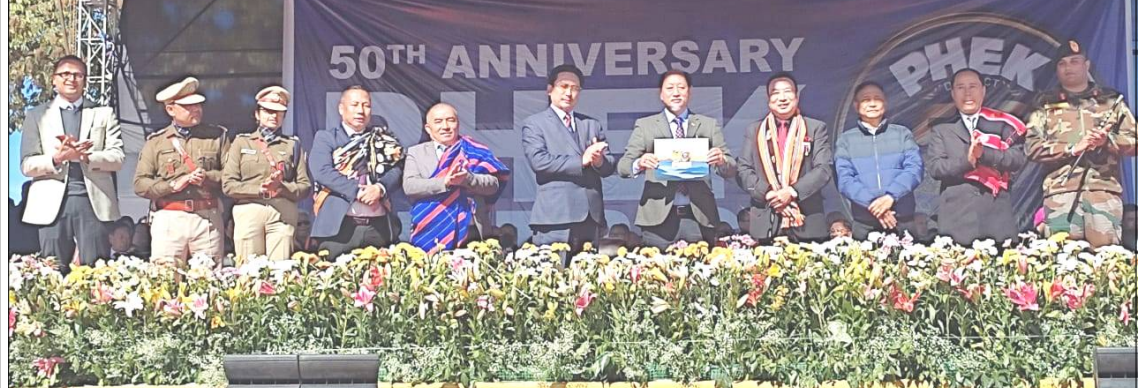
Phek District kum 50 ajungba sentong December 21, 2023 nü Phek Town Local Ground nung agidang Chief Minister Neiphiu Rio-i jubilee souvenir sayatsüdang tangokba noksa ka yangi angur.

Dimapur, Luchii/December 21 (TYO): Phek District kum 50 ajungba sentong December 21, 2023 nü "Transcending in Truth" omen kübok Phek Town Local Ground nung agia liasü. Iba sentong nung tesemdang tongti ama Nagaland Chief Minister, Neiphiu Rio dena liasü.