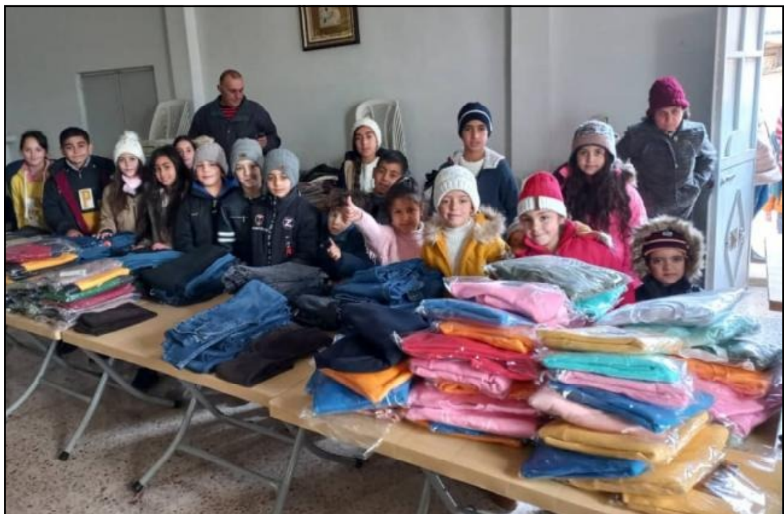
Syria nung Aid to the Church in Need (ACN)-i tanur kar nem sempet agütsüba sülen tangokba noksa nung angur.

December 28, 2023: Khristmas mapang nung Khristan melungtet telok kati nun tem den yarisema Syria aser Lebanon na nung tanur meyirjang aika nem Khristmas sempet lema agütsü.