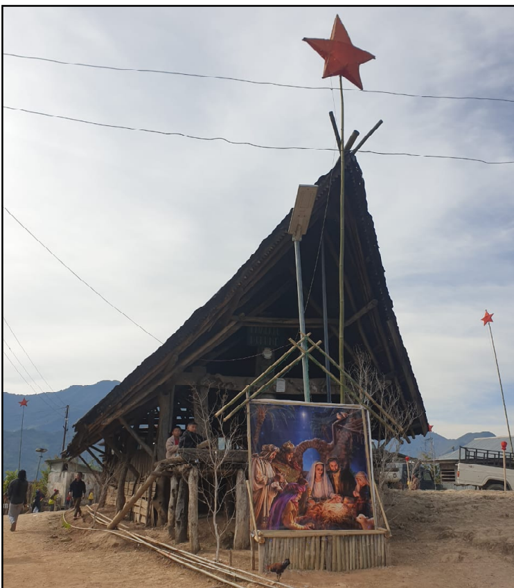
Pei sobaliba tajung meindoki Christmas amungba noksa ka yangi angur. Ibai Longleng district kübok Yangching yimtak ariju kolak nung nung Christmas petinu aser kima Christmas noksa ka yur Yisu asoba benjungmung amungba angur. Iba yim ya Phom lima anüdoklen Phom yim tesü sabuba lir. Iba yim serbo Konyak limai ayaoktsü. Iba yimtak 1952 kum Mongsenyimti arogo nung amungba purtem kar oagi arogo tentetsü. International Trade Centre Pangsha leni aoba highway iba yimtsung ajanga aoe. Iba noksa ya December 20, 2023 anogo nung par yimtak tenla ki tasen meshitetba anogo nung agiba lir.