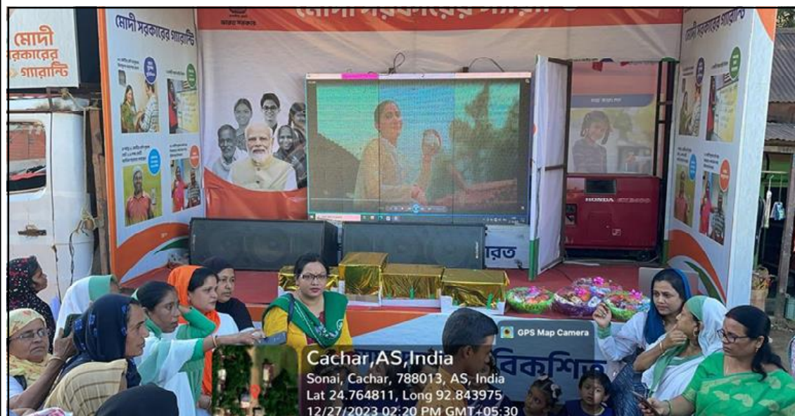
December 27 nü Assam kübok Cachar district nung Viksit Bharat Sankalp Yatra sentong ka ayongzuka agiba mapang tangokba noksa nung angur.

Iba yimtsüing kechiba amak aji jangjatsü atema bushisüngdang tenzükogo.