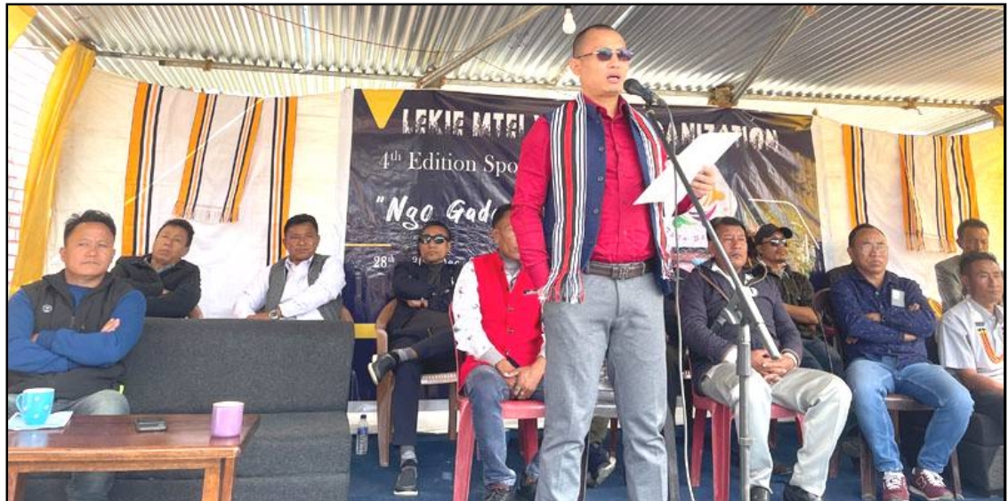
4buba Lekie Mtei Youth Organsiation (LMYO) Sports Meet December 28 nü Lekie Village Local Ground nung tenzükogo. Asayamung lapokba sentong nung OSD to Dy. Chief Minister, Planning & Transformation, National Highway Azeu Namcyn Hau alakteta jaoker liasü.

nung Fifa World Cup nung asaya pezü nung shilem agiba densema lir. Maneni pa England indang under-21 team nungia 14 ben asayaogo. Pa West Ham United (1998-2003; asaya 177) aser Manchester City (2003-2007; asaya 82) nungia asayaogo. Küm 19 tashi professional ka ama asayaba sülen Sinclair ya temekok yiruba ajanga 2008 küm asaya nungi anena liasü. Asia Cup nung India team January 13 nü Australia den mezüng asayatsü aser iba sülen Uzbekistan (Jan 18) aser Syria (Jan 23) na den asayatsü. India team Doha nung December 30 nü adenshitsü, anungji parnok Asia Cup atema renemshitsü asoshi hopta anabo mapang angutsü.