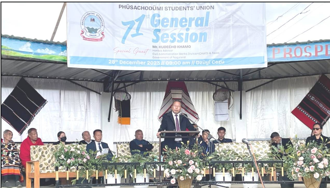
Phusachodu village nung December 28, 2023 nü 71 buba Phusachodümi Students' Union lokti senden amendang Advisor Küdecho Khamo-i kaketshirtem den jembidang tangokba noksa ka yangi angur.

Kohima, Luchii/December 29 (TYO): Phusachodümi Students' Union pur 71 buba lokti senden December 28, 2023 nü Dzüyi Cezu, Phusachodu village nung agia liasü.