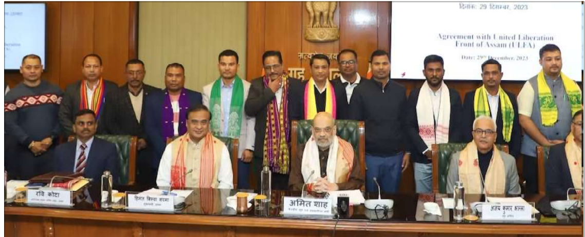
December 29, 2023 nü New Delhi nung Centre, Assam sorkar aser United Liberation Front of Asom (ULFA) tsüngda yimjung tenangzüktep nung sign asü dang Union Home Minister Amit Shah den tangartem agiba noksa ka angur.

New Delhi, December 29, 2023 (Agencies): December 29, 2023 nü Centre, Assam sorkar aser United Liberation Front of Asom (ULFA) tsüngda yimjung tenangzüktep ka nung sign sütepogo.