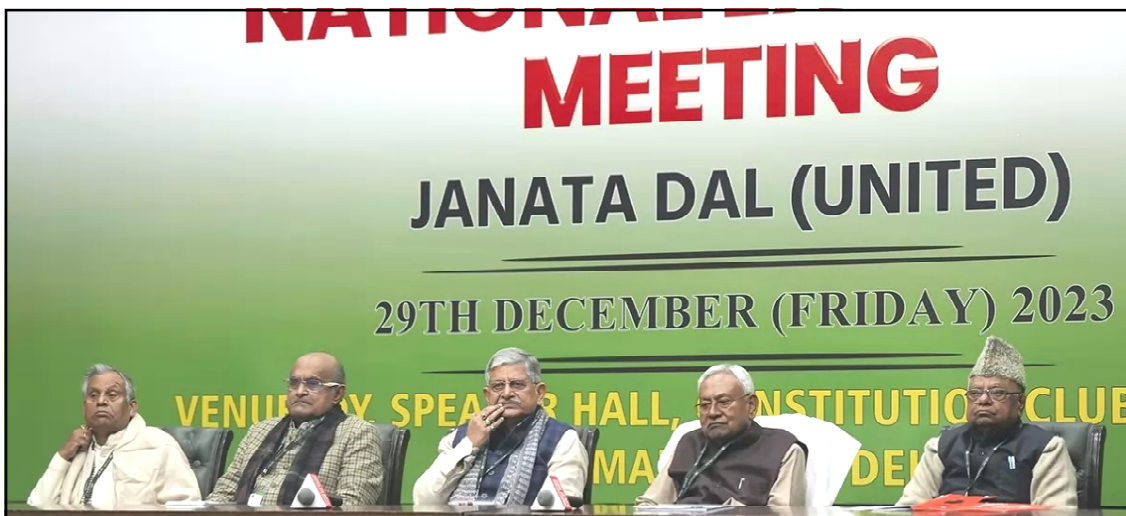
December 29, 2023 nü New Delhi nung Bihar Chief Minister Nitish Kumar, JD(U) National Tir, Lalan Singh aser tangartem JD(U) national executive senden amendang tangokba noksa nung angur.

New Delhi, December 29 (Agencies): 2024 küm Lok Sabha election agütsü atema ita ishika dang lia Hokolbarnü Bihar Chief Minister, Nitish Kumar Janata Dal (United) National Tir shimogo. Delhi nung JDU national executive senden aliba mapang Lalan Singh Party National Tir menden nungi anendaksüba sülen mapang tatsüka tsüngda Kumar Tir shim. Osang angazükba agi, JDU national executive senden tenzüka sülen mapang tatsüka