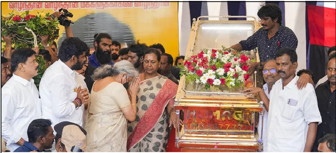
December 29, 2023 nü Chennai nung Union Finance Minister, Nirmala Sitharaman-i DMDK tentetsang, Vijayakanth nem akhüm agütsüdüng tangokba noksa nung angur.