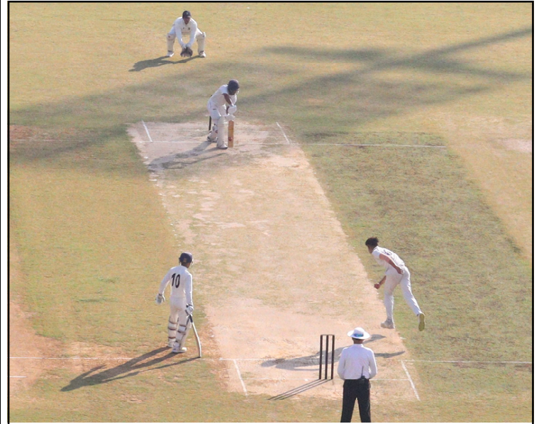
Hokulbarnü Nagaland aser Meghalaya tsüngta Nagaland Cricket Stadium, Sovima nung Cooch Behar Trophy Final Match (Plate Group) asayadang tangokba noksa ka yangi angur.

Dimapur, Luchii/December 29 (TYO): Nagaland aser Meghalaya tsüngta Cooch Behar Trophy Final Match (Plate Group) tanü Nagaland Cricket Stadium, Sovima nung tenzüka liasü.