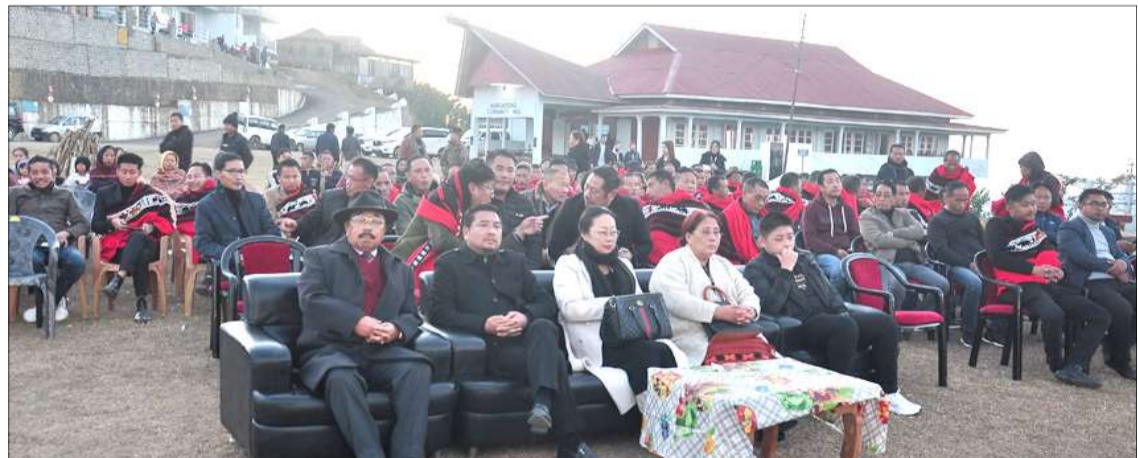
December 29, 2023 nü Mangmetong yimtsüng nung 94 buba AKM Foundation Day amongdang agiba noksa ka angur.

Mangmetong, December 29, 2023 (DIPR): Ao Kaketshir Mongdang (AKM) 94 buba Foundation Day nungtem nung Mangmetong Kaketshir Telongjem (MKT)-i kenten sentong tajung ka ayongzük agiogo.