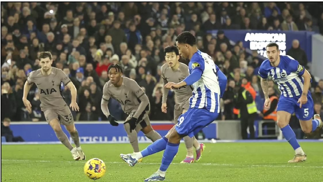
Brighton, England nung aliba Amex stadium nung Tottenham Hotspur aser Brighton tsüngta English Premier League asayadang Brighton nungi Joao Pedro-i par telok asoshi goal tanabuba agütsür tangokba noksa nangur. Iba asaya nung Brighton-i goa 4-2 agi Tottenham akok.

Real Madrid ajanga sangdong ka nung, "Pa Real Madrid coach ama season pongu inyakdang titles 10: Champions League ana, Club World Cups ana, European Super Cups ana, League ka, Copas del Rey ana aser Spanish Super Cup ana ngutetogo," ta ashi. "EuropeanCups pezüben tashi takok ngutetba coach ji Carlo Ancelotti dang lir aser iba competition nung takok timtiba (118) nguteter alitsü, aser major European Leagues pongu (Italy, England, France, Germany aser Spain) akoker coach mezüngbuba alitsü."