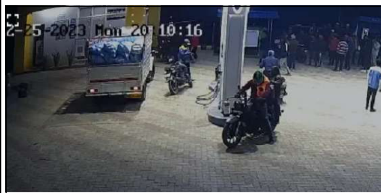
Nalbari district kübok Satra nung aliba BPCL petrol pump nung CCTV ajanga tangokba noksa ka angur.

Guwahati, December 29, 2023 (Agencies): Lower Assam kübok Nalbari district nung Hindu nunger telok kati Christmas sobutsü enokba raksatsü.