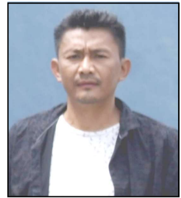
(7th July 1984 - 23rd December 2023)