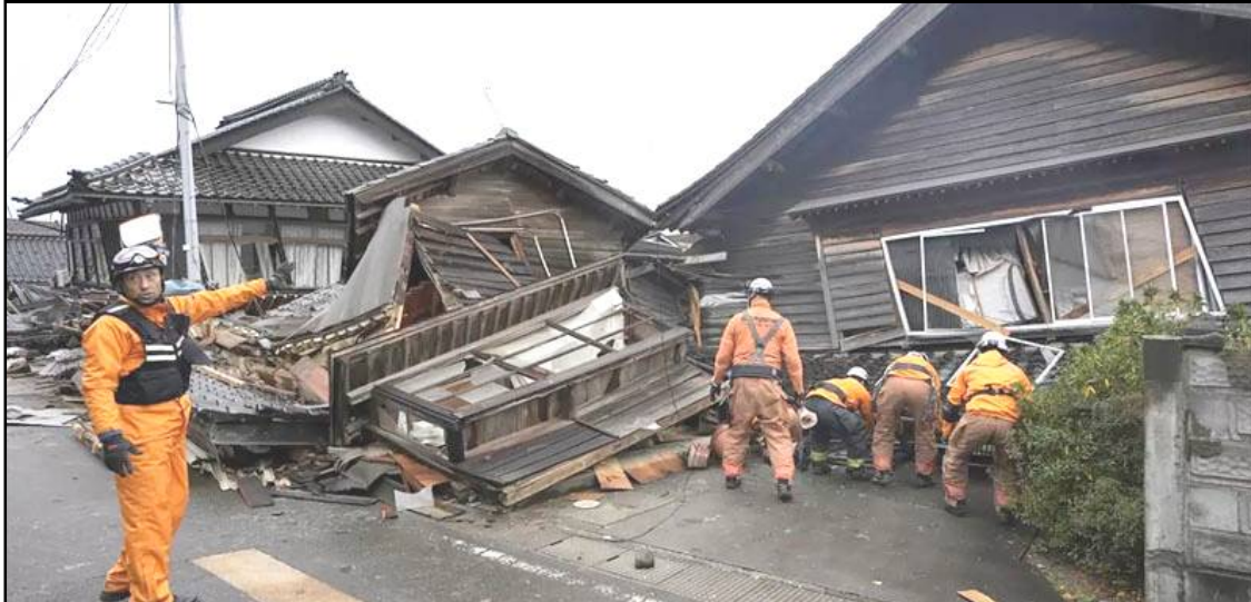
Menoknok tesashi anokba ajanga Suzu, Ishikawa Prefecture nung ki ka ladaktsür alidak rescue worker temi nisung bushiba noksa nung angur. January 1 nü Japan anüdoklen menok tesashi anoka ki o jen raksatsü aser nisunga 60 dak tema süogo aser ano maneni anoktsü akok ta ketdangsür temi ashir.