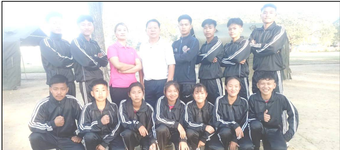
Directorate of Youth Resources and Sports, Govt. of Nagaland-i senötsü teyari agüja Nagaland Sepaktakraw team 67buba National School Games 2024 (U-17 aser U-19 tetsür aser tebur) nung shilem agitsü. Iba asayamung ya January 3 nungi 7 tashi Patna (Bihar) nung asayatsü.

Forwards: S. Karthi, Mandeep Singh, Lalit Kumar Upadhyay, Abhishek, Dilpreet Singh, Sukhjeet Singh, Simranjeet Singh, Shilanand Lakra, Pawan Rajbhar.