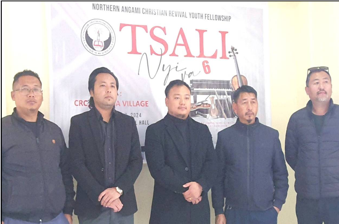
January 03, 2024 nü Kohima nung osangbenertem senden ka nung Northern Angami Christian Revival Youth Fellowship (NACRYF) Music Festival ayongertem tangokba noksa nung angur.

Kohima, January 03 (TYO): Northern Angami Christian Revival Youth Fellowship (NACRYF) 6buba triennial Music Festival January 7 nü Capital Cultural Hall, Kohima nung ayongzüker, ta Bodhbarnü Organizing Committee-i osangbenertem senden ka nung metetdaksü. Music festival ya Christian Revival Church, Kohima Village-i ayongzüker. January 3 nü osangbenertem senden ka nung