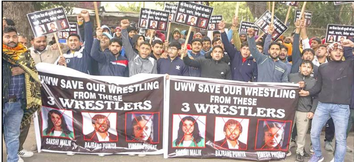
Bodhbarnü Jantar Mantar, New Delhi nung wrestler Sakshi Malik, Bajrang Punia aser Videsh Phogat nung anema lanur wrestler temi longkak aitba mapang tangokba noksa nung angur.

New Delhi, Aenjeti/January 3 (Agencies): Junior wrestler temi, parnok indang career nung küm ka tashi tetsüdaktsü adokba anema Jantar Mantar, New Delhi nung longkak aita liasü.