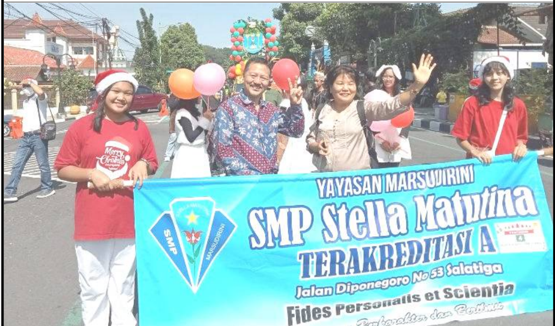
Yimdong sua Christmas carol aoba noksa yangi angr.