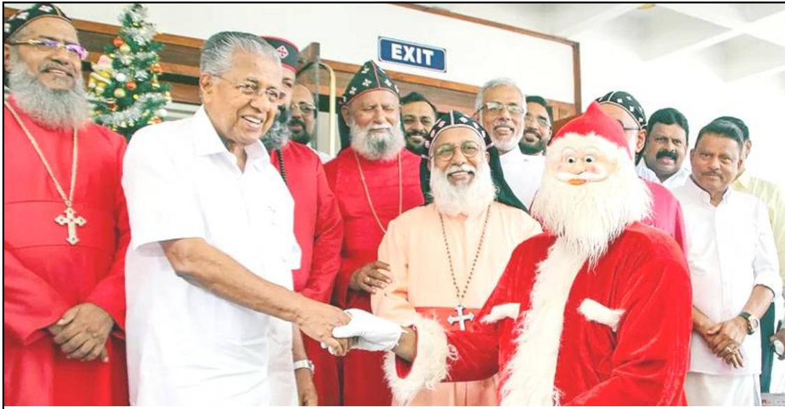
January 03, 2024 nü Thiruvananthapuram nung Kerala Chief Minister, Pinarayi Vijayan-i Christmas-New Year nungtem nung ayongzükba sentong ka nung tangokba noksa nung angur.