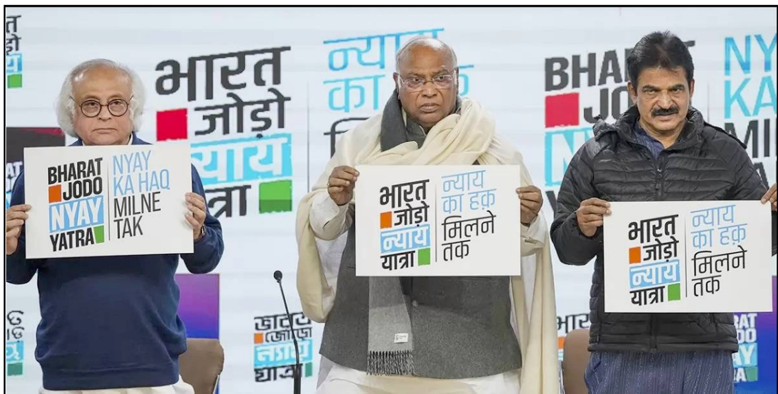
January 06, 2024 nü New Delhi nung Congress Tir, Mallikarjun Kharge den party lenirtem-Jairam Ramesh aser KC Venugopal nungeri 'Bharat Jodo Nyay Yatra' atema logo aser naklu sayatsüdang tangokba noksa nung angur.

New Delhi, Aenjeti/January 06 (Agencies): Honibarnü Congress party-i Rahul Gandhi leniba nung agitsü aliba 'Bharat Jodo Nyay Yatra' indang logo aser yimyim sayaogo.