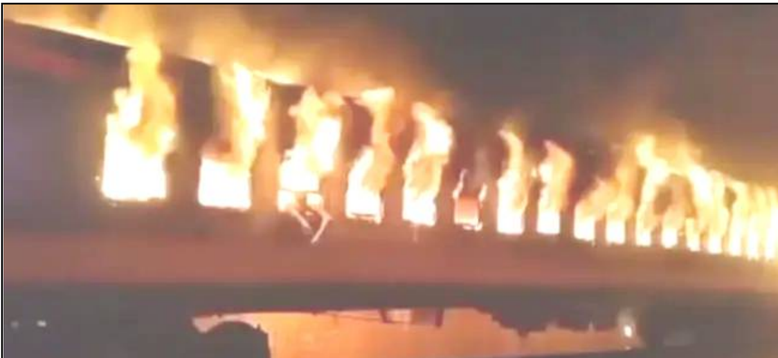
Dhaka: Bangladesh kübok Gopibagh tesem nung intercity Benapole Express train nung mi adokba sülen nisung pezü süogo. Dhaka Tribune sangdong ka ajanga ashiba agi, iba lendong ya Hokolbarnü 9:5 nung ataloka liasü aser mejangjaba nisungtemi iba train indang compartment pongu tashi nung mi senoktsü.