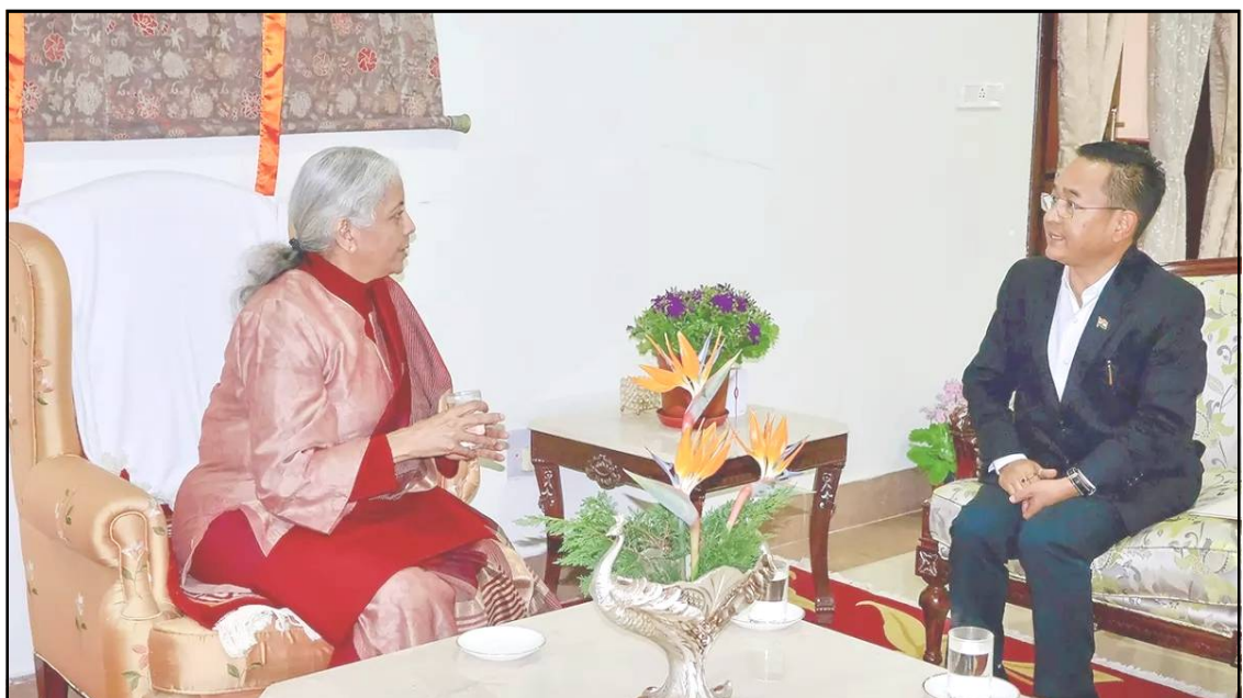
January 06, 2024 nü Gangtok nung Union Finance Minister Nirmala Sitharaman aser Sikkim Chief Minister, Prem Singh Tamang na senden amendang tangokba noksa nung angur.

Anüdoklen Rajasthan nung tesem aika kanga mekongka kümogo; January 8-9 anogotem nung state nung tziunglu sashia arutsüa akok, ta weather department-isa metetdaksü.