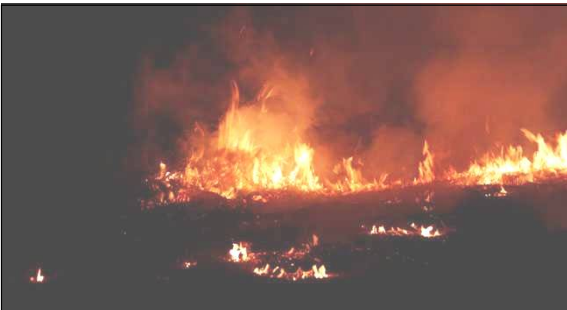
Bangladesh nung polling booth rongtoktsüba noksa angur

Dhaka, Aenjeti/January 6 (Agencies): Deobarnü general election agitsü lia Bangladesh nung Polling booth tem rongtoktsüogo. Train ka maka nisung pezü tashi tepsetba sülen ghonda ishika dang lir Polling booth tem ya rongtokja liasü.