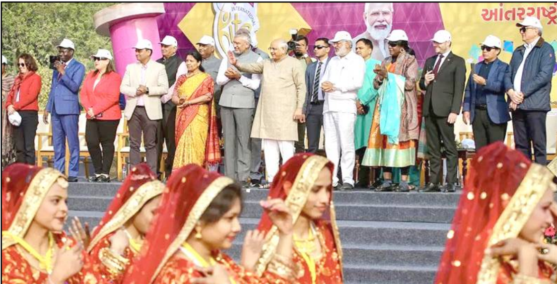
January 07, 2024 nü Ahmedabad nung Gujarat Chief Minister, Bhupendra Patel-i International Kite festival tenzüksüsdang tangokba noksa nung angur.

Ayodhya nung Ram tekülem ki semzükba sentong nung nisung 6,000 shi adentsü aser kasa sentong nungji Ato kilonser, Narendra Modi-a adentsü.