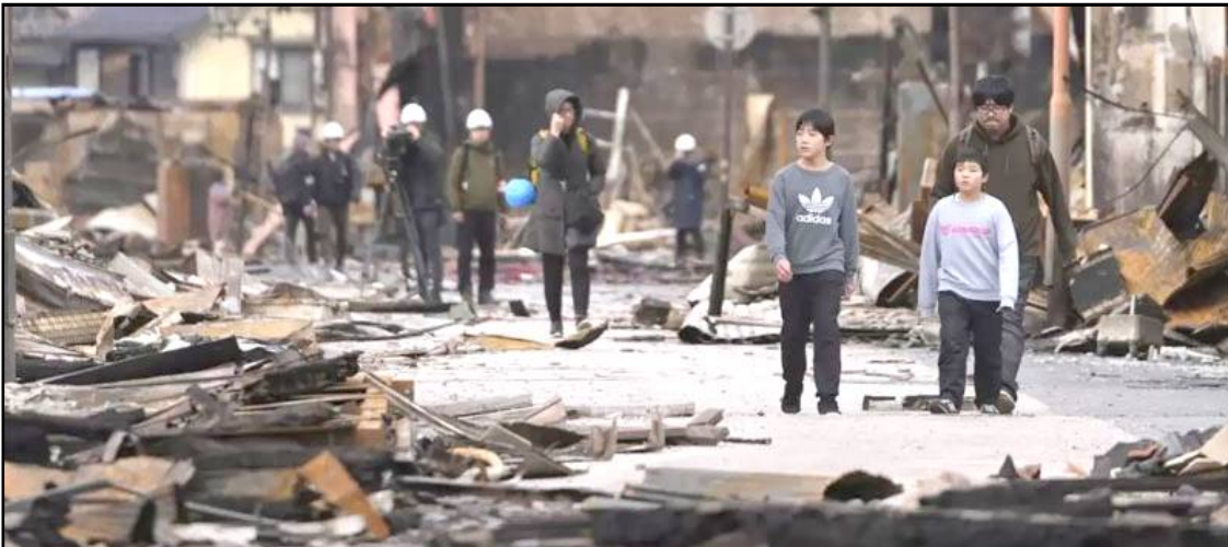
Noto Peninsula nung aliba Wajima tesem nung shishilempadak tesem ka nung mi adokba sülen nüburtem yangji senzuba noksa nung angur. Japan indang Noto Peninsula nung nisung 222 samar bushir aser yangji Deobar aonung rer alatsü mesüra tzünglu sashia arutsü ta shia lir. Japan nung January 1, 2024 nü menoknok tesashi anakba nung nisung 126 takum samar lir.