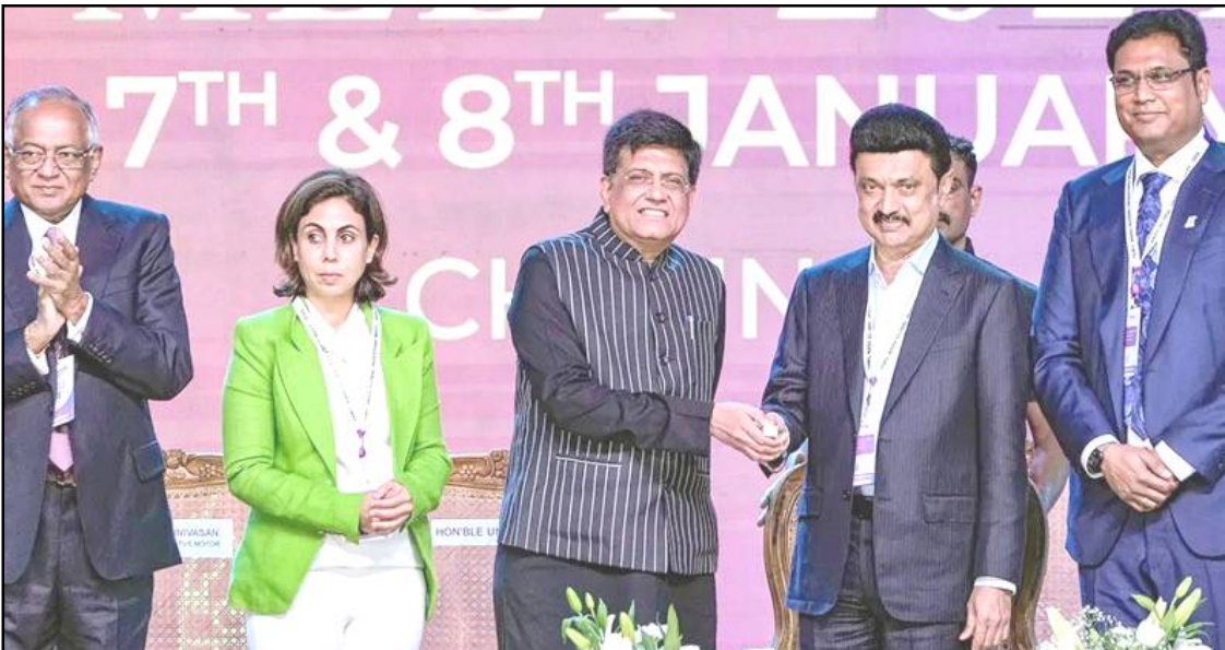
January 07, 2024 nü Chennai nung Global Investors Meet 2024 senden tetenzük sentong nung Union Commerce Minister Piyush Goyal, Tamil Nadu Chief Minister MK Stalin aser tangartem tangokba noksa nung angur.