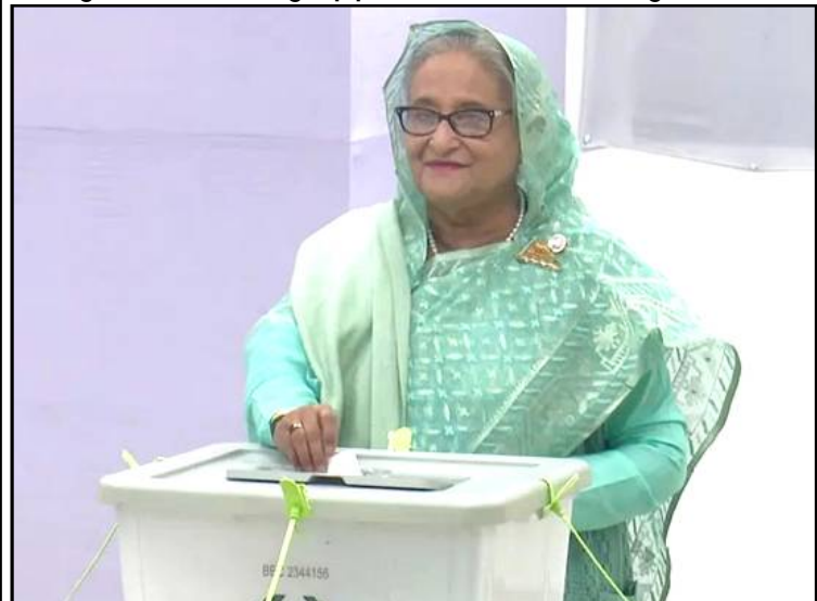
Deobarnü general elections agidang Bangladesh Ato Kilonser Sheikh Hasina-i Dhaka nung vote agütsüdang tangokba noksa nung angur. Bangladesh nung Deobarnü agiba election ya ajanga Ato Kilonser Sheikh Hasina kümsük pungo buba office nung amentsü tejangja lir, kechiaser opposition temi anema nokdaker aser aika puogo.

Dhaka, Aenjeti/January 07 (Agencies): Bangladesh nung Deobarnü general elections agiba sülen vote azüng