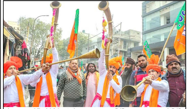
January 07, 2024 nü Jammu nung BJP pusemertemi BJP National Tir, JP Nadda agizüksü atatepdang tangokba noksa nung angur.