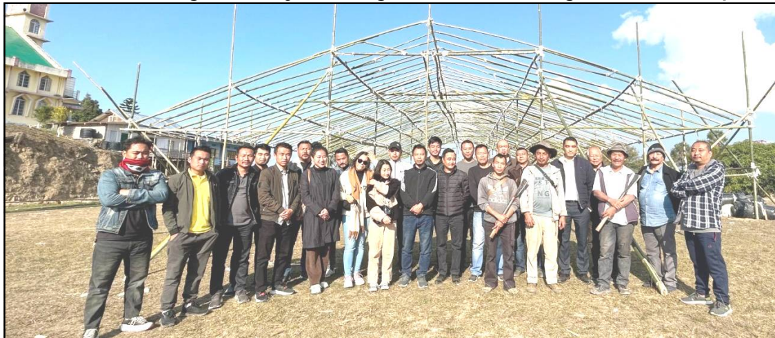
Tanu January 10 nü küpza yimtak shisalemsatepa maparen lemsateptsü asoshi OKM ketdangpurtem, OKM Planning Committee, OKM Local Planning Committee, Küpza Kaketshir Telongjem aser Küpza Putu yimsüsürtem telongjem senden ka mener kelen mungdang ki asüba tesem nung külemi tangokba noksa anur.

Mokokchung, January/Aenjeti 10(TYO) : Küpza yimtak 39 buba Ongpangkong Kaketshir Mungdang(OKM) "Nüchiba Shisaluyim" omen nung ajemdaker Inti Senden Sentong January 17 nungi 19 tashi amungtsü sentong renema lir.