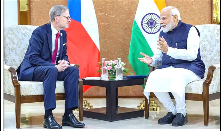
January 10, 2024 nü Gandhinagar nung Ato kilonser Narendra Modi aser Czech Republic Ato kilonser Petr Fiala na senden amendang tangokba noksa nung angur.

Iba mapang nungji Law Commission of India-i, tang aliba linük temzüng kübok ibaji meinyaktetsü, anungji ozüng tasen agizüktsü nüngdaker, ta metetdakja liasü.