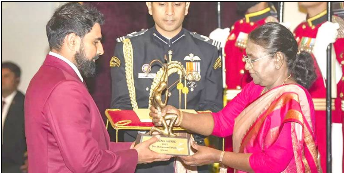
Tir Droupadi Murmu-i Rashtrapati Bhavan, New Delhi nung National Sports and Adventure Awards 2023 sentong agiba mapang cricket asayar Mohammed Shami nem Arjuna Award agütsüba noksa nung angur.

India nung batsmen Virat Kohli (775) aser Rohit Sharma (748) na trok aser 10buba nungi masetshi-i lir.