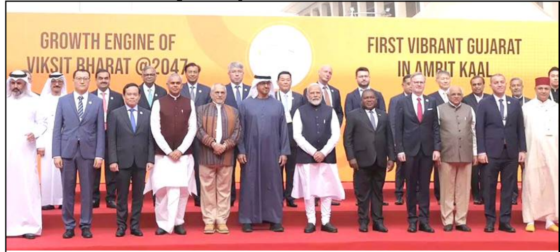
January 10, 2024 nü Gandhinagar nung Vibrant Gujarat Global Summit 2024 nung Ato kiloner Narendra Modi, UAE Tir Mohamed bin Zayed Al Nahyan, Czech Republic Ato kilonser Petr Fiala, Mozambique Tir Filipe Jacinto Nyusi, Timor-Leste Tir Jose Ramos-Horta, Gujarat Angh Acharya Devvrat aser Gujarat Chief Minister Bhupendra Patel nunger tangokba noksa nung angur.

Gandhinagar, Aenjeti/ January 10 (Agencies): Bodhbarnü Gujarat state nung sentong ka nung jembidang Ato kilonser, Narendra Modi-i, taruba küm 25 tashi nungbo India ya terenlok linük ka asütsü atema sorkari nukjidong yur inyaker, ta metetdaksü.