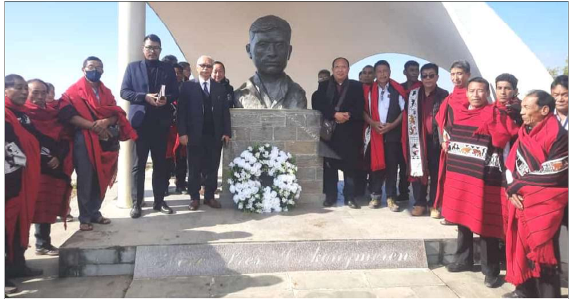
Longkhum yimtsüng nung Naga Club-i NNC Tatong Tir Imkongmeren Ao nem tetushi agütsüba mapang agiba noksa ka angur.

Dimapur, January 10, 2024 (TYO): January 10 nü Mokokchung district kübok Longkhum yimtsüng nung "Naga Magna Carta Day" nung Naga Club-i NNC tatong tir Imkongmeren Ao nem tetushi agütsüogo.