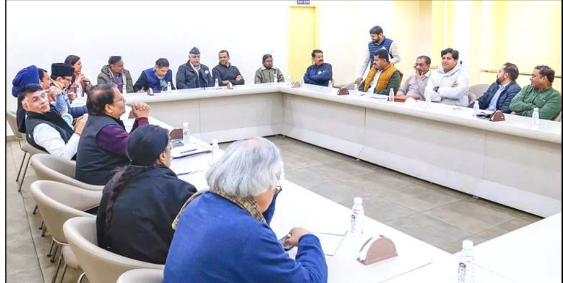
January 10, 2024 nü AICC Headquarters, New Delhi nung Congress lenirtem 'Bharat Jodo Nyaya Yatra' atema senden amendang tangokba noksa nung angur.

Senden nungji Kharge-i, Ram tekülem kidangji sarasadentsü janrgr lenirtem dang party-i tetuyuba agütsütsü menüngdak, ta ashi.