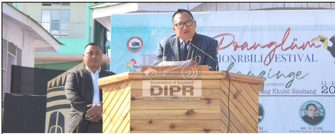
Parade Ground Tuensang nung January 11 nü Poanglüm Mini Hornbill Festival nung Deputy Chief Minister T.R Zeliang-i o jembiba noksa nung angur.

Dimapur, Aenjeti/January 11 (TYO): Poanglüm Mini Hornbill Festival 2024 January 11 nü Parade Ground Tuensang Town nung tenzükogo. Iba benjung ya January 13 nü tashi agitsü. Taküm Poanglüm benjung ya "Shensing" omen nung ajemdaker agidar.