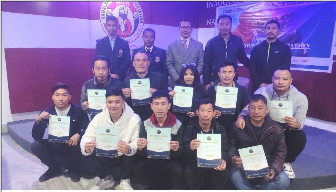
Trainees aser course instructors tem Kohima nung Brehostibarnü tangokba noksa nung angur.

Kohima, Aenjeti/January 11 (TYO): Wushu technical training Brehostibarnü Nagaland Olympic Association office complex, Koima nung tembangogo.