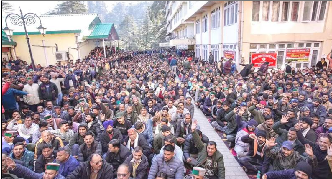
January 11, 2024 nü Shimla nung Himachal Pradesh electricity board nung inyakertemi Old pension scheme takhangba agüja longkak aitdang tangokba noksa nung angur.