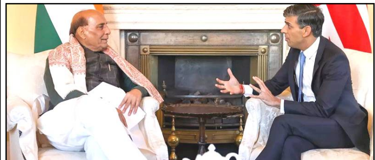
January 11, 2024 nü London nung India Defence Minister, Rajnath Singh aser UK Ato kilonser, Rishi Sunak na senden amendang tangokba noksa nung angur.

Parnokisa, yimti nung jana indokba gari 850 amshir aser item gari nung jana tapu balala bendanga abentsü atema compartments lir, ta metetdaksü.