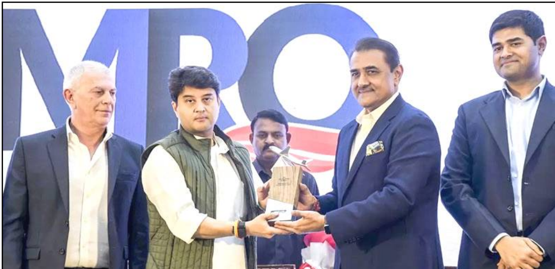
January 12, 2024 nü Nagpur nung AAR Indamer MRO facility semzükba sentong nung NCP lenir Prful Patel-i Union Minister of Civil Aviation, Jyotirditya Scindia agizükdang tangokba noksa nung angur.

2008 küm November ita nung Lashkar-e-Taiba züngsem 10-i anogo pezü tashi Mumbai nung tesem balala amakba mapang nung kiralongrar 9 densema nisung 175 asü aser nisung 300 dak tema pua liasü. Sepaitemi LeT kiralongrar Ajmal Kasab bo apu aser 2012 küm Pune nung aliba jail ka nung pa alenseta südaksü.