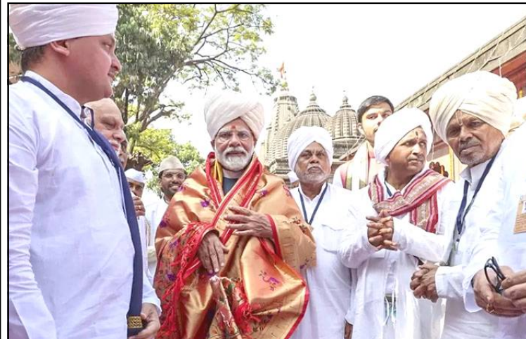
January 12, 2024 nü Nashik nung Ato kilonser, Narendra Modi-i Shri Kalaram tekülem ki semdangba mapang tangokba noksa nung angur.

Paisa tzüym nung security, talisa Red Sea region nung security atema India aser United States nati amalitepa inyaktsüji tongtibang, ta metetdakja liasü.