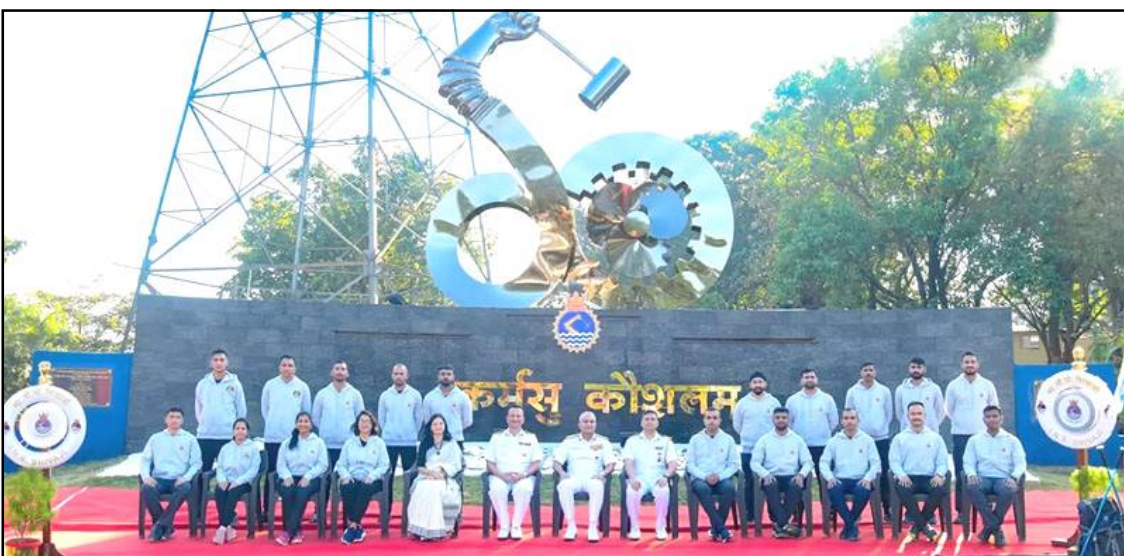
January 17, 2024 nü INS Shivaji, Lonavala nung Indian Navy Chadar Trek (Frozen Zanskar River, Ladakh) expedition tenzüksüba sentong nung Chief of the Naval Staff Admiral R Hari Kumar den tangartem tangokba noksa nung angur.

Tesüsabuba senden nung Indian National Developmental Inclusive Alliance (INDIA)-i Congress Tir Mallikarjun Kharge Chairperson shimogo.