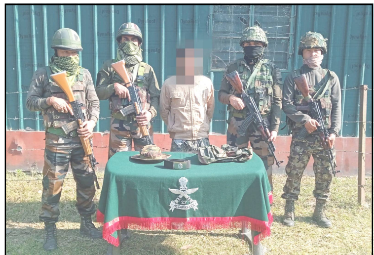
General area Tizit nung NSCN K (Angmai) telok nungi züngsem kar aliba osang tejangja nung ajemdaker Assam Rifles aser Nagaland Police ajanga January 14, 2024 nü operation agidang NSCN K (Angmai) telok nungi züngsem ka apu. Iba nisungba ya shishilempaba tesemtem aser nüburtem dang nungi tashiyim amshia senotsü meshiba maparen nung shilem agia liasü.

District nung department-i mapa tajung inyakba atema tenünsang agütsüba mapang DC-i ketdangsürtem dang yimtsüng balala nung bore well inokba maparen shidak inyaker asü masü ta asüngdanga liasü aser department dang community bore well/ community water reservoir amshitsü nüburtem nem awareness agütsütsü ayongzüka liasü.