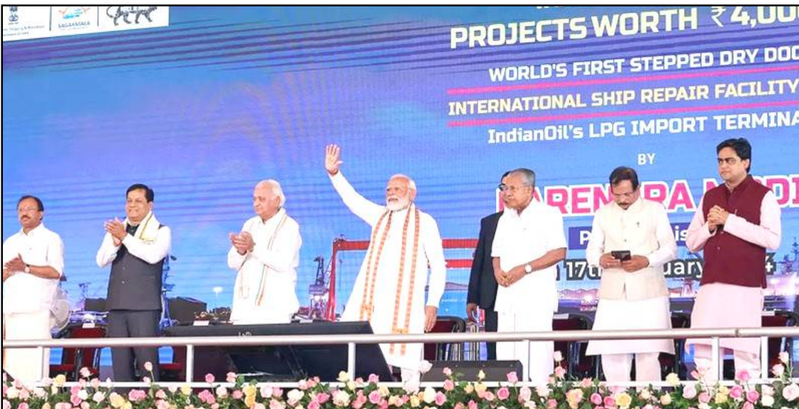
January 17, 2024 nü Kochi nung terenlok project balala semzüksüba sentong nung Ato kilonser Narendra Modi, Kerala Angh Arif Mohammed Khan, Union Ministers- Sarbananda Sonowal aser V. Muraleedharan na aser Kerala Chief Minister Pinarayi Vijayan nungertem tangokba noksa nung angur.