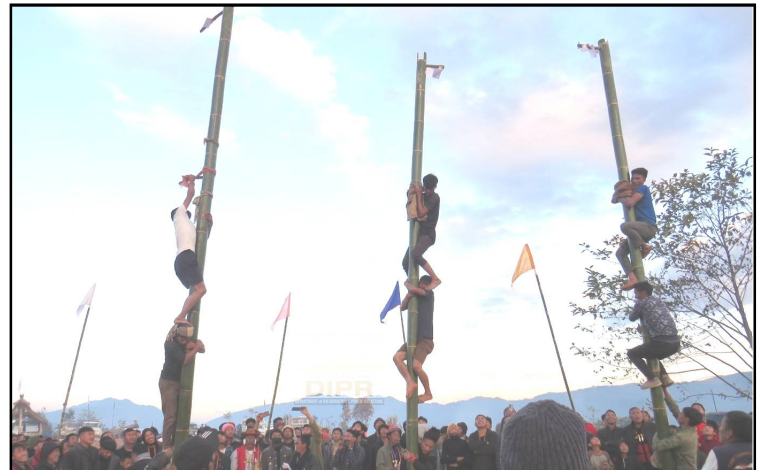
Tsungkamnyo cum Mini Hornbill Festival nung shilem ka ama Bodhbarnü Yimkhiung Heritage Village Mundun, Shamator nung indigenous games tetoktepba alidang tangokba noksa ka yangi angur.

Dimapur, Aenjeti/January 17 (TYO): Tsungkamnyo cum Mini Hornbill Festival nung shilem ka ama January 17, 2024 nü Yimkhiung Heritage Village Mundun, Shamator nung sobaliba sentong balala agiba den indigenous games tetoktepba agia liasü.