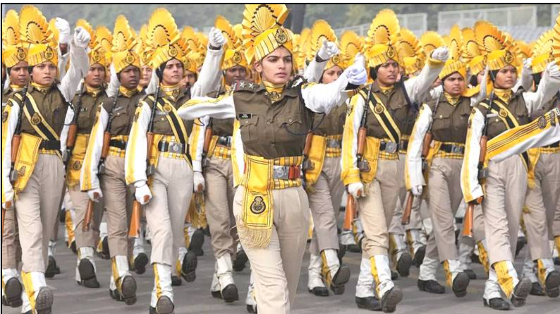
January 18, 2024 nü Kartavya Path, New Delhi nung Central Industrial Security Force (CISF) tetsür sepaitemi Republic Day Parade atema renemshidang tangokba noksa nung angur.