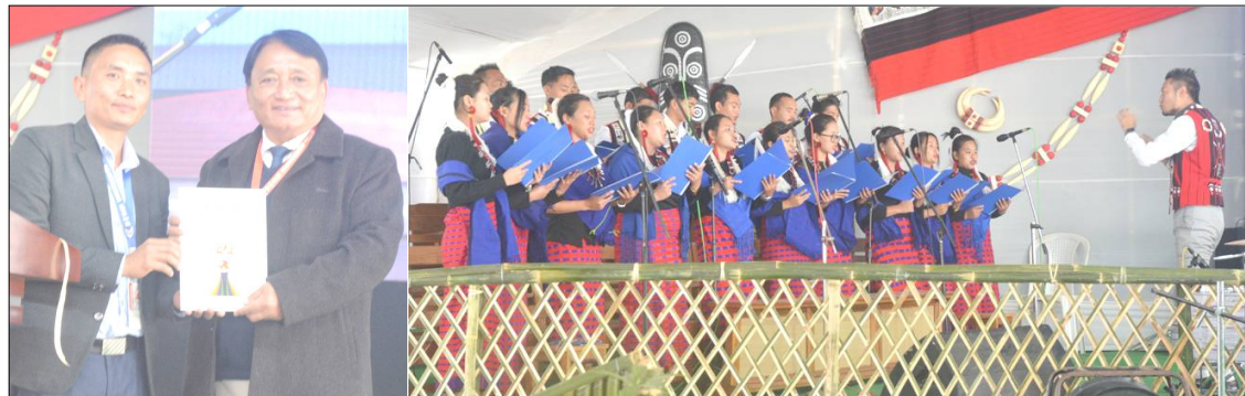
(Abelen) Tongti tesemdanger Metsübo Jamiri 'Limketer' kaket sayatsüdang aser (Achiji) Mungdang Choirtemi ken atandang tangokba noksa nung angur. Mokochung, 18th January, 2024.

Lanurtem tekolokbo lir sernung azümesener: Minister Metsübo Jamir