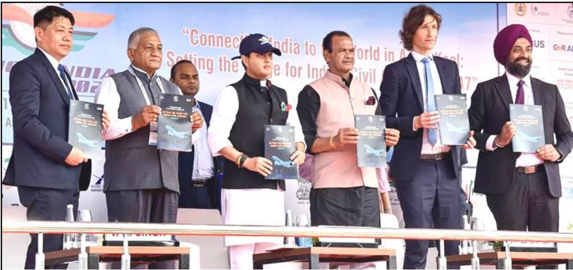
January 18, 2024 nü Hyderabad nung aliba Begumpet Airport nung Wings India 2024 tetenzük sentong nung Union Minister for Civil Aviation Jyotiraditya Scindia, Minister of State for Civil Aviation VK Singh, Ministry of Civil Aviation Joint Secretary Asangba Chuba Ao, Telangana Minister K Venkat Reddy aser tangartem tangokba noksa nung angur.