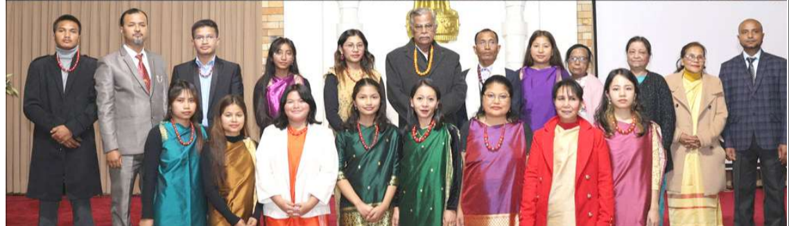
January 20, 2024 nü Raj Bhavan, Kohima nung Manipur, Meghalaya aser Tripura State Foundation Days amongdang agiba noksa angur.

Kohima, January 20, 2024 (PRO Raj Bhavan): Manipur, Meghalaya aser Tripura state tem Foundation day anogo ka jelia mongogo. January 20, 2024 nü Dr. Imkongliba Ao Hall, Raj Bhavan Kohima nung iba benjung among.