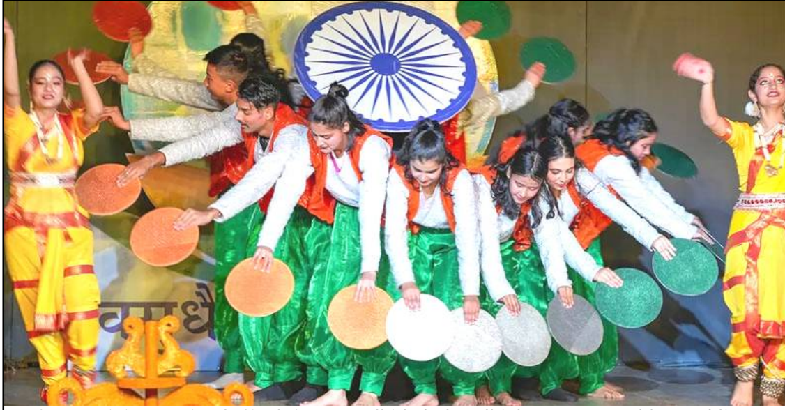
Defence Minister Rajnath Singh-i New Delhi kübok Delhi Cantt. nung NCC Republic Day parade 2024 camp semdangba mapang NCC cadet temi shilem agiba noksa nung angur.

mapang soti agütsüogo. "Anungji Ram Temple semzüka anogo state nung aliba nüburttem benjung nung shilem agitsü atema temelaba agütsütsüla ta bilemer. Anungji onoki iba anogo soti ama officially sangdongtsü mepeshir," ta pai ashi. Majumdar indang shiti dak sendakba nung TMC lenirtemi, Hindu almanac nung Ram Temple semzüksüba anogo indang kecha shia ali mali iba indang ashishia liasü. "Almanac mesüra tanga Hindu tamangba yimsü calendar nung Ram Temple semzüka anogo indang shisema ali mali? Sukanta Majumdar putir ka kümer asü? sentong nung BJP lenirtem aikati shilem agitsü lir aser iba ya Lok Sabha election matong tsüngda political sentong ka asütsü. BJP ama masü onokiba tamangba yimsü aser yimden yimsüsüba na memeyokteper," ta TMC otongdar Kunal Ghosh-i ashi. January 22 nü CM Banerjee lenisüba nung south Kolkata nung Hazra Crossing nungi Park Circus tashi 'rally for harmony' ka ayongzüka agitsü lir. Rally sülen lokti sendena ka agitsü.