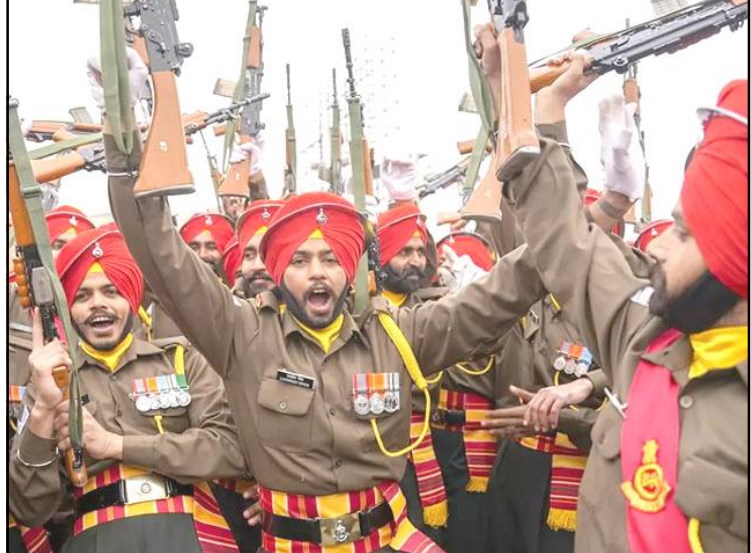
New Delhi nung Reublic day parade atema India Army Sikh Regiment sepaitem training agiba noksa nung angur.