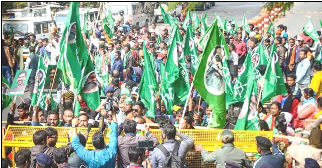
Jharkhand Mukti Morcha (JMM) züngsemtem Ranchi nung chief minister Hemant Soren'er kima adenshiba noksa nung angur. Enforcement Directorate (ED) ketdangsütemi Honibarnü Soren dang ochi mashi ken o ka nung ken o ashishitsü atema par ki semdanga liasü.