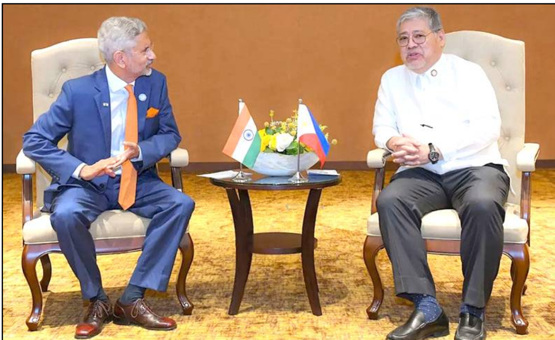
External Affairs Minister S. Jaishankar aser Secretary of Foreign Affairs of Philippines Enrique Manalo na Kampala, Uganda nung 19th Summit of Non-Aligned Movement (NAM) nung shilem agitsü lia senden amendang tangokba noksa ka yangi angur.

July ita China northeast tsütsü school gym indang kilem ka chirepba sülen nisung 11 asü.