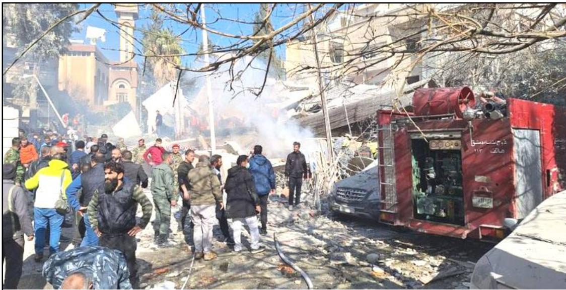
Mobile phone ajanga January 20, 2024 nü tangokba noksa ka nung Damascus, Syria nung nisung aliba ki ka raksar aliba angur. Syria yimtiba, Damascus nung Honibarnü Israel nungeri missile amshia amakdang Iran indang Islamic Revolutionary Guard Corps (IRGC) züngsem pezü asü ta ashir.